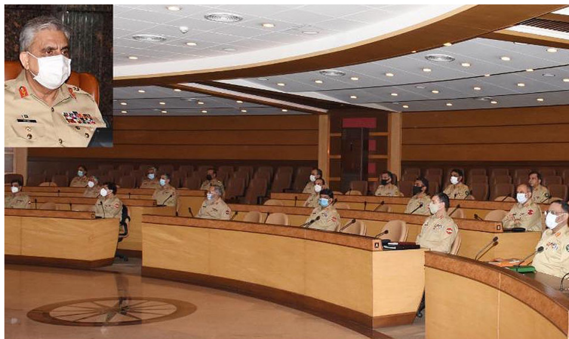
RAWALPINDI: Army Chief General Qamar Javed Bajwa presides over Corps Commanders Conference.