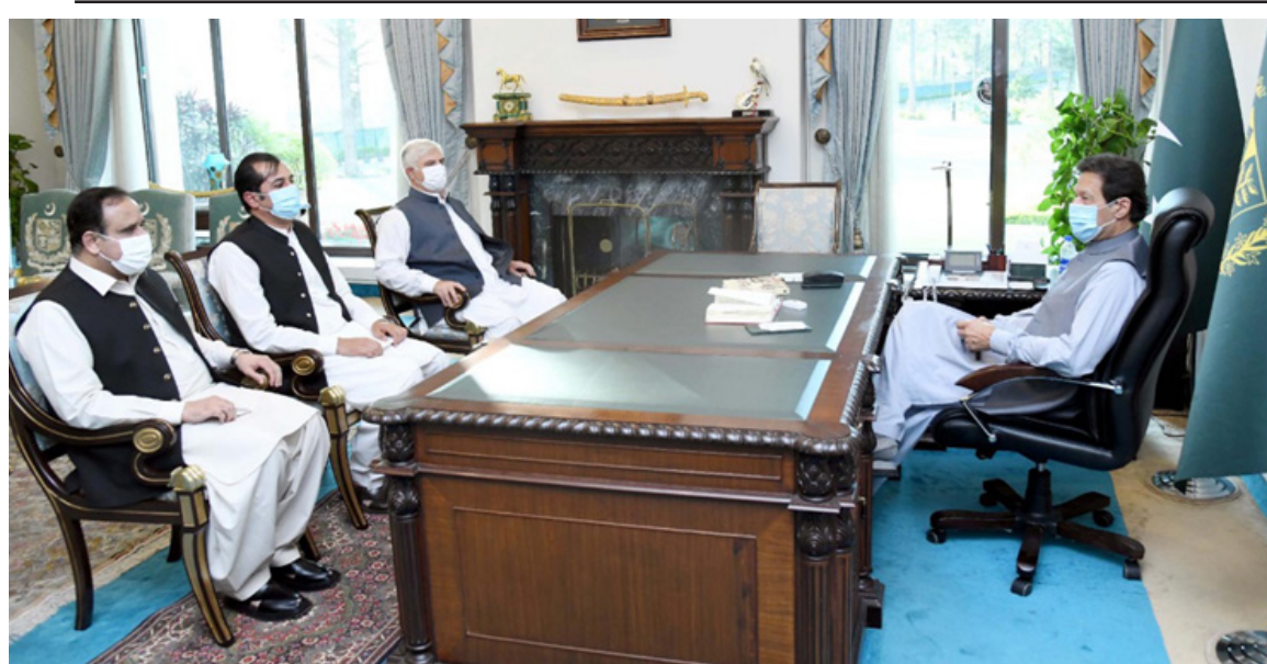
Islamabad: Chief Minister Punjab Sardar Usman Buzdar, Chief Minister Khyber Pakhtunkhwa Mehmood Khan and Chief Minister Gilgit Baltistan Khalid Khursheed call on Prime Minister Imran Khan.

were being established under the CPEC which would bring more Chinese investment in Pakistan and provide all possible facilities to foreign investors. He said that Challenge Group of China had set up an international standard industrial unit which he was happy to see and Challenge Group would also be setting up Challenge Fashion Export Park in Pakistan in future which would provide employment to thousands of people in Pakistan. "My purpose of coming here was just to provide all the infrastructure for Chinese investment and to address the lack of facilities," he said.