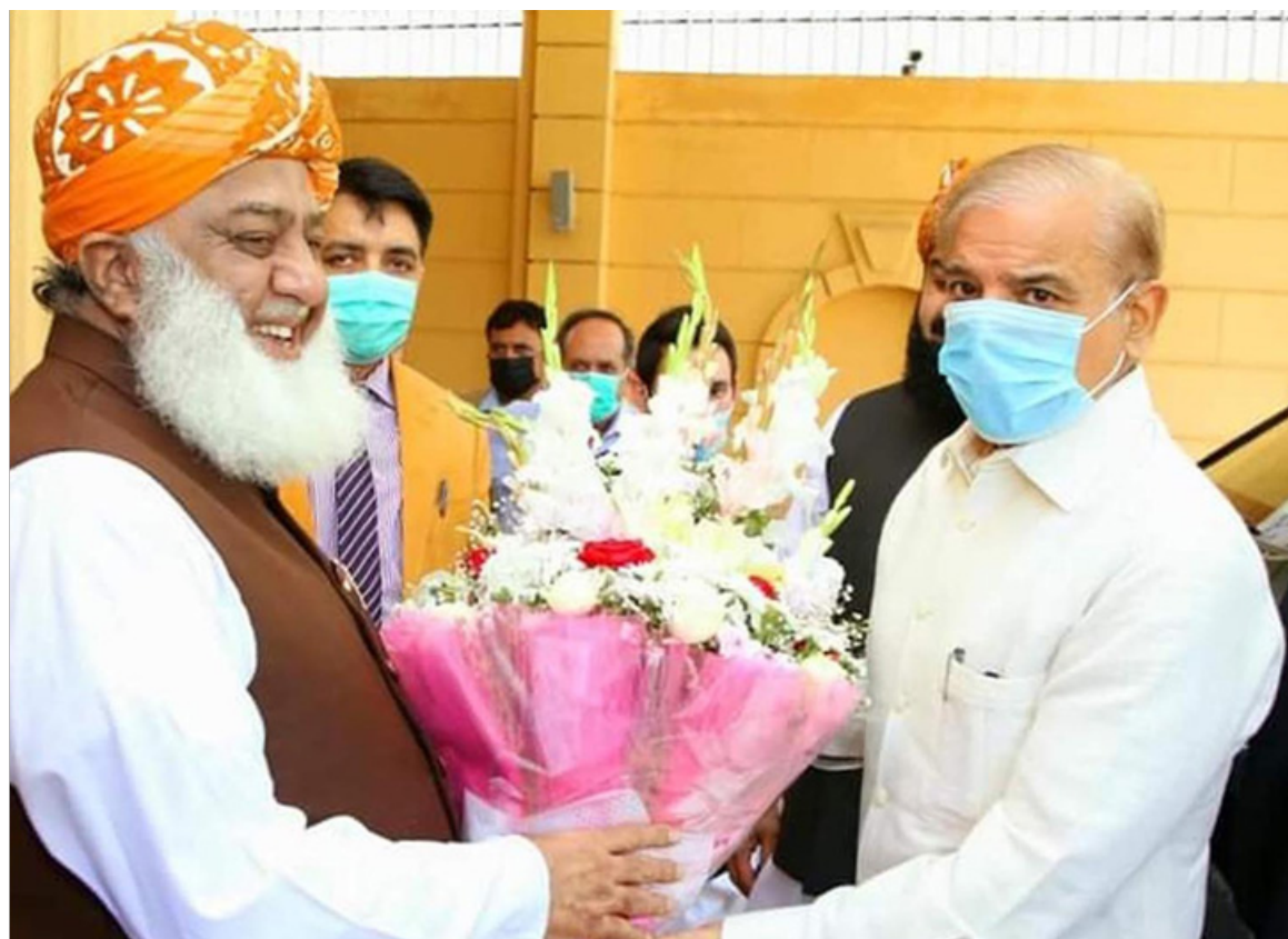
ISLAMABAD: PDM chief Maulana Fazl ur Rehman welcomes PML N President and Leader of the Opposition in the National Assembly Shahbaz Sharif. – DNA

In order to improve the rural economy, it was discussed to improve agriculture productivity through provision of improved seeds and efficient water management system. It was highlighted that cold storages are critical to manage short-term demand-supply gaps and price stability. While Minister for Economic Affairs Omar Ayub Khan, emphasizes on agriculture and rural transformation through improved connectivity. The Minister for Economic Affairs highlighted that lack of economic opportunities and limited connectivity of rural area with urban centers has caused the income gap between urban and rural residents. He said that rural development is vital to sustainable socioeconomic development and environmental viability of a country.