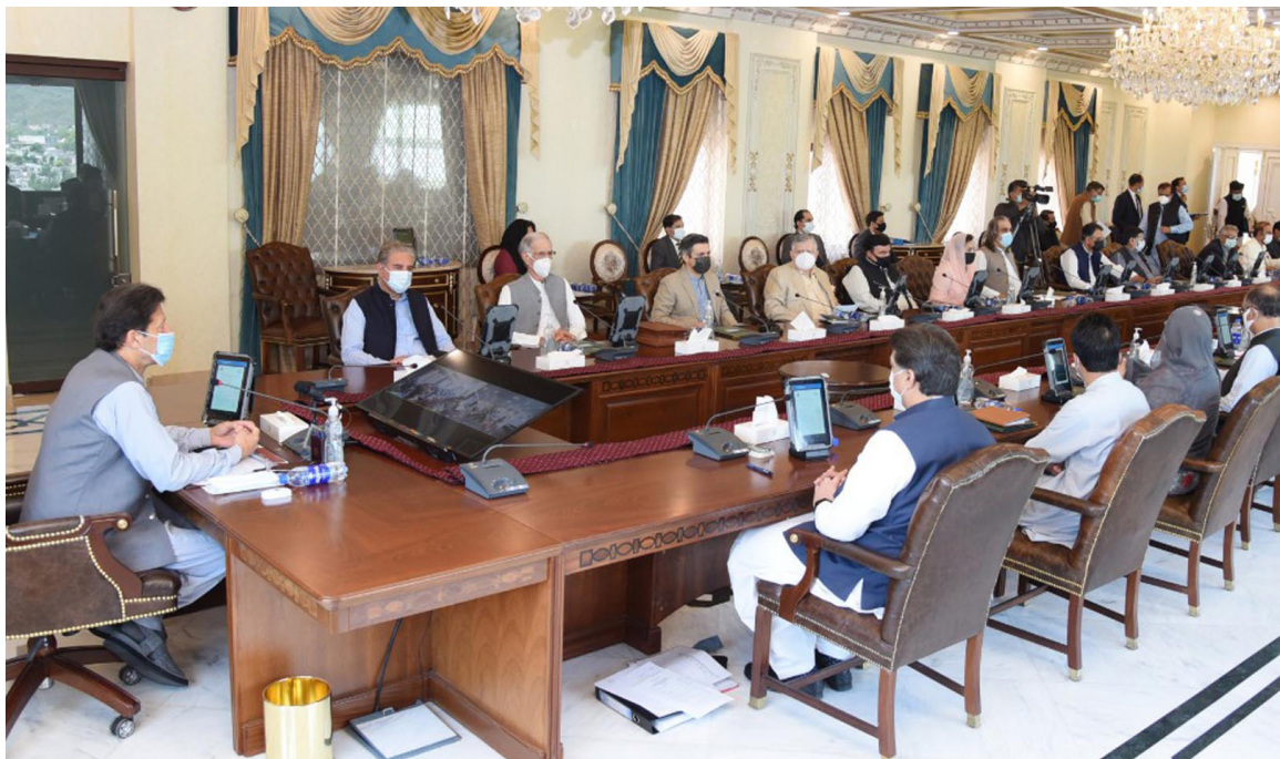
ISLAMABAD: Prime Minister Imran Khan chairs meeting of Federal Cabinet.

ISLAMABAD: Federal Minister for Education, Professional Training, National Heritage and Culture Shafqat Mahmood has tested positive for coronavirus. The federal minister, in a tweet on his official handle, revealed that he has tested positive for the virus; however, he feels fine with mild symptoms. On the other hand, Pakistan has reported 92 deaths in the last 24 hours by novel coronavirus as the number of positive cases has surged to 905,852.