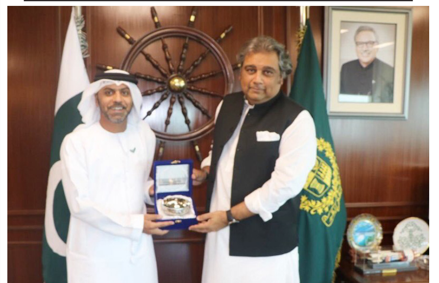
ISLAMABAD: Hamad Obaid Alzaabi, the UAE Ambassador in Islamabad, meets H.E. Ali Haider Zaidi, Minister of Maritime Affairs, and discusses bilateral work and joint projects between the two countries. - DNA