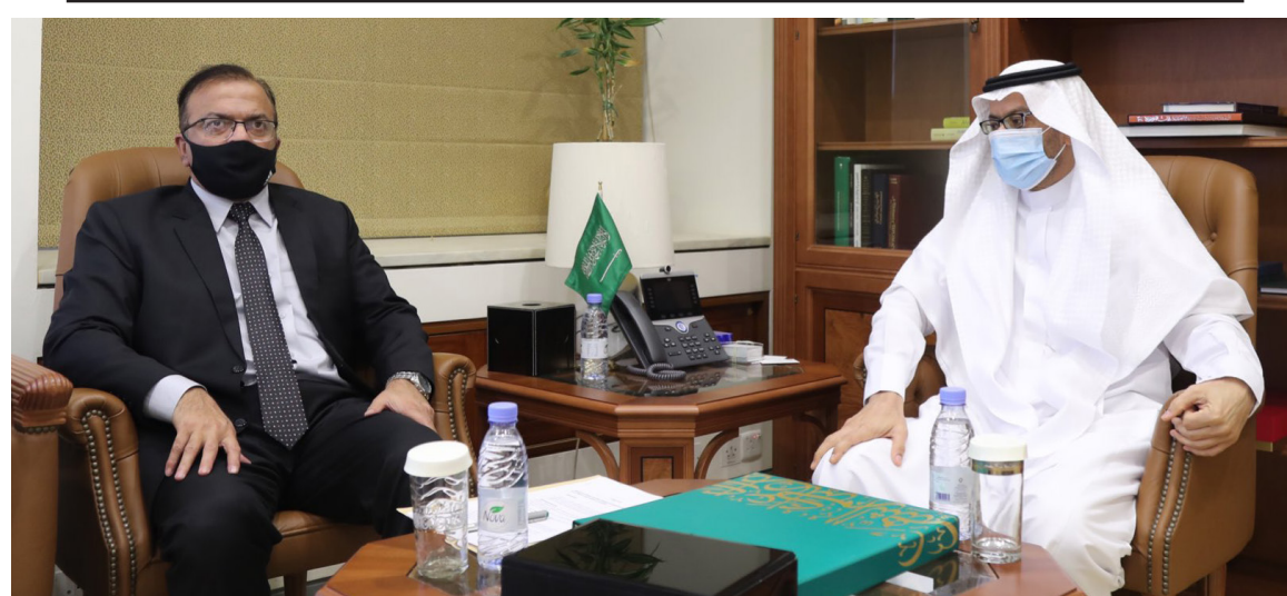
Riyadh: Ambassador of Pakistan to Saudi Arabia Bilal Akbar called on Saudi Deputy Minister for Political and Economic Affairs, Eid Mohammed Althagafi at Ministry of Foreign Affairs, KSA. Several matters entailing mutual interest were discussed. – DNA