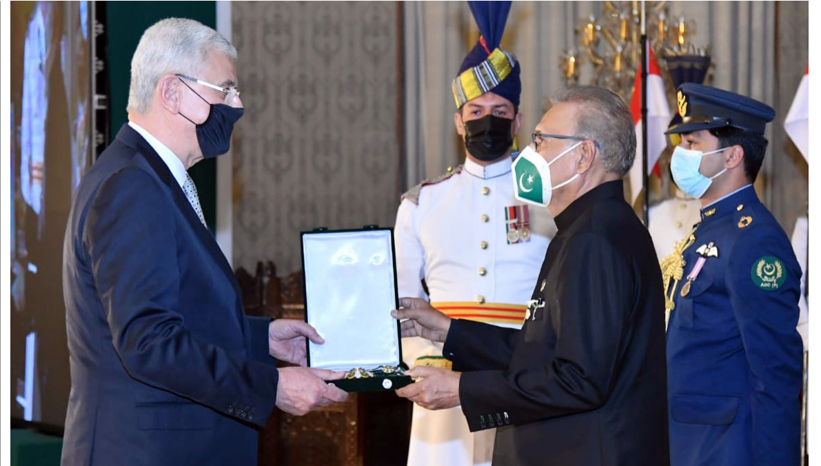
ISLAMABAD: President Dr Arif Alvi conferring the award of Hilal-e-Pakistan upon President UN General Assembly, Mr Volkan Bozkir, at Aiwan-e-Sadr.

For his part, Bozkir informed the prime minister about various initiatives the UNGA had taken during his presidency to address key international political and socioeconomic issues. Earlier, Bozkir said the status of the Jammu and Kashmir dispute must not be changed unless resolved as per the resolutions of UN Security Council. Addressing at a joint presser with Foreign Minister Shah Mahmood Qureshi, the UNGA president said the resolution of Jammu and Kashmir lay with the implementation of the UN Charter and through peaceful means as decided between Pakistan and India under Simla Agreement. The UNGA president urged the parties on both sides to "refrain from changing the status of the dispute" otherwise. Volkan Bozkir, who arrived here Wednesday on a three-day visit, focused his press conference on the issues of Palestine, Jammu and Kashmir, Afghanistan, and the role of UN in handling the conflicts.