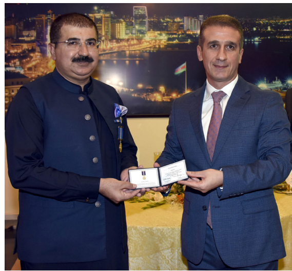
diplomatic ties and friendship one step higher. He acknowledged the award and expressed gratitude to the leadership of the Republic of Azerbaijan.

He further said that ties between the two countries are based on historical cultural bonds, mutual respect and trust. He also extended his good wishes to the leadership, government parliament and people of Azerbaijan on their National Day. He thanked the ambassador for presentation of the jubilee Medal of 100th Anniversary of diplomatic service of the Republic of Azerbaijan. He said that it signifies the sincerest wishes of Azerbaijan to take our