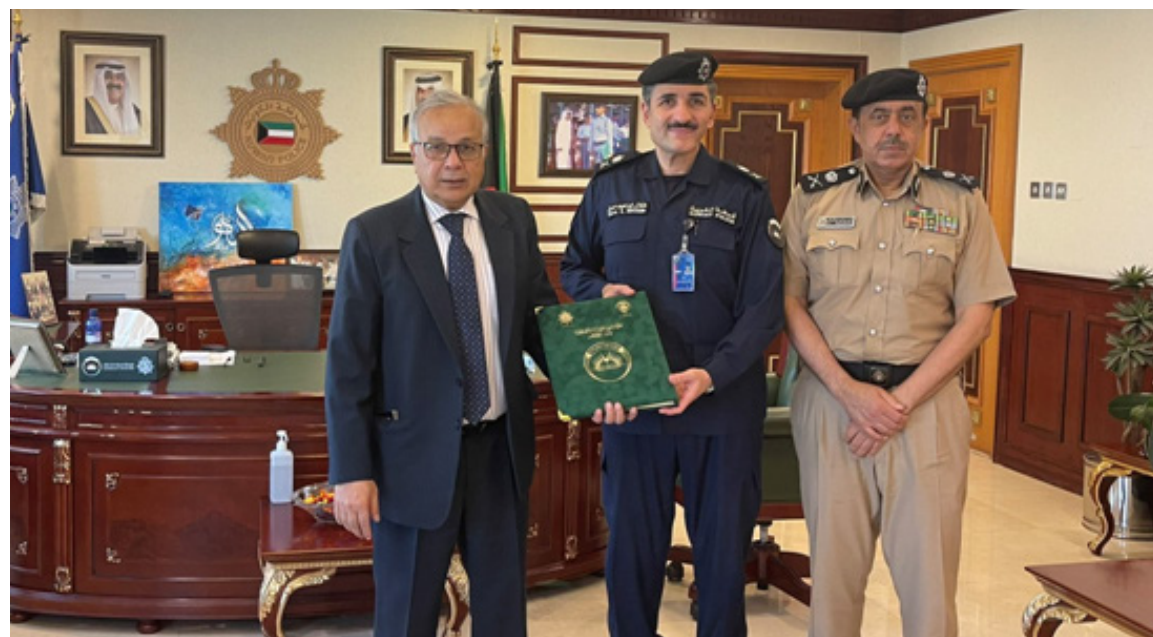
KUWAIT CITY: Pakistan ambassador to Kuwait Syed Sajjad met Maj. General Talal Ibrahim Maarfe and Maj. General Ali Al Muali of Rehabilitation/ Law Enforcement Affairs of Kuwait. CWA also participated in discussion on issues of mutual concern. - DNA

In March 2020, it was Mid-winter in Khunjerab Pass. The vanguard team of Khunjerab Customs House had worked for six hours straight to release the first batch of medical supplies aid to Pakistan. Ma, one of the vanguard team members, recalled that, "It was -30c at that time. - DNA