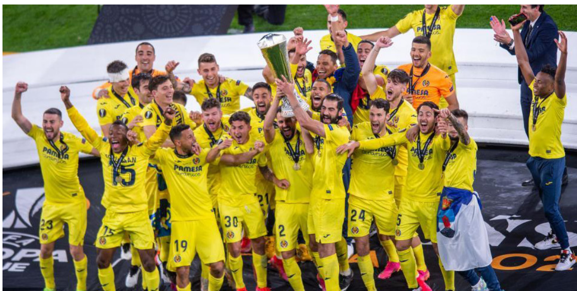
GDANSK: Villarreal players celebrate after winning the UEFA Europa League final match between Villarreal CF and Manchester United in Gdansk, Poland.

replaced Spanish Rafael Benitez on a two-and-a-half-year contract when he was 43-year-old. In his first tenure, the Frenchman led Real Madrid to win Champions League trophies three times in a row from 2016 to 2018. Zidane was back in charge of Real Madrid in March 2019, since the Spanish side suffered some poor results during the 2018-2019 season. Following this disappointing season, Zidane's impact on Real Madrid was immediate, leading his team to secure a record 34th league title in the 2019-2020 season. Regarded as one of the most decorated Real Madrid managers in history, Zidane won three Champions League trophies, two Club World Cups, two UEFA Super Cups, two Spanish Super Cups, and two LaLiga titles in Madrid.