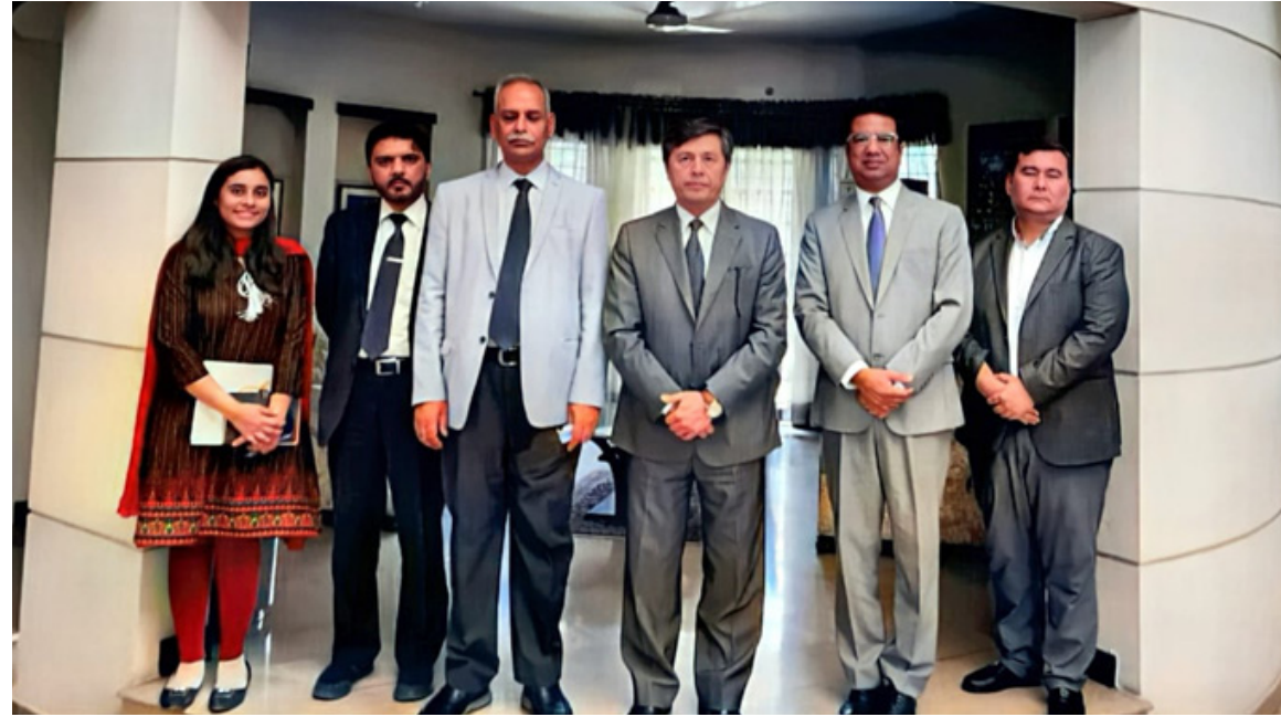
Strategic Studies (CGSS), Islamabad in bridging the gap between the academic institutions of Pakistan and Uzbekistan. The development of academic linkages between the two countries is fundamental for a holistic regional connectivity. Furthermore, areas of mutual interest particularly research, stu-