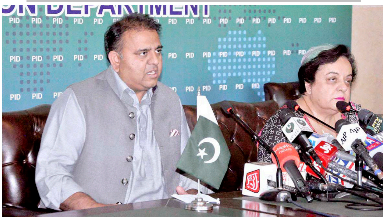
ISLAMABAD: Federal Minister for Information and Broadcasting, Fawad Ahmed Chaudhry and Federal Minister for Human Rights, Dr. Shireen Mazari addressing a press conference at PID media Center Pak-China Friendship Centre.