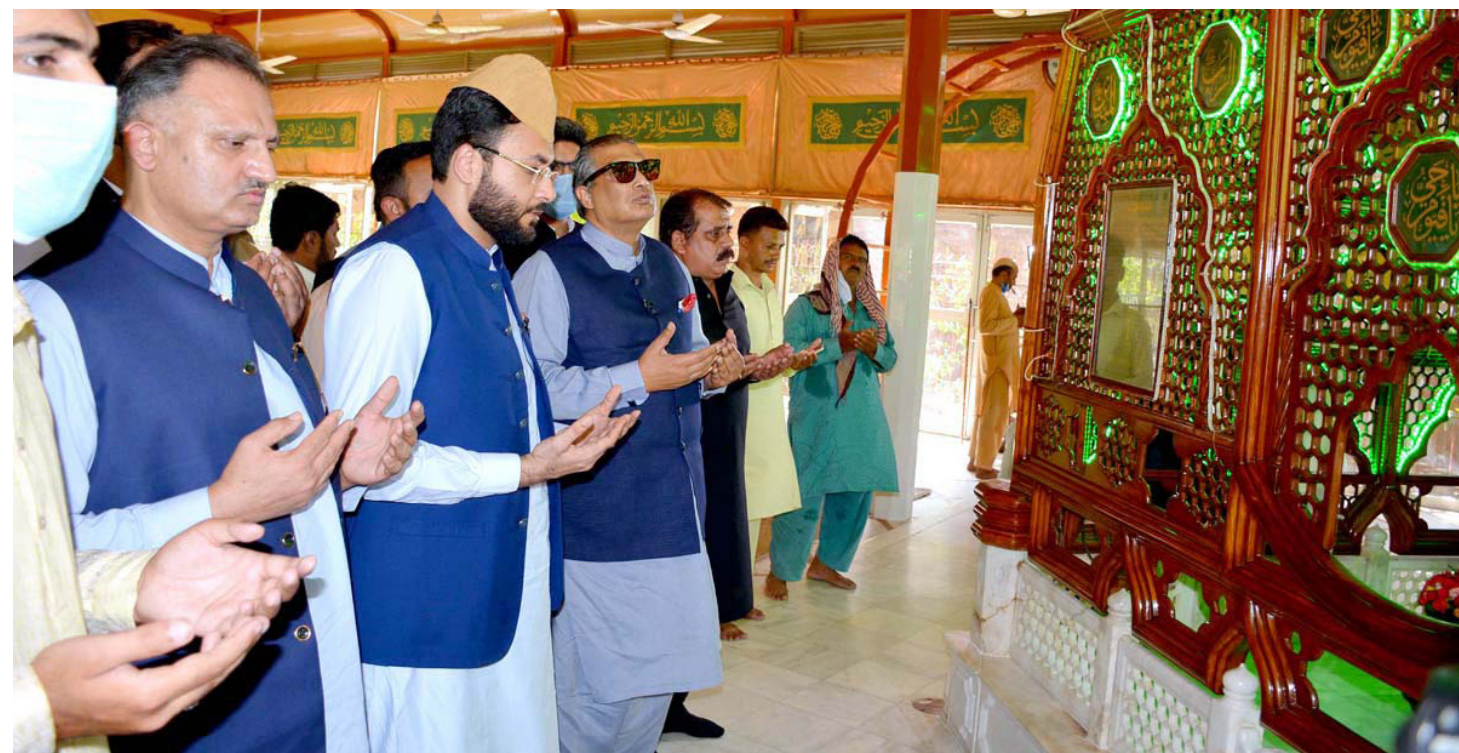
FAISALABAD: State Minister for Information & Broadcasting Farrukh Habib is offering 'Fateha' at mausoleum of Sufi Barkat Ali in Dalawal at Samundri Road.

KARACHI: As many as 15 more patients of Coronavirus died overnight lifting the death toll to 5,003 and 1252 new cases emerged when 15,440 tests were conducted. This was stated by Sindh Chief Minister Syed Murad Ali Shah in a statement issued here on Friday. He added that 15 more patients of COVID-19 lost their lives lifting the death toll to 5,003 that constituted 1.6 percent death rate. He said that 15,440 samples were tested which detected 1252 cases that constituted 8.1 percent current detection rate. He added that so far 4,061,903 tests have been conducted against which 315,393 cases were diagnosed, of them 90.7 percent or 285,975 patients have recovered, including 572 overnight. The CM said that currently 24,415 patients were under treatment, of them 23,402 were in home isolation, 22 at isolation centers and 991 at different hospitals. He added that the condition of 937 patients was stated to be critical, including 74 shifted to ventilators. According to the statement, out of 1252 new cases, 780 have been detected from Karachi.