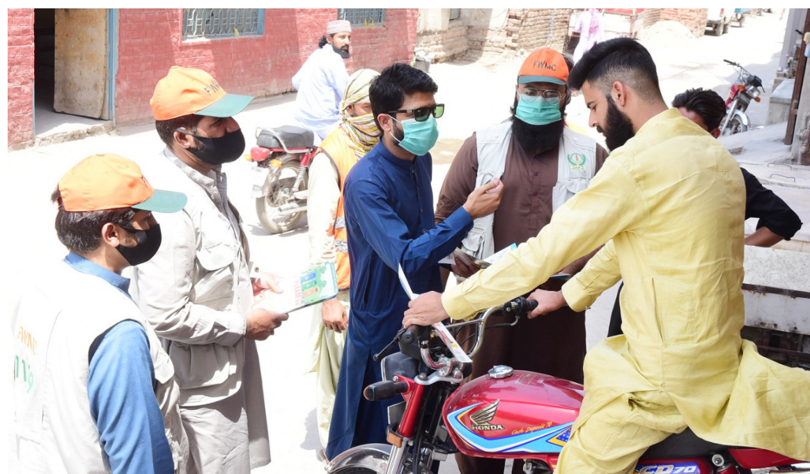
FAISALABAD: Under the program Khidmat Aap ki Dehleez Par the team of FWMC asking the performance from citizen.

efficient regulatory measures and one window operation in according to its true spirit to attract and facilitate the foreign as well as local investors. Regarding one time waiver of custom duty on import of machinery for new investment, he said that this facility is quite insufficient particularly in the prevailing circumstances as they have to pay sales tax and income tax while during the exemption period, industrialists have to import new machinery along with its spare parts without this facility. He said that the Government has done a commendable job by improving the EODB but still investors are facing multiple problems and the Government must intervene and facilitate them.