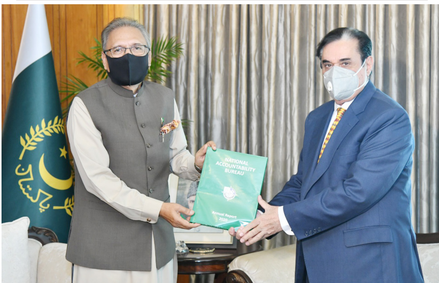
ISLAMABAD: Chairman NAB, Justice (R) Javed Iqbal, presenting NAB Annual Report 2020, to President Dr. Arif Alvi, at Aiwan-e-Sadr.