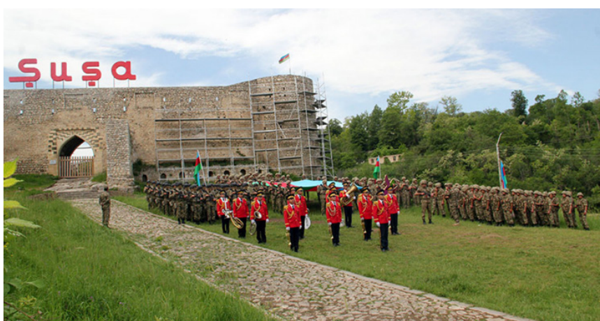
SHUSHA: On the occasion of 28 May - Republic Day, a solemn event was held in the Shusha city with the participation of the servicemen of the Azerbaijan Army. — DNA