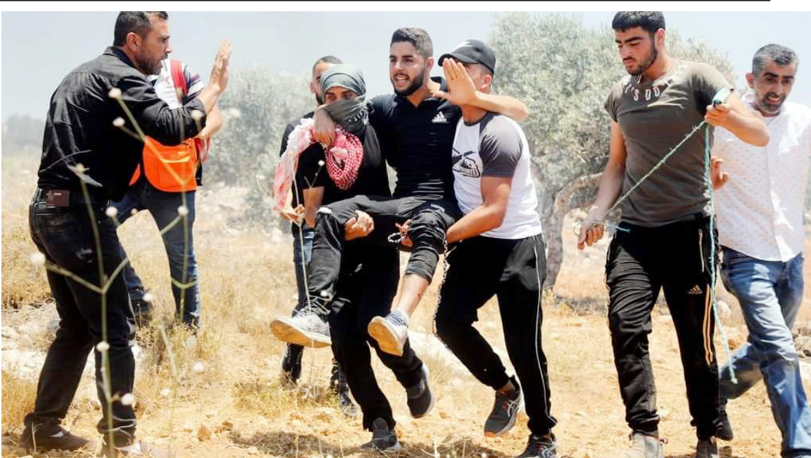
NABLUS: Several Palestinian protesters were injured in clashes with the Israeli occupation forces in the flashpoint Jabal Sabih mount in the occupied West Bank village of Beita.

travel to one of the world's most-loved holiday spots. The Dubai-Phuket route will be operated with a Boeing 777-300ER in a three-class configuration, offering premium services in First and Business Class as well as Economy Class. Emirates flight EK378 will depart Dubai on Tuesdays, Fridays, Saturdays and Sundays at 03:00hrs, arriving at Phuket International Airport at 12:30hrs the same day. The return flight, EK379, will depart Phuket at 00:10 hrs, on Wednesdays, Saturdays, Sundays, and Mondays, arriving in Dubai at 03:05hrs the same day (all times are local).