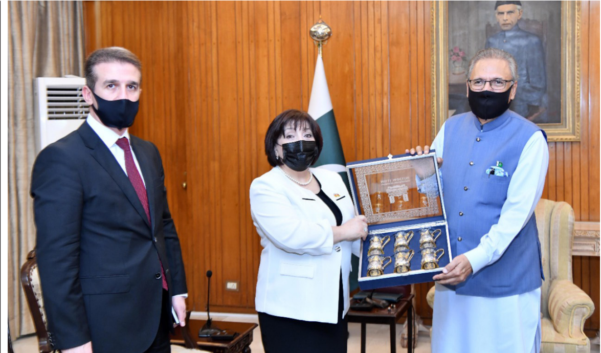
ISLAMABAD: Speaker of the Parliament of Azerbaijan, Prof. Sahiba Gafarova, presenting a souvenir to President Dr Arif Alvi, at Aiwan-e-Sadr.

ister Imran Khan's vision to reach out to the overseas Pakistanis and his recent interactions with the Pakistan Missions abroad and subsequent stress laid by Foreign Minister Shah Mahmood Qureshi in his routine communication with the heads of Missions were aimed at giving the overseas Pakistanis confidence that the government deeply cared for and valued their contribution to the national development. He said Pakistan High Commission Canada and all its Consulates were ready to serve the Pakistani community and provide them with hassle-free consular services. During the webinar, it was noted that out of US $ 1.25 billion deposited by overseas Pakistanis in Roshan Digital Accounts, a handsome amount of US $ 800 million had been invested in Naya Pakistan Certificates due to best market rates available under the scheme. It was assured that the RDAs were a secure and protected mode of investment and only the best Pakistanis banks having robust financial health and strong IT solutions had been roped in the scheme to make it a success.