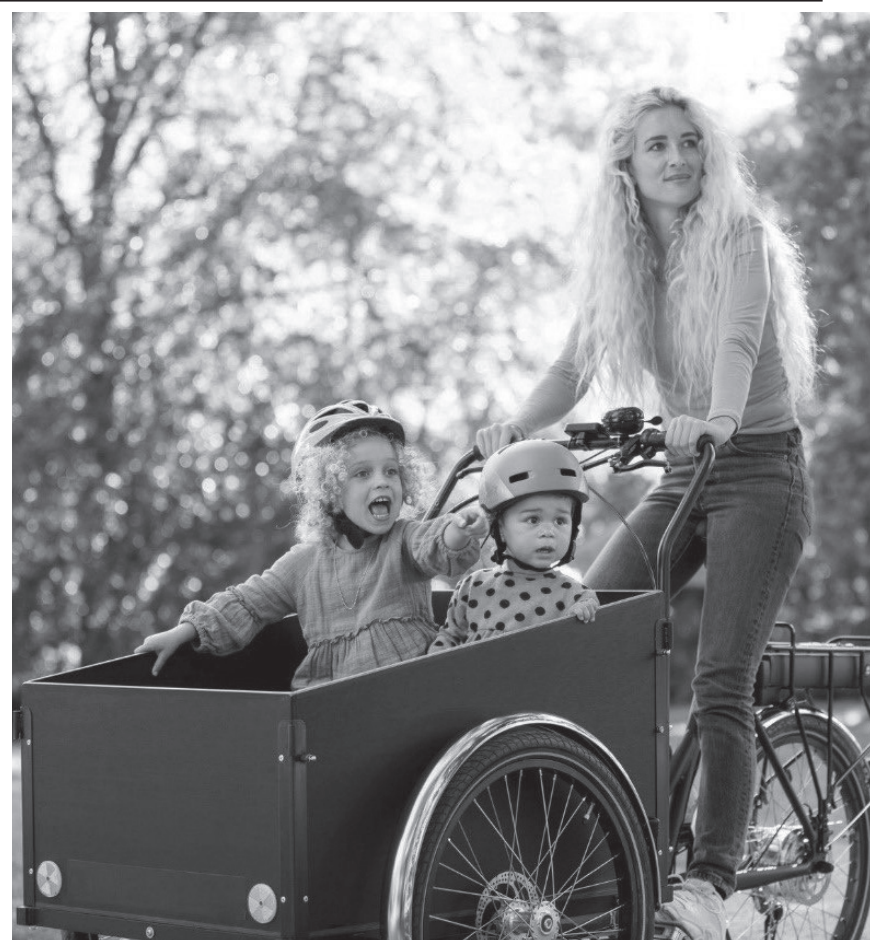
ISLAMABAD: A foreigner takes part in a cycling event along with her children.

ISLAMABAD: Chief Minister Punjab Usman Buzdar's aide Dr. Firdous Ashiq Awan on Friday said that the conspiracy to derail the democratic system would fail miserably as economic team would prepare a 'pro-poor and relief-oriented' budget for the next fiscal year. Current government would present an excellent, balanced and people-friendly budget but opposition's conspiracies before budget is only aim to get political point scoring, she said while speaking to a Private news channel. She said the anarchistic political designs of PDM alliance have come its logical end, adding, deceiving public is the old habit of the opposition but it could not fool the masses anymore.