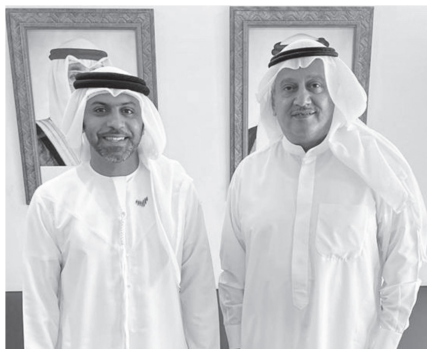
ISLAMABAD: Hamad Obaid Alzaabi, the UAE Ambassador in the Islamic Republic of Pakistan, meets H.E Nassar Al-Mutairi, the Ambassador of Kuwait in Islamabad, and discusses bilateral work and cooperation and joint initiatives and plans between the Embassies of the two brotherly countries.

ISLAMABAD: The Pakistan Meteorological Department (PMD) on Friday predicted hot and dry weather likely to prevail in most parts of the country during next 24 hours. According to Meteorological office Islamabad, rain wind-thunderstorm is expected in South Punjab, Upper Sindh and north-east Balochistan, Kashmir and its adjoining hilly areas. A westerly wave is affecting upper and central parts of the country and likely to persist till Saturday (today). Maximum temperature was recorded in Nokkundi 47 & Dalbandin 46.