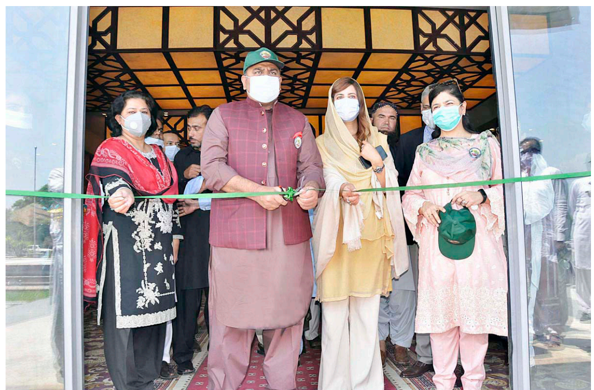
ISLAMABAD: Federal Minister for Information & Broadcasting Chaudhary Fawad Hussain & Minister of State for Climate Change, Zartaj Gul cutting ribbon to inaugurate Photographic Exhibition organized by Directorate of Electronic Media & Publications in connection with World Environment Day at Pak-China Friendship Center.