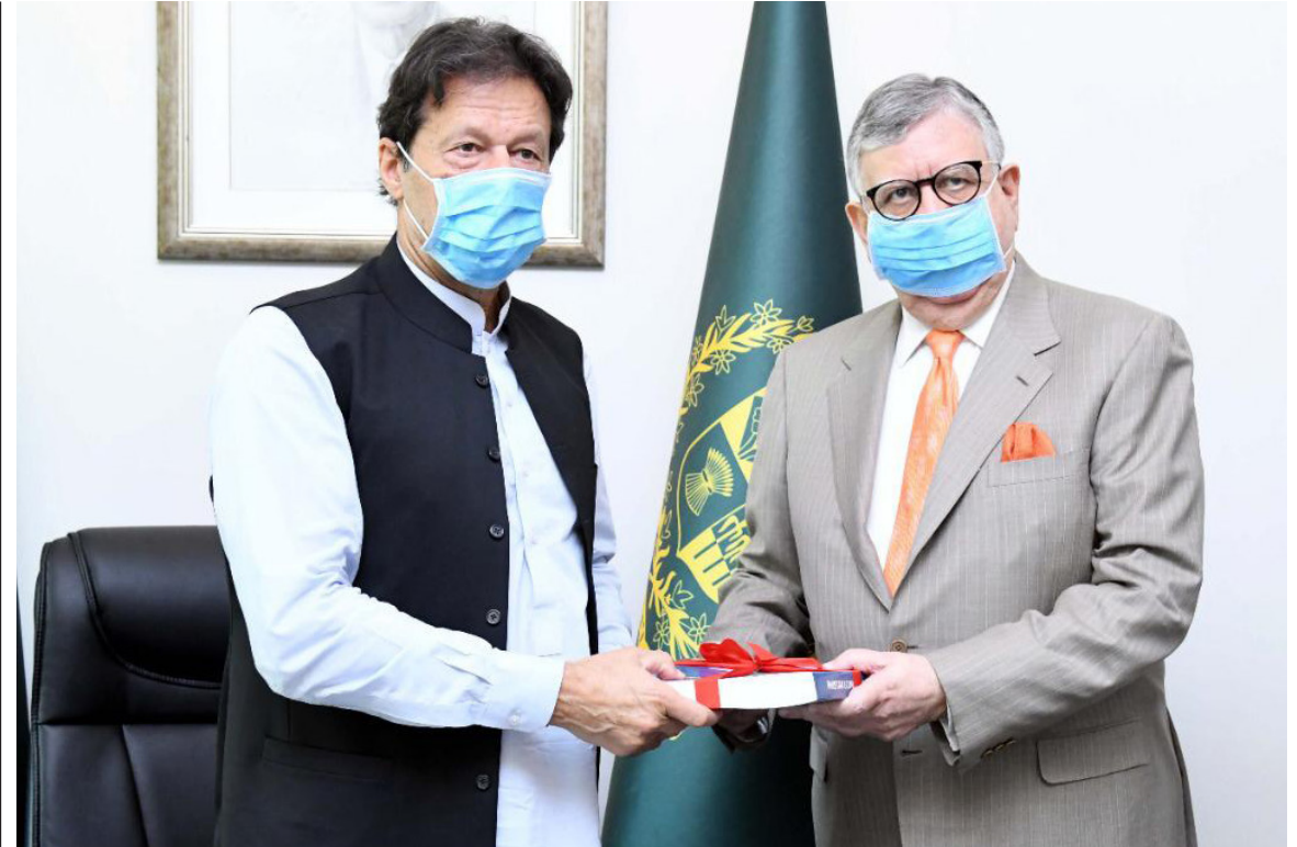
ISLAMABAD: Finance Minister Shaukat Ahmed Tarin presents Pakistan Economic Survey 2020-21 Report to Prime Minister Imran Khan.

Army for supporting national polio drive and ensuring proper reach and coverage of polio campaigns this year, particularly through involvement of community leaders and influencers. Moreover, he also appreciated Pakistan's successful COVID-19 pandemic campaign and Pakistan Army's tremendous contribution to bring it within manageable level. During the meeting, matters related to Pakistan's commitment for comprehensive Polio eradication were discussed.