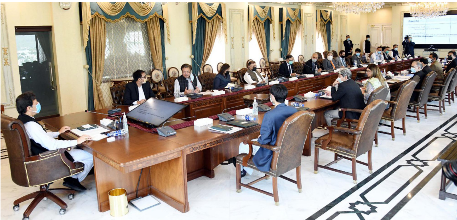
ISLAMABAD: Prime Minister Imran Khan chairs a review meeting regarding facilitating investments.

ISLAMABAD: The Supreme Court has disposed of a case of the savage murder of 11 Pakistani Hindus in India on the assurance of the federal government saying that the court cannot interfere in the policy matters of the government. A three-member Supreme Court bench headed by Justice Umar Ata Bandial on Thursday heard a petition filed by SharmatiMakhni against the murder of her family members in India. The apex court said that the Ministry of Foreign Affairs was looking into the matter seriously. It said that the federal government had assured the court that it would order an investigation into the killings that happened in neighbouring country through its Foreign Ministry. The learned court said that it could not interfere in the policy matters of the government. It further said that the Foreign Ministry was looking into the matter seriously. The counsel for the petitioner, Syed Qalb Hassan, said that his client wanted the foreign minister to talk to the Indian government on this matter. Justice Mansoor Ali Shah questioned what the court could do in this matter.