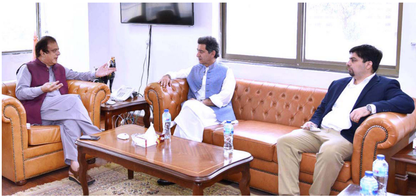
ISLAMABAD: Federal Minister for Science and Technology, Shibli Faraz in a meeting with KPK Minister for Food, Science and Information Technology Atif Khan.

PESHAWAR: The Khyber Pakhtunkhwa Integrated Tourism (KITE) project in collaboration with DTS has given training to 500 people in different training sessions on awareness of Covid SOPs and guidelines for reopening of tourism sectors. The objective of the training sessions being held simultaneously in Swat, Abbottabad, Mansehra, Dir Upper and Peshawar was to give orientation to district administration, TIC, Gilyat Development Authority, Kaghan Development Authority (KgDA) Rescue-1122, police and other stake holders. The participants were given training on SOPs for hospitality sector and its impact on tourism sector. The aim of training creating awareness among staff of local hotels, restaurants, travel and tour operators for going business with safety of tourists in the wake of Covid-19. - APP