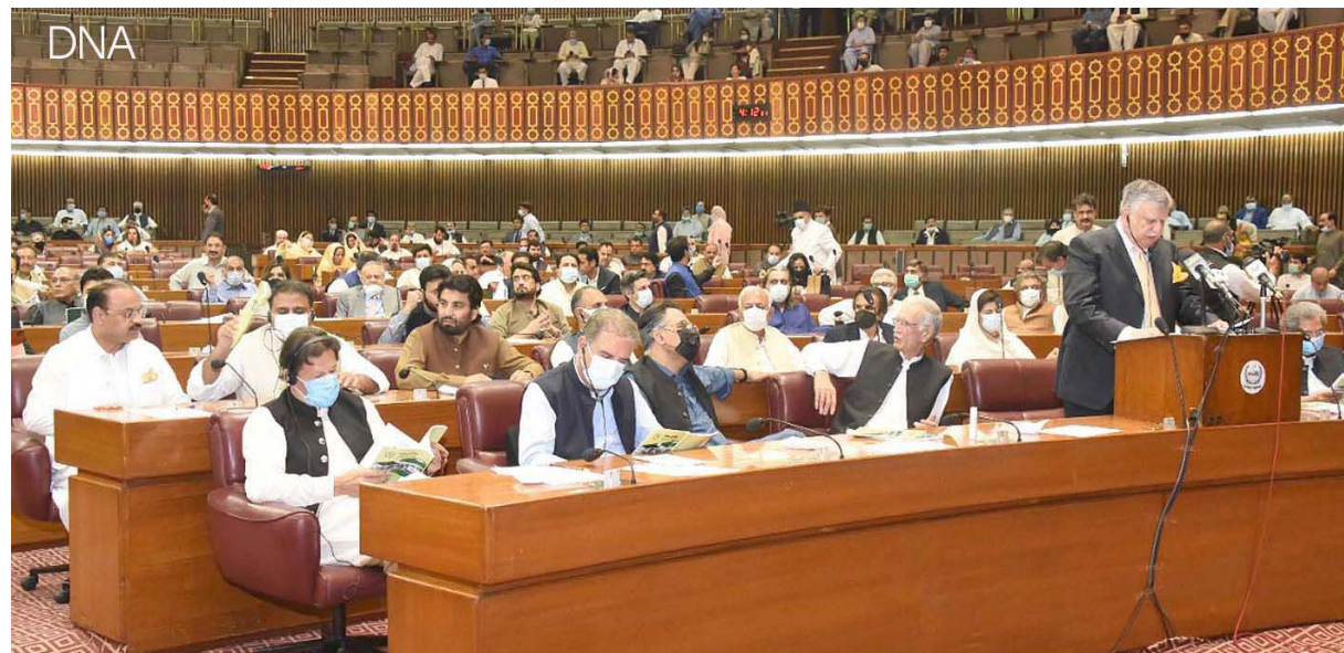
ISLAMABAD: Finance Minister Shaukat Tareen presenting budget in the National Assembly.

ISLAMABAD: The enterprises of the Special Economic Zones (SEZs) being built under the China Pakistan Economic Corridor (CPEC) are proposed to be exempted from the minimum tax for the year of 2021-22 and onwards. The minister for finance and revenue Shaukat Tarin in his budget speech here on Friday said the SEZs are a key project of the mega CPEC project. He said the SEZ enterprises were earlier exempted from tax however under the law, they are still liable to pay minimum tax on their turnover which was causing hardship to the investors.