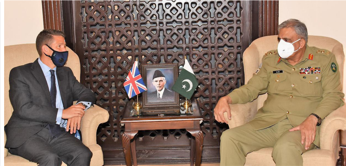
RAWALPINDI: Dr. Christian Turner, British High Commissioner called on General Qamar Javed Bajwa, Chief of Army Staff (COAS).