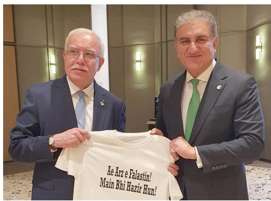
ANATLYA: Shah Mahmood Qureshi Foreign Minister of Pakistan presenting a T-shirt with "Ay Arze Palestine Mey Bhi Hazir Hoon (O the land of Palestine I also stand with you) to his Palestinian counterpart Dr Riyad al-Maliki prior to their meeting in Antalya.