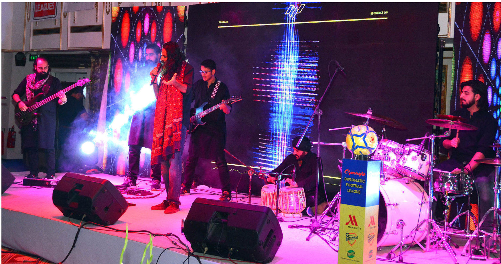
ISLAMABAD: Musicians perform during prize distribution ceremony of diplomatic football league.

ISLAMABAD: Indus River System Authority (IRSA) on Sunday released 258,100 cusecs water from various rim stations with inflow of 231,900 cusecs. According to the data released by IRSA, water level in the Indus River at Tarbela Dam was 1458.23 feet, which was 74.23 feet higher than its dead level 1386 feet. Water inflow and outflow in the dam was recorded as 100,100 and 155,000 cusecs respectively. The water level in the Jhelum River at Mangla Dam was 1152.40 feet, which was 114.40 feet higher than its dead level of 1040 feet whereas the inflow and outflow of water was recorded as 48,700 and 20,000 cusecs respectively. The release of water at Kalabagh, Taunsa and Sukkur was recorded as 175,300, 152,200 and 44,800 cusecs respectively. Similarly, from the Kabul River a total of 45,800 cusecs of water was released at Nowshera and 6,600 cusecs released from the Chenab River at Marala.