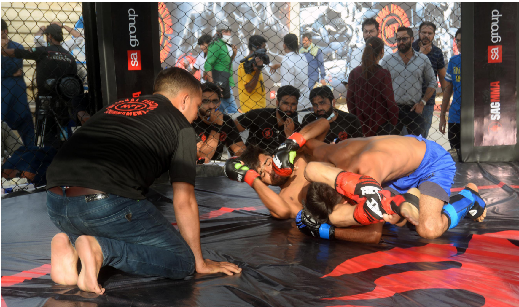
LAHORE: Fighters in action during Punjab Fighting Trial Tournament organized by SA Garden and Mixed Martial Arts at SA Garden stadium.

FROM PAGE 01 that triggered the invasion. In moving to end America’s longest war, the president said he believes that no more can be achieved. “The visit by President Ghani and Dr Abdullah Abdullah will highlight the enduring partnership between the United States and Afghanistan as the military drawdown continues,” spokeswoman Jen Psaki said in a statement on Sunday. As the US military presses ahead to meet the September 11 deadline, the Taliban have fought daily battles with government forces and claim to have captured 40 districts. The growing fear and uncertainty about the future have left many Afghans desperate to leave, including thousands of men and women who fear reprisals because they worked with foreign forces. The Taliban said Sunday they remain committed to peace talks but insisted a “genuine Islamic system” in Afghanistan was the only way to end the war and ensure rights - including for women.