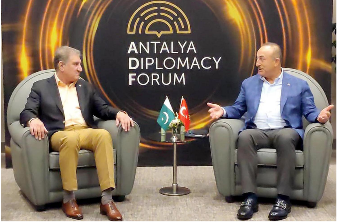
ANTALYA: Foreign Minister Makhdoom Shah Mahmood Qureshi in a meeting with Foreign Minister of Turkey Mevlüt Çavuşoğlu. DNA

ISLAMABAD: The government authorities have decided for large scale production of the locally made coronavirus vaccine PakVac. The decision has been taken to initiate preparations for mass scale production of the single-dose PakVac from the next month, sources said. The NIH Islamabad will prepare monthly three million doses of PakVac and the government have been informed about the decision, according to sources. The decision to produce vaccine in large scale, has been taken in view of the increased demand of the vaccine, sources said. "Monthly production of three million vaccine doses will ensure sufficient availability of the corona vaccine jabs.