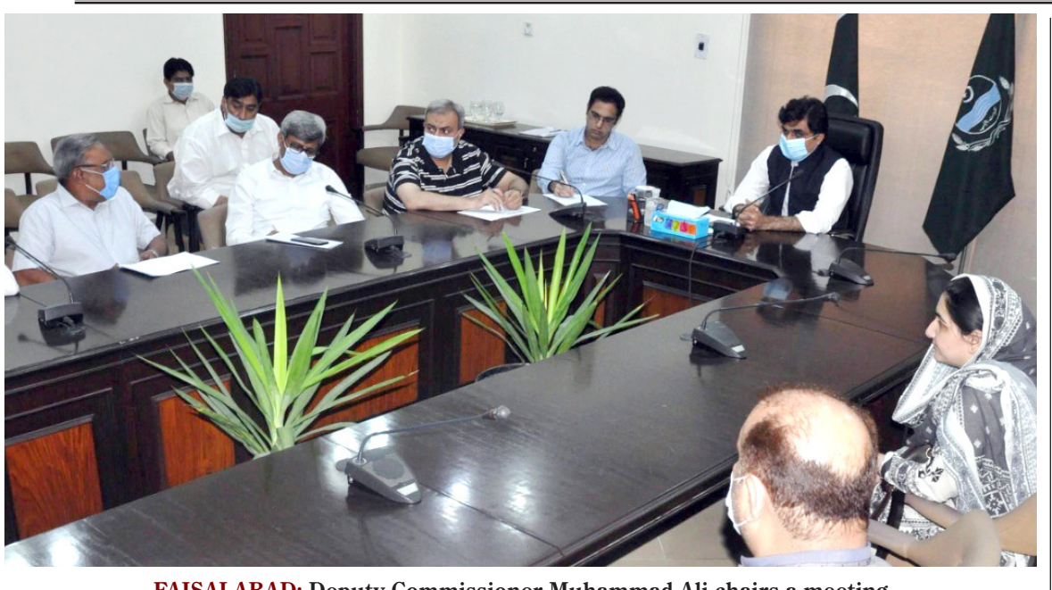
FAISALABAD: Deputy Commissioner Muhammad Ali chairs a meeting of the District Polio Eradication Committee.