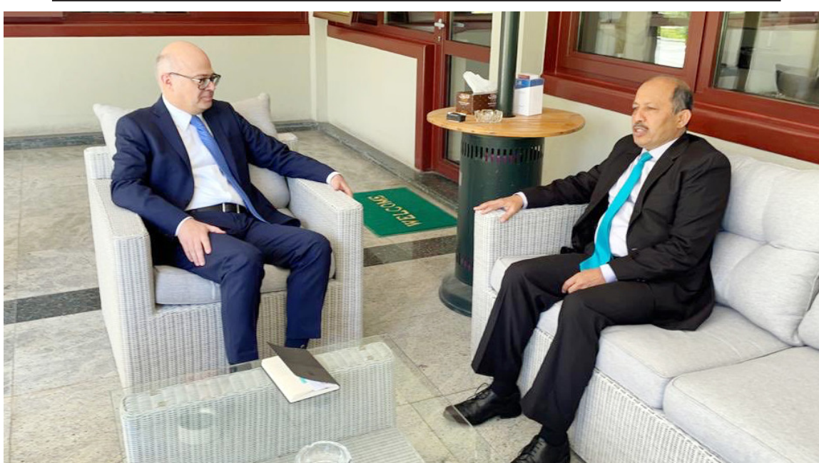
KABUL: Pakistan ambassador to Afghanistan Mansoor Ahmad Khan calls on Turkish ambassador to Afghanistan Cihad Erginay and discussed our collective efforts for lasting peace, stability and progress in Afghanistan.

Iran also blamed Israel for the November killing of a scientist who began the country's military nuclear programme decades earlier.