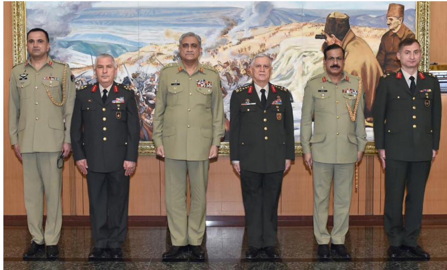
for peace in the region. The dignitaries appreciated Pakistan's positive role for regional peace and stability, especially the Afghan peace process and pledged to continue working for better relations between two brotherly countries. Earlier on arrival, COAS was also presented with a Guard of Honour by a smartly turned out military contingent.

ANKARA: Chief of Army Staff (COAS) General QamarJavedBajwa reiterated that enhanced Pakistan-Turk cooperation will have positive impact on regional peace and stability. The army chief expressed it during a meeting with General HulusiAkcar (Retired), Minister of National Defence of the Republic of Turkey during a daylong official visit to the country. General Yasar Guler, Commander Turkish General Staff and General Umit Dundar, Commander of the Turkish Land Forces were also present in the meeting, said ISPR in a statement. During the meeting, matters of mutual interests, regional security situation including recent developments in Afghan Peace Process and bilateral defence and security cooperation in various fields were discussed. COAS also acknowledged the Turkish engagements with Pakistan especially the ongoing efforts for continuing the positivity