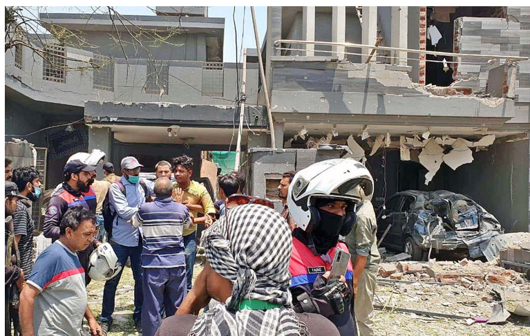
LAHORE: A view of damaged buildings and vehicles as a result of the blast in Johar Town on Wednesday. Three people were killed in the blast.

Over 30 kg of explosives used; windows of nearby houses and buildings were shattered in the explosion