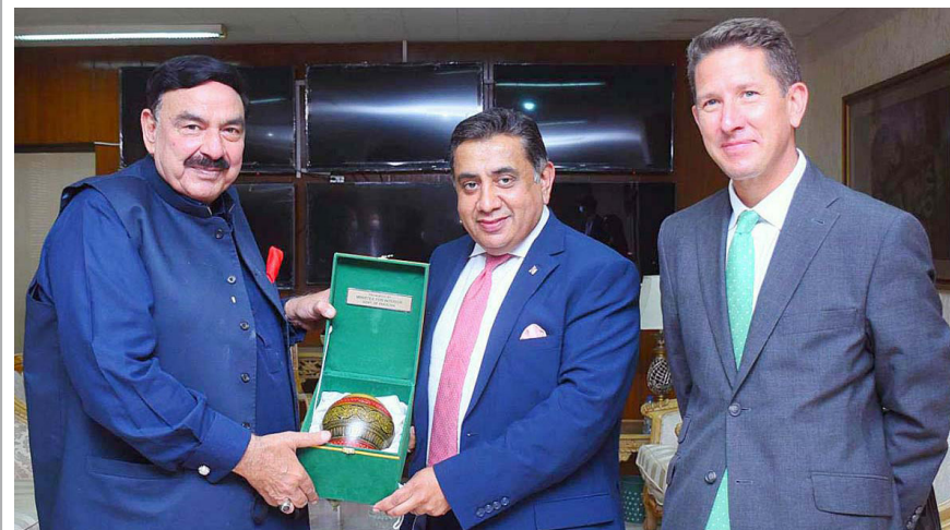
ISLAMABAD: Interior Minister Sheikh Rashid Ahmed presenting a souvenir to Lord Tariq Ahmad, UK Minister for South Asia and Commonwealth who called on him. British High Commissioner Christian Turner also present.

Lord Ahmad launched a new programme in Lahore to promote cleaner brick production practices which will help improve air quality, reduce smog and fight climate change