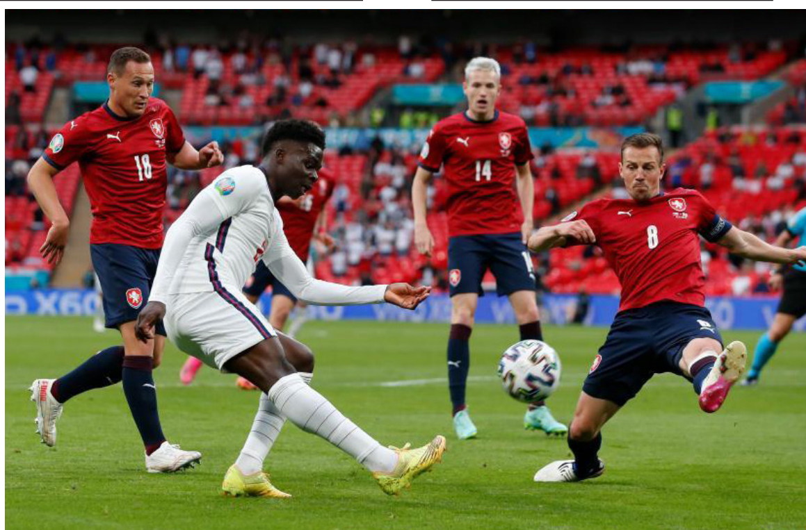
LONDON: England's Bukayo Saka passes the ball over the defense of Czech Republic's Vladimir Darida during the Group D match between England and the Czech Republic at the UEFA EURO 2020 in London.

ANKARA: Five devices will release oxygen into the sea-snot covered Marmara to help marine life impacted by the mucilage off the coasts of Istanbul and northwestern Kocaeli province. Turkey has placed devices to release oxygen into the sea-snot covered Marmara to help marine life impacted by the mucilage off the coasts of Istanbul and northwestern Kocaeli province. The devices were placed at five different points in the Gulf of Izmit and off Pendik to contain the mucilage. Mucilage has increased around the coast of historical Gallipoli peninsula in northwestern Canakkale province since Monday. Mucilage prevents oxygen transfer by covering the area from the sea surface to 30 metres deep in the Marmara, killing non-motile or immobile organisms such as mussels, oysters, and pines, particularly sponges and corals. Mucilage has spread in the area between Gallipoli and Eceabat in Canakkale. Sea snot has also observed in areas of fishery production. Although there have been reports of mucilage reaching the Black Sea and the Aegean, which are connected by the Marmara, experts do not expect a large expansion there due to differences in condition and geography. Mucilage is an overgrowth of microscopic algae called phytoplankton caused by rising seawater temperatures due to global warming, stagnant water, and pollution.