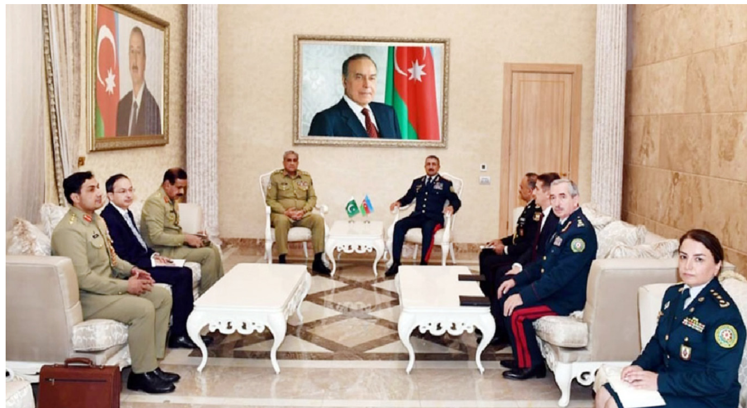
and collective response against common challenges. COAS also reiterated for increased mutually beneficial engagements at all levels and forums. The dignitaries also acknowledged high standards of professionalism of the Pakistan Army and contributions for conflict prevention in the region especially efforts for bringing peace in Afghanistan.

BAKU: General Qamar Javed Bajwa, Chief of Army Staff (COAS) on an official visit of Republic of Azerbaijan called on His Excellency Colonel General Eyyazov Vilayat Suleyman oglu, Minister of Internal Affairs of Azerbaijan, His Excellency Colonel General Elchin Guliyev, Chief of State Border Service (SBS) of Azerbaijan and His Excellency Colonel General Ali Naghi Oglu Naghiyev, Chief of State Security Service at Baku. During the meeting, matters of mutual interest, bilateral defence & security cooperation, regional peace & stability and co-operation in energy, trade & connectivity projects between both brotherly countries were discussed. General Qamar Javed Bajwa, Chief of Army Staff said the emerging geo-strategic paradigm in the region necessitates our close cooperation