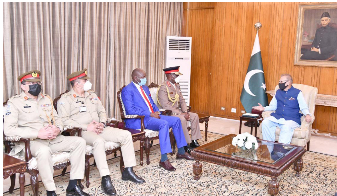
ISLAMABAD: Chief of Defence Forces of Kenya, General Robert Kariuki Kibochi called on President Dr. Arif Alvi at Aiwan-e-Sadr.

Ball bearings, nails and other explosives were among the objects used in the bomb. The initial report states that the material had been planted onto a car and the device was detonated remotely. A 3-foot deep and 8-foot wide crater has formed at the site of the blast, the report said. The blast caused damage within a 100-square-foot radius.