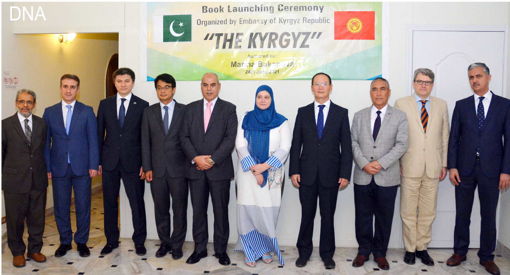
ISLAMABAD: Ambassadors of Yemen, Azerbaijan, Kazakhstan, South Korea, Jordan, Kyrgyzstan, Austria and Tajikistan posing for picture on the occasion of book launching ceremony.

Ambassadors of Central Asian States, Austria, Jordan, Republic of Korea attended the launching ceremony; author presents her book to the Kyrgyz ambassador