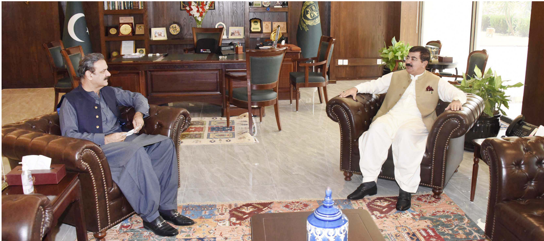
ISLAMABAD: Chairman Senate Muhammad Sadiq Sanjrani exchanging views with Lt. Gen. Asim Saleem Bajwa, Chairman China-Pakistan Economic Corridor Authority (CPECA) at Parliament House Islamabad.

The examination will be held through Learning Management System (LMS) and all preparations have been finalized in this regard. The department of ICT has created and activated LMS accounts of all students enrolled in these programs. Date sheet and instructions for these examinations have also been uploaded on the university website (www.aiou.edu.pk). The students will access these accounts through their usernames and passwords. By default, usernames are the registration numbers of the students and passwords are their roll numbers. All those students who lack computer and internet facilities are instructed to utilize computer laboratories established at the regional centers for this purpose. All regional centers have been given instructions to facilitate students in this regard.