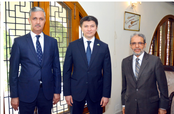
ISLAMABAD: Ambassadors of Tajikistan, Kazakhstan and Yemen posing for a picture.