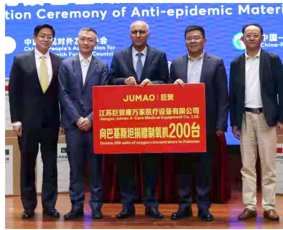
that both countries would continue their ongoing co-operation for vaccine development and distribution.