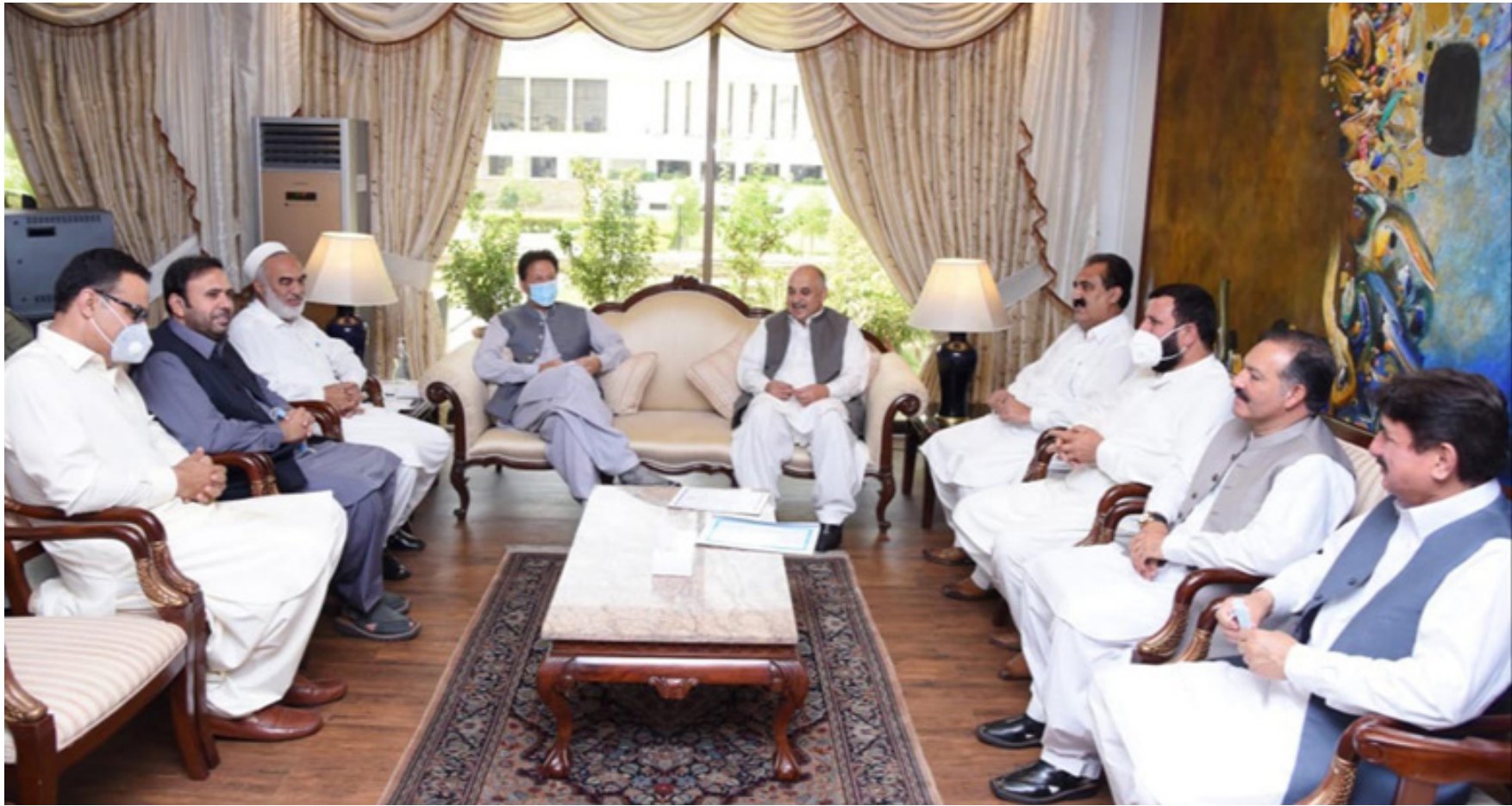
ISLAMABAD: Parliamentarians from Khyber Pakhtunkhwa called on Prime Minister Imran Khan in Islamabad. - DNA

PESHAWAR: Finance Minister Taimur Khan Jhang on Thursday congratulated the Khyber Pakhtunkhwa Assembly for upholding democratic norms during the budget session and gave credit to both treasury and the opposition benches for avoiding any parliamentary incident. Giving explanation to criticism and various questions raised by the opposition leader Akram Khan Durrani and other opposition MPs on the budget 2021-22, the finance minister said that shortfall of budget is due to difference between budgetary receipts and actual receipts which existed in every previous budget. He said that Khyber Pakhtunkhwa was the first province which bring transparency in the budget and everything is reflected in the budget paper including due share of the province from the federal government on pretax of net hydro profit and NFC share. - APP