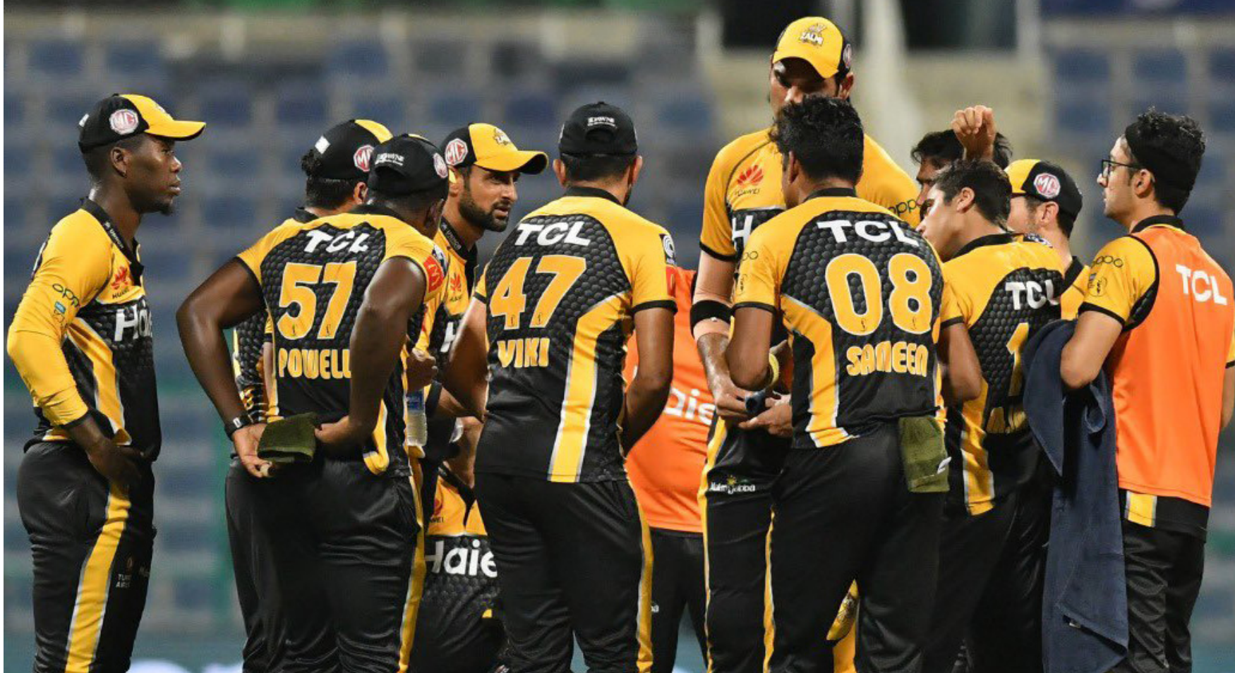
ABU DHABI: Peshawar Zalmi players celebrating after taking a wicket against Multan Sultan in PSL-6 final match.

WASHINGTON: US President Joe Biden announced Thursday he has reached a deal with a bipartisan group of senators on a landmark infrastructure package, likely the most funding for roads, bridges and ports in decades. "We've struck a deal. A group of senators - five Democrats and five Republicans - has come together and forged an infrastructure agreement that will create millions of American jobs," Biden said on Twitter. The president had sat down with the lawmakers at the White House to culminate weeks of negotiations on Capitol Hill, where Democrats and Republicans have squared off over the size and scope of the funding. - APP