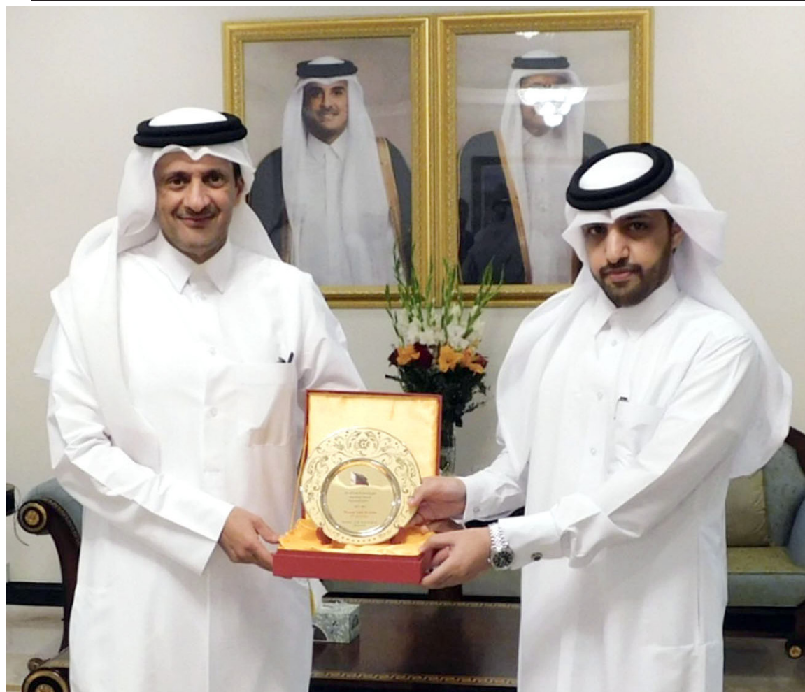
ISLAMABAD: Sheikh Saud bin Abdulrahman Al Thani, Ambassador of the State of Qatar to the Islamic Republic of Pakistan, held a farewell party for Mr. Masoud Talib Al-Athbi, second Secretary at the Embassy of the State of Qatar in Islamabad, on the occasion of the end of his tenure at the Qatari Embassy in the Islamic Republic of Pakistan.

participation of Government of Palestine and Embassy of Palestine in scholarship program and its further facilitation for implementation of this programme. The Ambassador, on the behalf of government and Palestinian people, thanked COMSTECH, AFSUP and member institutions of COMSTECH-MOFA Consortium of Excellence for offering 500 scholarships for Palestinian students. He appreciated the efforts and support extended by the Prime Minister and Foreign Minister of Pakistan to Palestinian people. The Ambassador offered one million Olive trees to COMSTECH for plantation in universities and institutions that have offered these scholarships. COMSTECH and the embassy of Palestine agreed to work together expeditionary to chalk out the modalities of the work program. Both the dignitaries exchanged souvenirs of memorandum. The senior officials of COMSTECH were also present in the meeting.