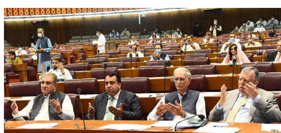
ISLAMABAD: National Assembly members offering Fateha for five soldiers who were martyred in operation against terrorist.

During the exchange of fire heavy losses were inflicted on the terrorists, according to ISPR statement