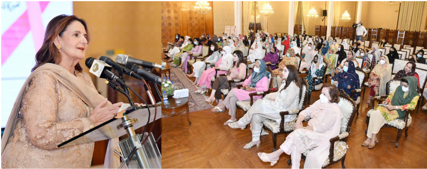
ISLAMABAD: Begum Samina Arif Alvi addressing an awareness session on Breast Cancer for female employees of Aiwan-e-Sadr, organized by Shifa International Hospital, at Aiwan-e-Sadr, on 25-06-2021.

RAWALPINDI: One wheeling was going unnoticed on various roads of the garrison city of Rawalpindi as motor bikers, mostly teenagers, continued to perform wheelie and stunts putting their and others life in danger. The individuals doing wheelies were seen performing dangerous stunts and acrobats on the roads near Ayub Park, Peshawar Road, Saddar, Murree Road and other areas and usually succeeded to dodge the police deployed on the roads. - APP