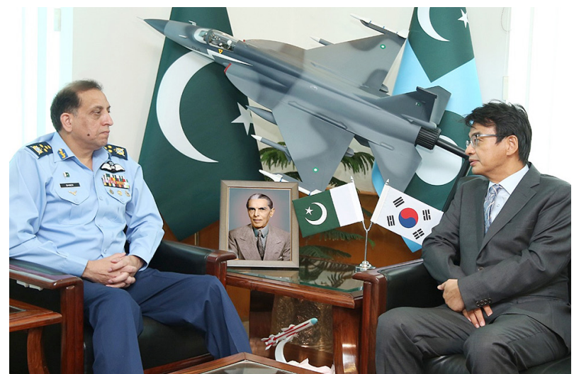
ISLAMABAD: Ambassador of the Republic of Korea H.E. Mr. Suh Sangpyo called on Air Chief Marshal Zaheer Ahmed Baber Sidhu, Chief of the Air Staff, Pakistan Air Force.

ISLAMABAD: Ambassador of the Republic of Korea H.E. Mr. Suh Sangpyo called on Air Chief Marshal Zaheer Ahmed Baber Sidhu, Chief of the Air Staff, Pakistan Air Force in his office. The visiting dignitary lauded the professionalism of PAF personnel and the exceptional progress made by PAF over the years, especially through indigenization. The Air Chief highlighted that both countries enjoy cordial relations and reiterated his resolve to further enhance the existing bilateral cooperation between the air forces of the two countries. Various matters of mutual interest and professional cooperation also came under discussion during the meeting.