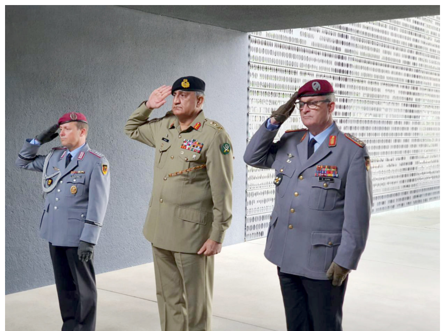
BERLIN: Qamar Javed Bajwa, Chief of Army Staff (COAS), along with General Eberhard Zorn, paying respects at the monument.

COAS discussed matters of mutual interest in his meeting with General Eberhard Zorn, Chief of Defence German Army