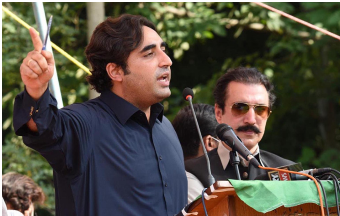
KOTLI: PPP Chairman Bilawal Bhutto Zardari addressing a public rally in Kotli in connection with upcoming AJK elections.

He said that Pakistan Tehreek-e-Insaf (PTI) had taken concrete steps to change the system of government and today it had put the country on the path of correct and faster development. - APP