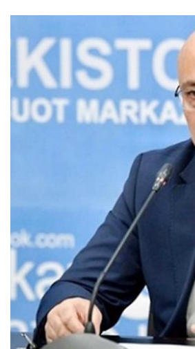
Furqat Didiqov, Deputy Foreign Minister of Uzbekistan

Q: Your Excellency please brief us on the development of trade and economic cooperation between Uzbekistan and Pakistan and what areas can be considered the most promising in this area?