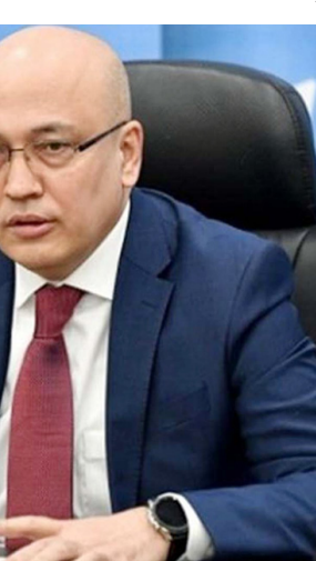
Prime Minister of Pakistan

In March 14-18 of this year the delegation of the Ministry of Transport of Uzbekistan headed by the Deputy Chairman of "Uzbekistan Railways" visited the Pakistani seaports in Karachi and Gwadar.