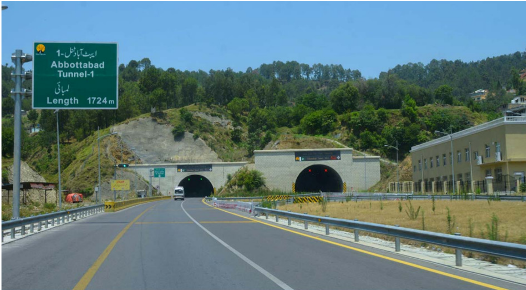
ABBOTTABAD: An attractive view of Abbottabad Tunnel-1 on Mansehra Motorway.

While battling the deadly outbreak of COVID-19 in the country 163 healthcare workers have lost their lives, the sources said. Overall 16,111 health workers have recovered from the pandemic. Most of the medical workers infected by the virus and deceased belong to Sindh. As per the province-wise breakup, in Sindh, 5,830 health workers were infected by coronavirus while 56 died in the disease. In Punjab, 3,477 healthcare workers contracted the coronavirus and 29 of them died.