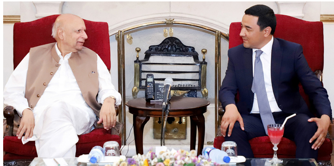
LAHORE: Deputy Governor of Province of Uzbekistan in a meeting with Governor Punjab Ch. Sarwar, during his recent visit to Pakistan.