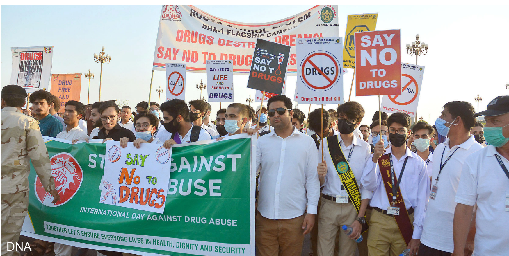
ISLAMABAD: Students taking part in a walk organized in connection with World Drug Day. ANF and UNODC jointly organized the walk.

The spokesman said the landscaping and parking of the project would be carried out by environment wing of CDA. The work on the project was likely to commence in August this year, he added.