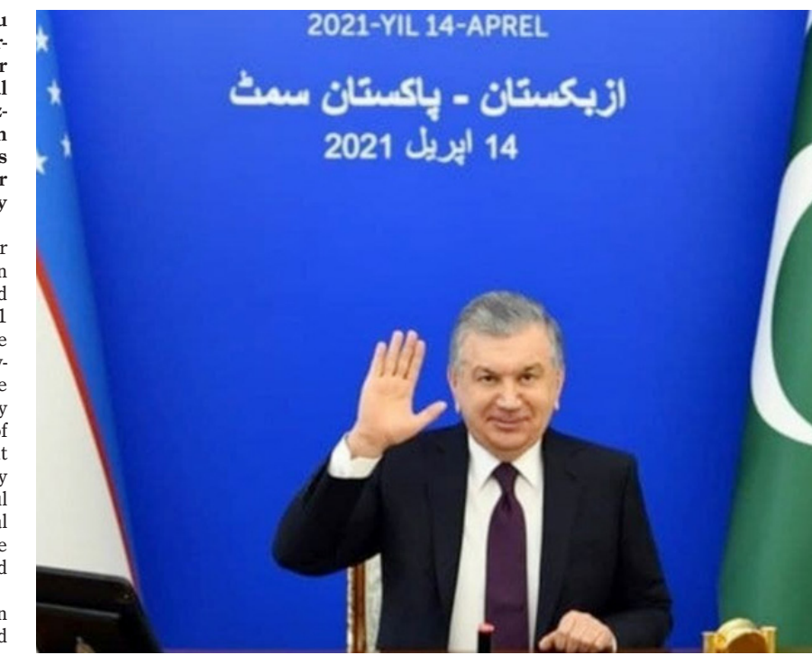
President of Uzbekistan

The Ministry of the foreign affairs of Uzbekistan in active cooperation with Ministry of foreign trade and investments and other stake holders are in closest coordination and working very hard with Pakistany colleagues and their counterparts to prepare the substantial and result oriented