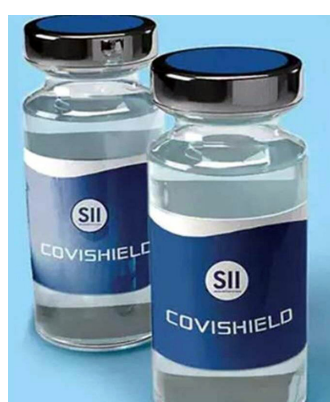
India had conveyed to EU states that Delhi would "institute a reciprocal policy for recognition of the EU digital Covid certificate," the source said. "Right now, our understanding is

The move had come amid reports that Covishield was not yet eligible for EU's digital green certificate set to launch on Thursday. The certificate is currently for EU citizens only. Covishield is the Indian-made version of AstraZeneca's Vaxzevria jab, which has been authorised in the EU. The vaccines currently eligible for the green pass have all been approved by the European Medicines Agency (EMA). A source in India's external affairs ministry earlier said India had requested EU states to individually consider extending the exemption to people who had taken Covid-19 vaccines in India - Covishield and Covaxin - and "accept the vaccination certificate" issued by the government.