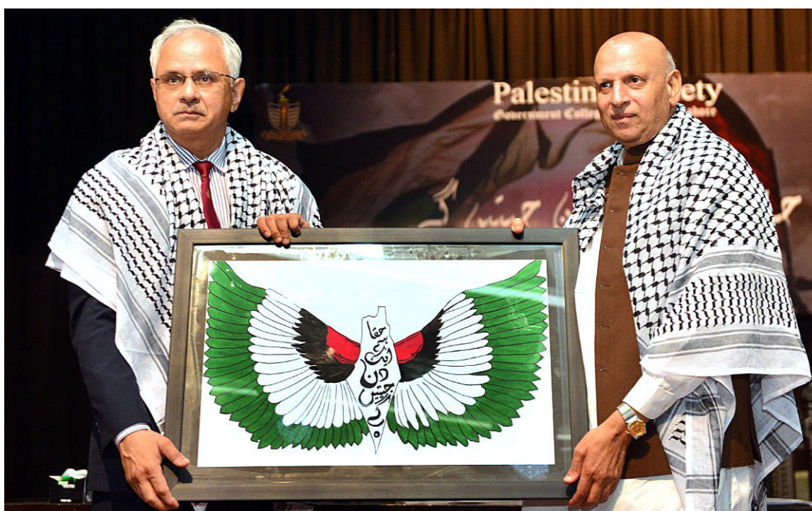
LAHORE: Vice Chancellor is presenting a souvenir to Punjab Governor Chaudhry Sarwar at a seminar organized by Palestine Society at GC University.

LAHORE: Punjab province was entering a new era of development and prosperity due to the prudent economic policies of the PTI government. In a statement, Punjab Chief Minister Sardar Usman Buzdar said a 66 per cent increase had been made in the development budget valuing Rs. 560 billion and a composite roadmap of genuine development introduced. Parliamentarians were also consulted to finalize the annual development programme and Rs.25 billion had been allocated for mega projects through public-private partnership mode, he added. The CM announced to provide free health insurance to 100 per cent population in Punjab adding that universal health insurance was a flagship initiative of the PTI government. Similarly, the CM said that a 10 per cent increase was made in the pays and pensions of government employees along with a 25 per cent special allowance for grade 1 to 19 employees. He regretted that the opposition was not interested in the development of the people and pointed out that development was only shown in papers while the masses yearned for development around them. The past rulers had bankrupted the province with their wrong policies and exhibitory projects, he said. The PTI inherited a devastated economy in 2018 and had to make difficult decisions to stabilize the economy. These steps were yielding positive results now, concluded the CM. - APP