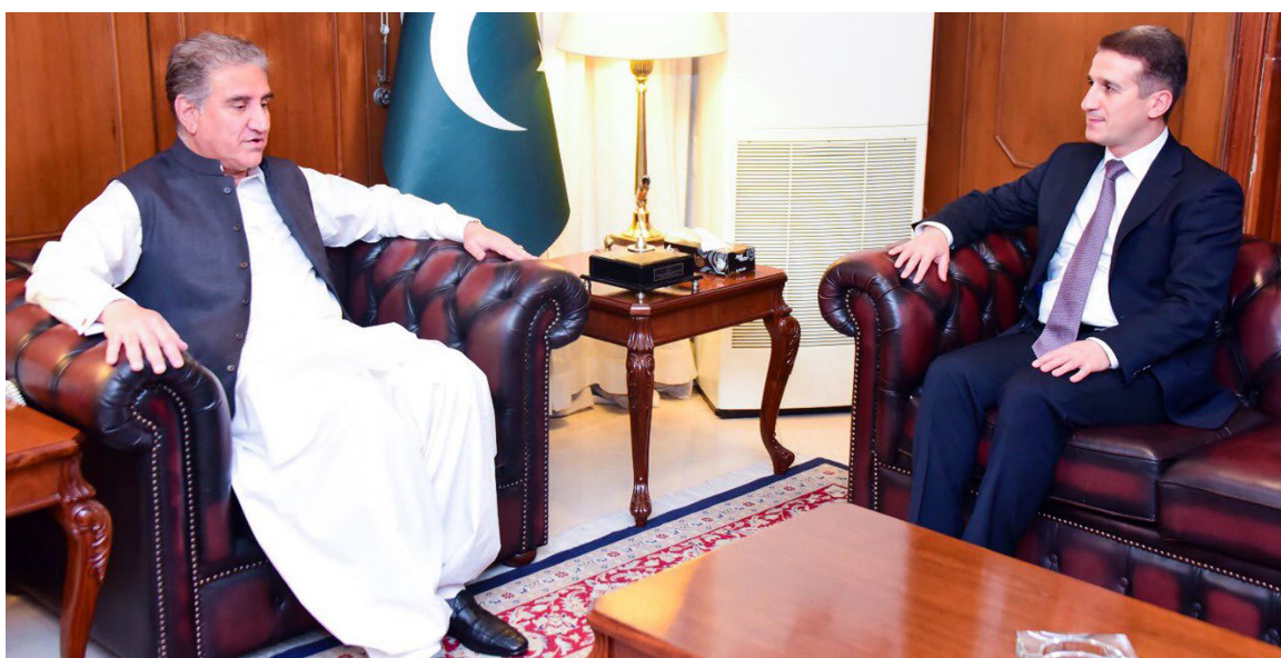
ISLAMABAD: Outgoing Ambassador of Azerbaijan Ali Alizada meeting with Foreign Minister Shah Mahmood Qureshi. Ambassador Alizada is leaving Pakistan after completing his term.

actions and noted progress on cooperation in trade and commerce, energy, education and cultural spheres. The Foreign Minister urged that two sides continue deepening bilateral relations built on historic and religious bonds and exceptional good will in all fields of mutual interest. Foreign Minister wished the Ambassador success for his future assignments. Ambassador Alizada arrived in Pakistan in 2016 and is leaving this month upon completion of his diplomatic assignment.