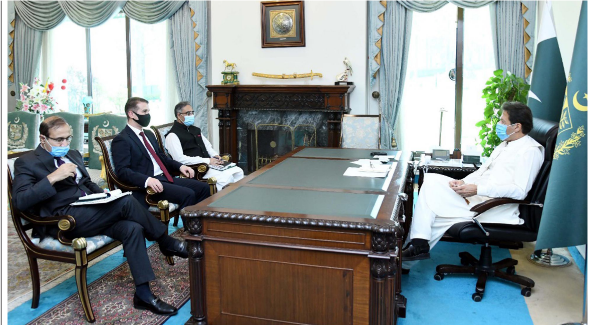
ISLAMABAD: Outgoing Ambassador of Azerbaijan to Pakistan Ali Alizada calls on Prime Minister Imran Khan.