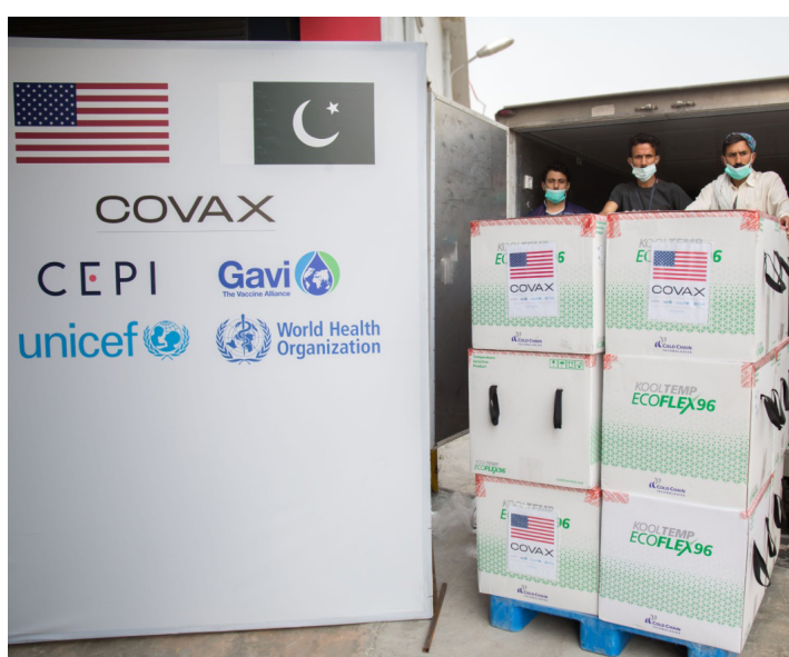
ISLAMABAD: Doses of Moderna vaccines being offloaded.

ISLAMABAD: 2.5 million doses of the Moderna COVID-19 vaccine donated by the United States arrived at Islamabad International Airport. These vaccines are being delivered to the Pakistani people in partnership with the COVAX global vaccine initiative, UNICEF, and the Government of Pakistan. This donation is part of the 80 million doses the United States is sharing with the world, delivering on our pledge to facilitate equitable global access to safe and effective vaccines, which are essential to ending the COVID-19 pandemic. As President Biden has said, the United States is committed to bringing the same urgency to international