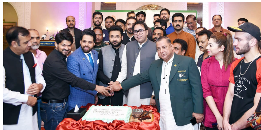
ISLAMABAD: Minister of State for Information and Broadcasting Farrukh Habib and Special Assistant on Political Communication Dr Shahbaz Gill along with other jointly cutting the cake during a function to mark World Sports Journalists Day.

ISLAMABAD: Serena Hotels in collaboration with Rawalpindi-Islamabad Sports Journalists Association held a reception to honor sports journalists on World Sports Journalists Day, as part of Serena Hotels Sports Diplomacy Initiative. The prominent journalists of print and electronic media from the twin cities were invited to an exclusive get together at Islamabad Serena Hotel, followed by a cake cutting ceremony. Farrukh Habib, Minister of State for Information and Broadcasting along with Shahbaz Gill, Special Assistant to the PM were the Chief Guests on the occasion World Sports Journalists Day, observed