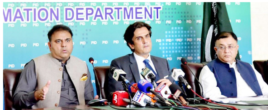
ISLAMABAD: Federal Minister for Information and Broadcasting Chaudhry Fawad Hussain addressing a press conference along with Makhdoom Khusr-o Bakhtiar.