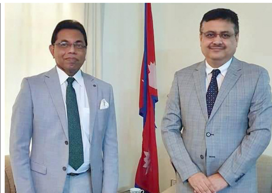
ISLAMABAD: Nepal ambassador receives Dr Palitha Mahipala, WHO Head of Mission in Pakistan at the Embassy. They discussed the Covid-19 situation and other health issues.

Upon receiving the said complaints, the CCP's Cartel and Trade Abuse Department conducted a preliminary fact-finding exercise and found that Foodpanda seems to have a dominant position in the market of online food delivery platforms with a considerable amount of admitted volume of 100,000 per day food orders from different restaurants/outlets/food chains across Pakistan. Regarding the alleged abuse of the dominant position, the concerns inter alia include; charging exorbitant commissions, offering fidelity rebates, discriminatory practices.