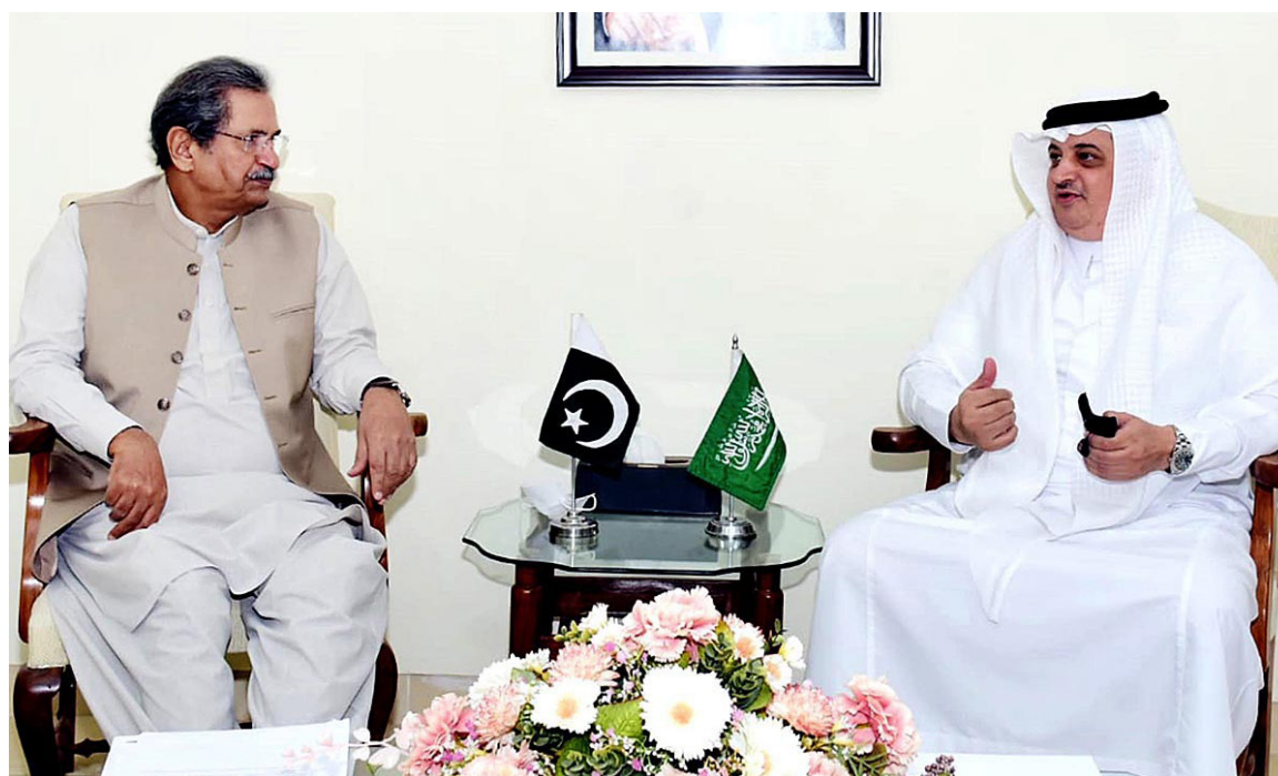
ISLAMABAD: Nawaf Bin Saeed Al-Maliki, Ambassador of Saudi Arabia called on Shafiqat Mahmood, Federal Minister for Education, Professional Training & National Heritage.