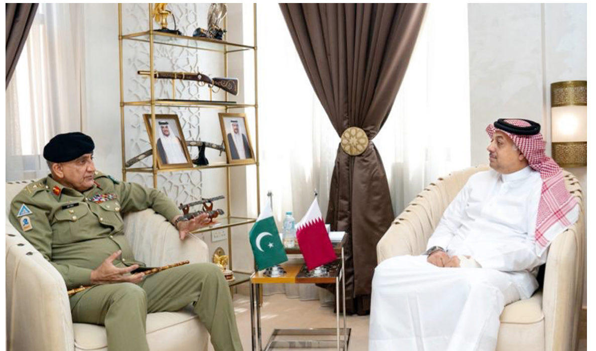
DOHA: Chief of Army Staff General Qamar Bajwa calls on Deputy Prime Minister and Minister of State for Defence Affairs Dr Khalid Bin Mohammed Al Attiyah.