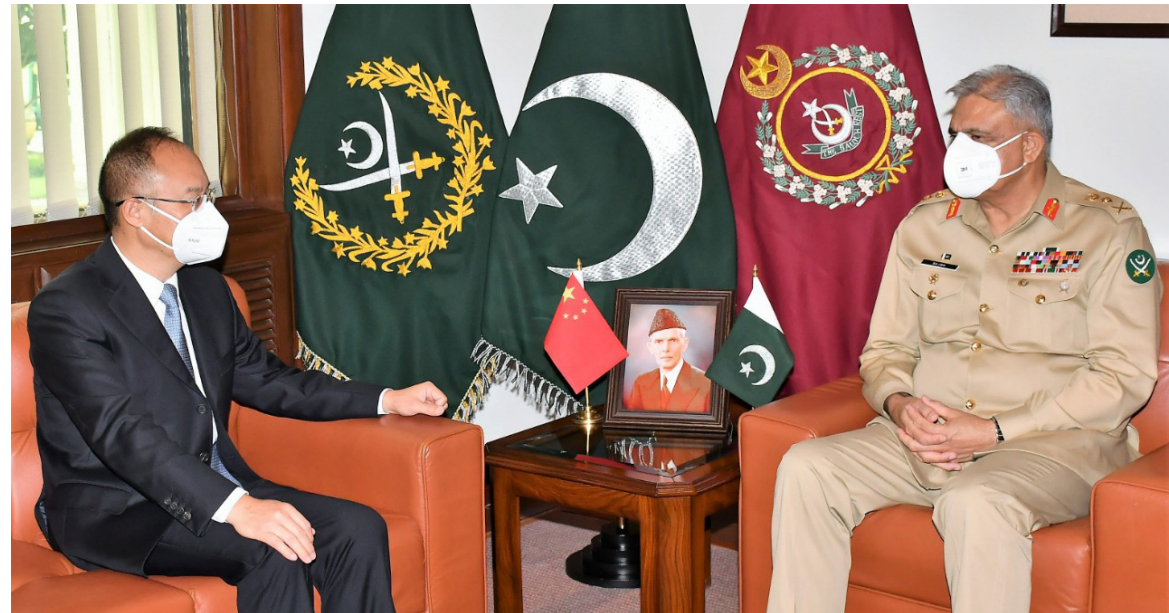
RAWALPINDI: Nong Rong, Chinese Ambassador to Pakistan calls on General Qamar Javed Bajwa, Chief of Army Staff (COAS) at GHQ.