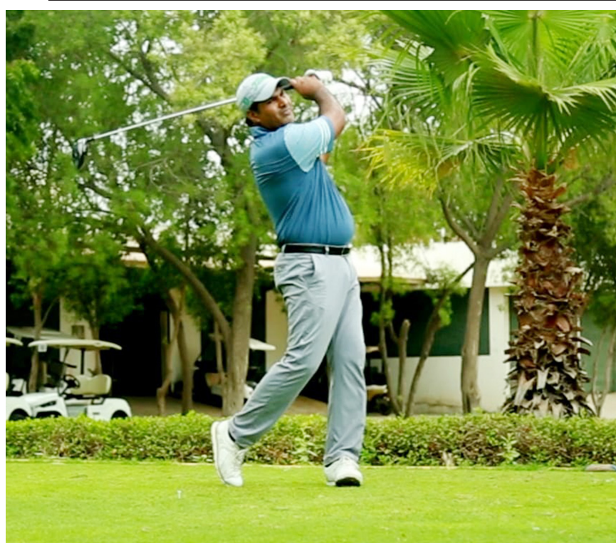
KARACHI: A professional golfer plying his shot during 25th CNS Open Golf Championship 2021 at Karachi Golf Club.

expressed gratitude to the UNGA President for the scheduled annual session of the UN GA commemorating the International Day against Nuclear Tests. Kazakhstan attaches utmost importance to this day because August 29 is the day of the official closure of the Semipalatinsk testing site. According to Ashimbayev, it is of paramount historical importance not only for Kazakhstan, but for the entire humanity. Volkan Bozkir later tweeted that he had an informative meeting with Maulen Ashimbayev focusing on the role of parliaments in implementing the UN GA objectives and more.