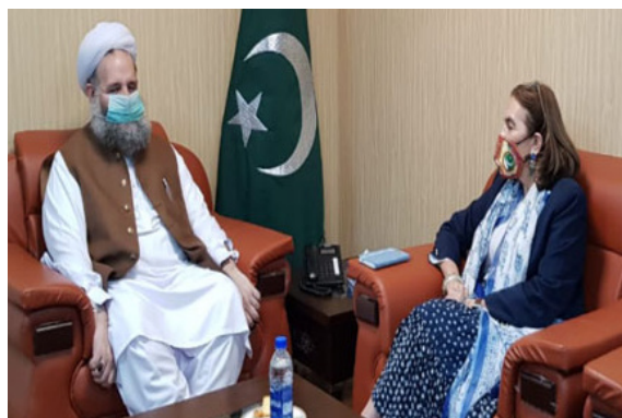
ISLAMABAD: Ambassador of European Union (EU) to Pakistan Androulla Kaminara in a meeting with Minister for Religious Affairs Noorul Haq Qadri. - DNA

ISLAMABAD: Ambassador of European Union (EU) to Pakistan Androulla Kaminara, on Friday, has called on Minister for Religious Affairs Noorul Haq Qadri in Islamabad. According to the details, both the leaders discussed about formulating mutually beneficial policies to facilitate the public of two countries in the matters pertaining to religious freedom and rights of minorities. Moreover, a brief discussion on unifying the heads of Islamic countries to eradicate Islamophobia from the Western-world also took place. Earlier this week, Androulla Kaminara stressed Intrafaith and interfaith harmony is the need of the hour. Unity is a symbol of