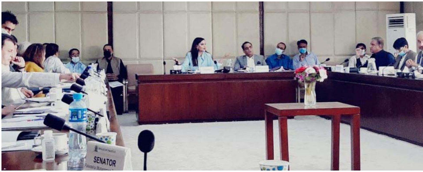
ISLAMABAD: PPP Parliamentary Leader, Sherry Rehman presides over a meeting in the Senate.