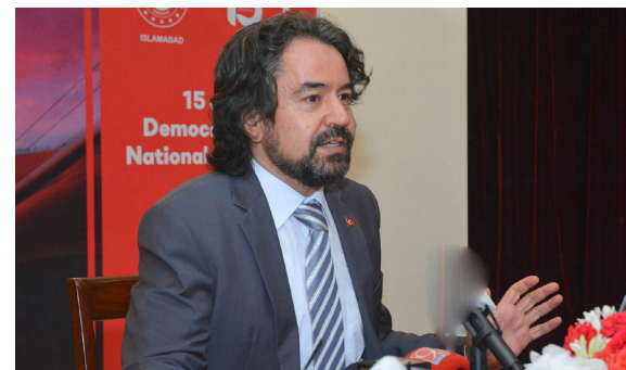
ISLAMABAD: Turkish ambassador Ihsan Mustafa Yurdakul briefs the media about July 15 coup.

The ambassador expressed these views during a press conference on Tuesday. A commemoration ceremony will take place on July 15.