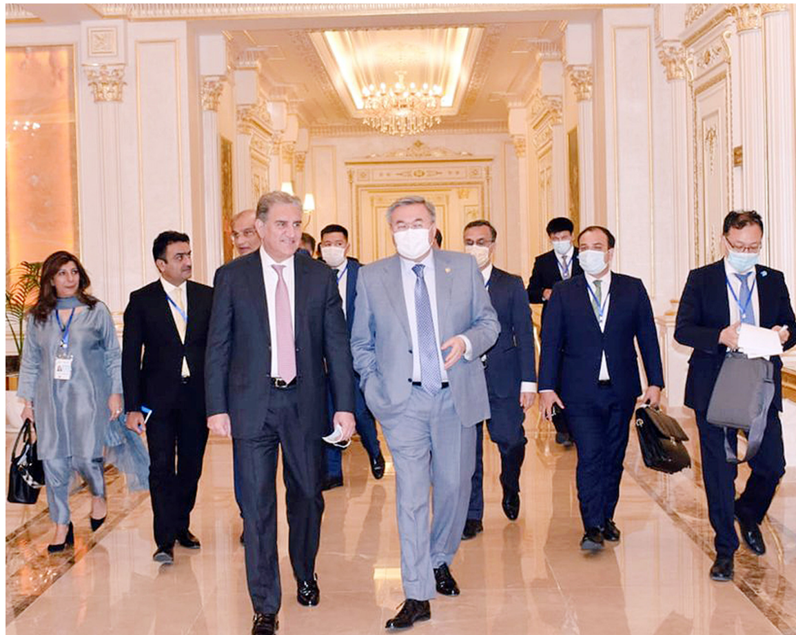
DUSHANBE: On the sidelines of SCO council of foreign ministers meeting in Dushanbe, Foreign minister of Pakistan Shah Mahmood Quraishi met with Foreign minister of Kazakhstan Mukhtar Tileuberdi. - DNA

BAKU: Ancient graves have been discovered in Guba's Giriz village. The graves were found in the area dug for the auxiliary building during the construction of the school. The archeological discoveries are dating back to the 16th-17th centuries. More information will be available after research. The construction of the school was stopped and the relevant government agencies were informed about the fact. Guba has always been a favorite place of local and foreign tourists. The city enjoys favorable geographic location, mild climate, fruitful soil and natural resource. One of Guba's most visited natural features is its unique waterfall in Piranovsha, where the flowing water creates graceful natural sculptures. Guba is also known for its hydrogen sulfide sources, located near the Khashichay. Here, in the narrow gorge, hot water with healing properties flows from the rocks.