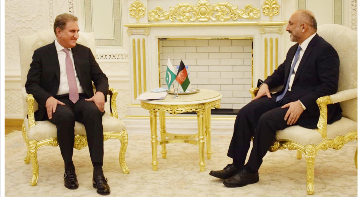
DUSHANBE: Foreign Minister Shah Mehmood Qureshi in a meeting with his Afghan counter-part Haneef Atmar.