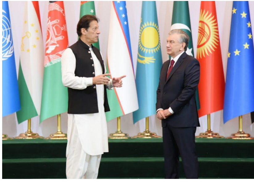
TASHKENT: Uzbek President, Shavkat Mirziyoyev receiving Prime Minister Imran Khan on reaching International Congress Centre of the Tashkent.