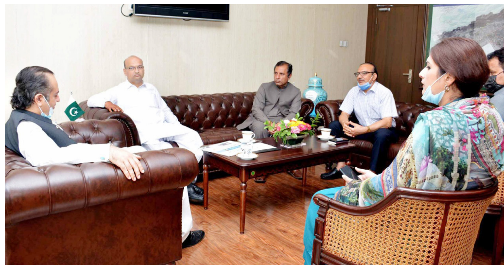
and plants should be planted on every highway, intersection, roadside slopes, green belts so that it has its own identity. He told the participants to introduce modern techniques for tree plantations

On this occasion, the Chairman CDA while issuing instructions said that in order to make the Federal Capital more beautiful and attractive, the same type of trees