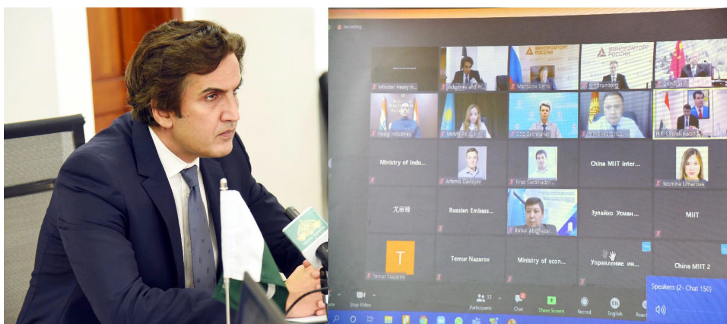
ISLAMABAD: Federal Minister for Industries and Production, Makhdoom Khusró Bakhtyar participated virtually in the first meeting of Ministers of Industries of Shanghai Cooperation Organization (SCO) member states.