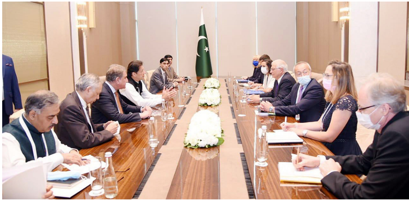
TASHKENT: Joseph Borrell Fontelles, EU HC representative and Vice President of EU called on Prime Minister Imran Khan on the sidelines of 'Central and South Asia 2021: Regional Connectivity: Challenges and Opportunities' conference.

TASHKENT: European Union's High Representative for Foreign Affairs and Security Policy/Vice President of the European Commission Josep Borrell called on Prime Minister Imran Khan on the sidelines of the International Conference on Central and South Asia: Regional Connectivity, Opportunities and Challenges on Friday. Views were exchanged on Pakistan-EU cooperation and the situation in Afghanistan were discussed. The Prime Minister highlighted Pakistan's vital contributions to the Afghan peace process and Intra-Afghan Negotiations (IAN). He stressed that the conflict could only be settled through an Afghan-led and Afghan-owned political process leading to a comprehensive negotiated political settlement. The Prime Minister emphasized the importance of continued engagement of the international community after the withdrawal of foreign forces from Afghanistan to facilitate lasting peace in the country. The Prime Minister expressed concern at the worsening situation in Afghanistan and its negative impact on Pakistan's security.