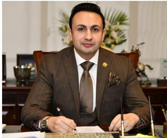
Rs.110/litre to over Rs.116/litre till to date. He said that the government had already put an additional burden of Rs.135 billion on power consumers by increasing power tariff by Rs.2.97/unit in July while another hike in POL

community was also struggling to combat the impact of Covid-19 pandemic. In these tough times, the government has increased the price of petrol by Rs.5.40 and diesel by Rs.2.54 per litre that would unleash a new wave of inflation besides further increasing the cost of doing business in the country. ICCI President said that from January to July 2021, the government has raised the petrol price by over 14% and diesel by over 5% as the price of petrol has gone up from around Rs.103/litre on 1st January 2021 to its highest level of over Rs.118/litre while the price of diesel has surged from around