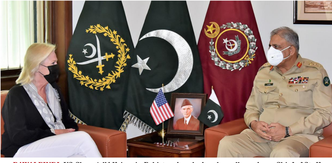
RAWALPINDI: US Chargé d'Affaires in Pakistan Angela Aggeler calls on Army Chief of Staff (COAS) General Qamar Javed Bajwa.

tionals lost their lives in a bus accident. In a telephonic conversation, the prime minister said the security of Chinese nationals, workers, projects, and institutions in Pakistan was the "highest priority of the government". During the call, Prime Minister Imran Khan expressed heartfelt condolences over the loss of precious lives of Chinese nationals caused by the tragic incident in Dasu. The prime minister said the people of Pakistan