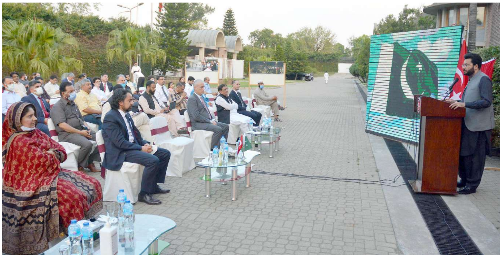
ISLAMABAD: State Minister for Information and Broadcasting Farrukh Habib speaking during a ceremony organized by the Turkish Embassy. - DNA

Asad Umar said the UK was an excellent lesson of vaccination minimizing health impact of COVID. Sharing graphs in his tweet, the minister pointed out that the cases had risen in current wave in UK at about the same rate as previous wave, but number of people needing hospitalization was much less due to high rate of vaccination achieved. - APP