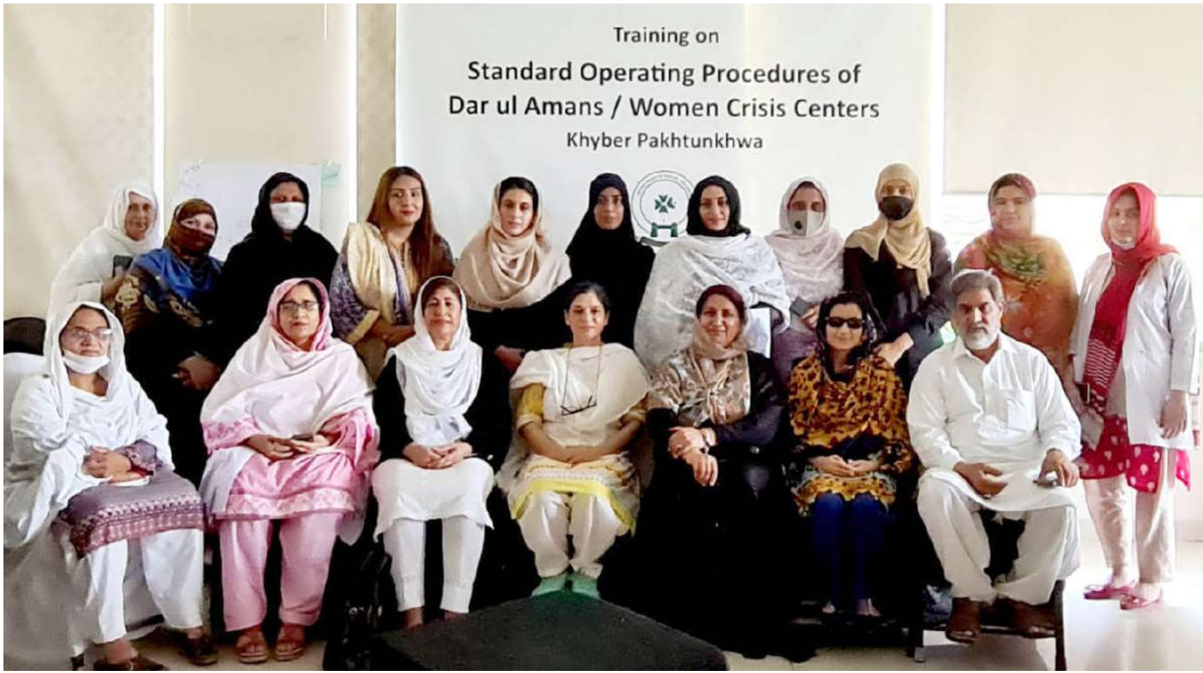
PESHAWAR: In collaboration with Dept. of Social Welfare and Women Empowerment KP, UN Women Flag of Pakistan organized trainings on Standard Operating Procedures for Dar ul Aman. - DNA