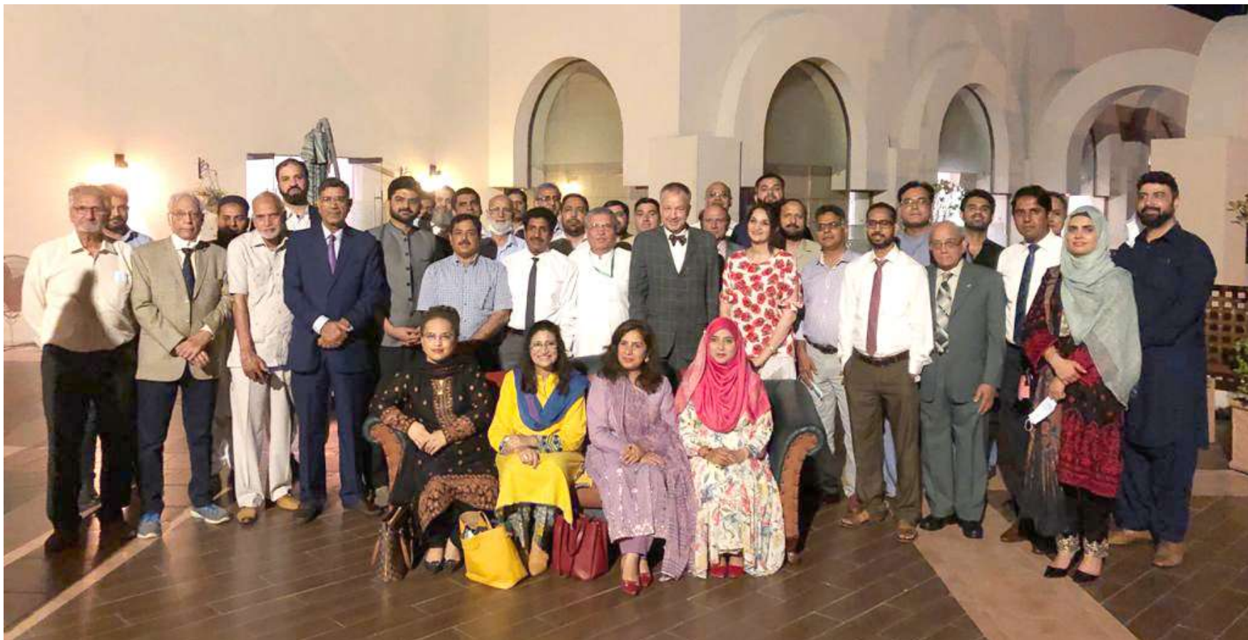
ISLAMABAD: German ambassador to Pakistan, Bernhard Schlagheck posing for a group photo along with alumni of different German scholarship programmes during the event of the Islamabad/Rawalpindi chapter of the DEPK alumni network. - DNA

At least 31 were killed in Belgium alone, with dozens still missing or unaccountable, while in Germany 165 were killed and rescuers are still scouring the rubble for victims. The number of missing in Belgium has fallen over the past two days as telephone contact is re-established and more people are traced. - APP