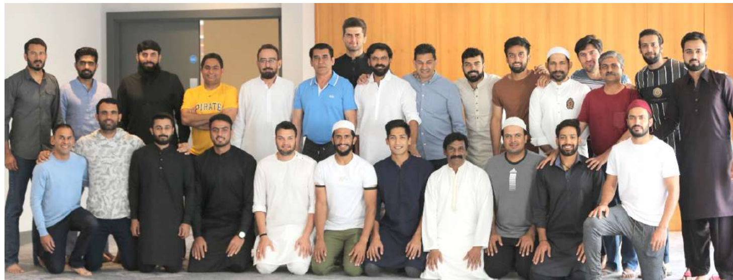
MANCHESTER: Pakistani cricketers and officials pose for a group photo after offering Eid prayer. Pakistan team offered the Eid-ul-Adha prayers under the imam of former captain Sarfaraz Ahmed.

BAMAKO: The attack took place on the two-time coup leader in Bamako during prayers for the Muslim festival of Eid al Adha. Two armed men, including one who wielded a knife, attacked Mali's interim president Assimi Gouita in the Great Mosque in the capital Bamako. The attack, witnessed by an AFP journalist, took place on Tuesday during prayers for the Islamic festival of Eid al Adha. - APP