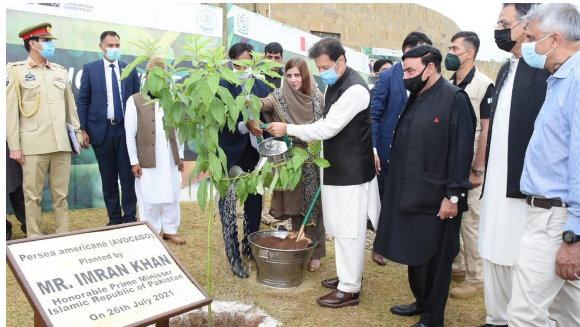
ISLAMABAD: Prime Minister Imran Khan planting an Avocado sapling to launch Monsoon Plantation Campaign 2021 at F-9 Park.