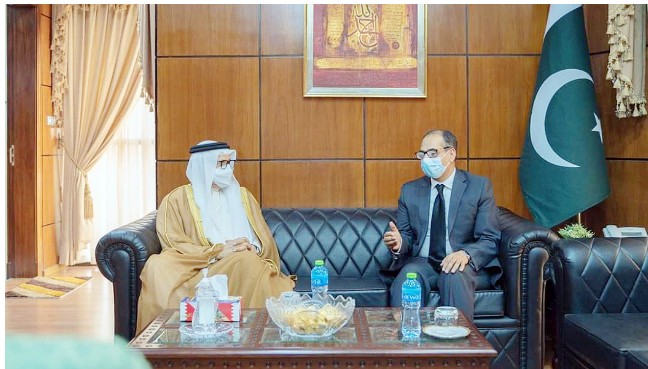
MANAMA: Dr. Abdullatif bin Rashid Alzayani, Minister of Foreign Affairs of the Kingdom of Bahrain went to the embassy of Pakistan, Muhammad Ayub, ambassador of Pakistan received the Foreign Minister at the embassy. — DNA

The Book of Condolences was opened on 25 July 2021 in honour of the deceased former President Mammoon Hussain who served as the 12th President of the Islamic Republic of Pakistan from September 2013 to September 2018.