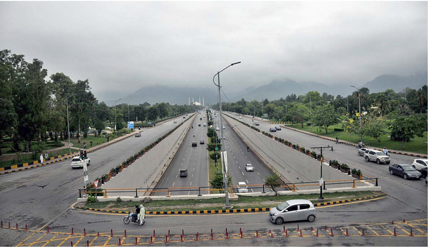
ISLAMABAD: An attractive view of clouds hovering over the skies of Federal Capital.