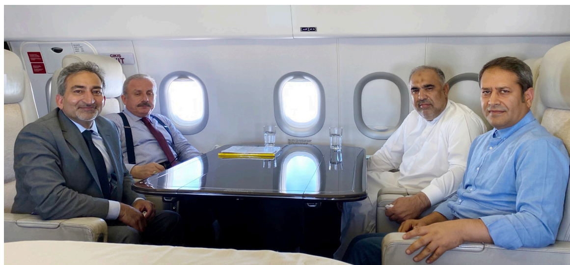
BAKU: Asad Qaiser, Speaker National Assembly of Pakistan along with Mustafa Şentop, speaker of The Grand National Assembly of Turkey for the Trilateral Speakers' meeting of Pakistan, Turkey, and Azerbaijan.

reports of damage or loss of life. The epicenter of the quake was at a depth of 10 kilometres and at 97 km west-northwest of Luwuk, according to USGS. Tremors from the strong earthquake were also felt about 200 kilometres from the epicentre at Palu. Indonesia falls under the 'Ring of Fire' arc on the Pacific ocean that has an intense seismic activity throughout the year.