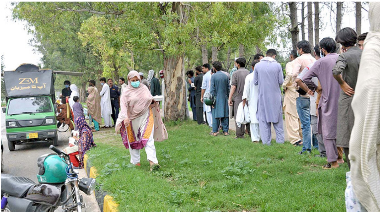
ISLAMABAD: A volunteer distributing free food among deserving outside PIMS Hospital.