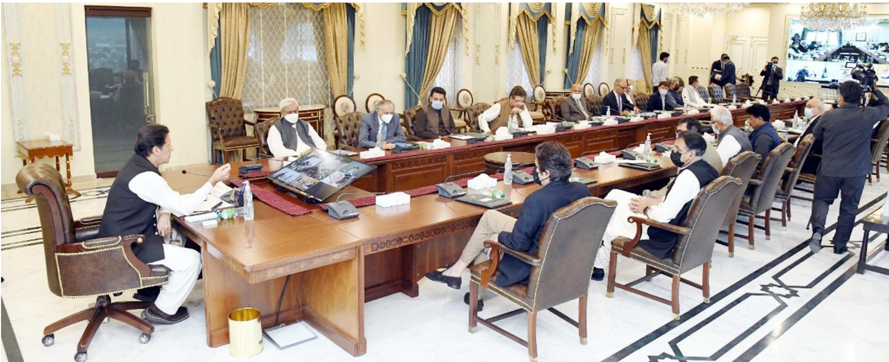
ISLAMABAD: Prime Minister Imran Khan chairing a review meeting on price control.

PESHAWAR: Provincial Minister for Local Government, Elections, Rural Development and Parliamentary Affairs Akbar Ayub Khan Monday said that development of Peshawar was one of the top priorities of KP government. He said this while talking to a delegation here at his office. The LG Minister said that development works of Rs 1.5 billion would be completed within one year in Peshawar while hundreds of beauty projects in provincial capital were to be completed soon to improve the living standards of the citizens in health, sanitation and other sectors. The minister said that KP government wanted to make Peshawar again the city of gardens and flowers. He said that the establishment of a zoo in Peshawar, the construction of Bab-e-Peshawar, BRT and other mega project were the big achievement of PTI government. — APP