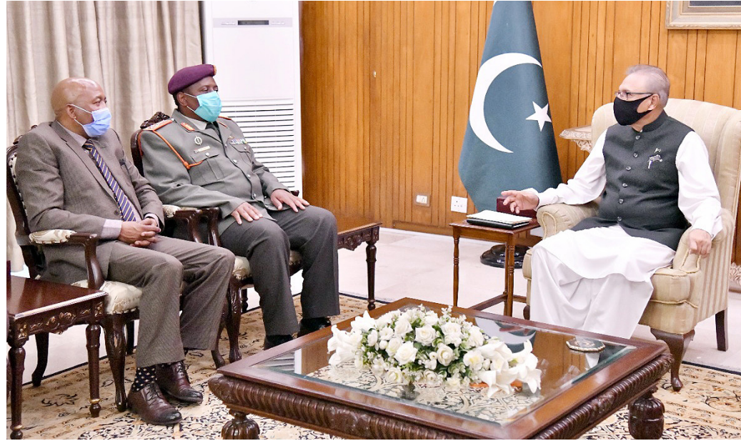
ISLAMABAD: The Chief of South African National Defence Force, General Rudzani Maphwanaya, called on President Dr Arif Alvi, at Aiwan-e-Sadr.

ISLAMABAD: President Dr Arif Alvi said Pakistan and South Africa enjoy excellent cooperation in the field of defence which needs to be further expanded for the mutual benefit of the two countries. He expressed these views while talking to the visiting Chief of South African National Defence Force, General Rudzani Maphwanaya, who called on him in Islamabad on Thursday. He said Pakistan wants to further enhance trade, investment and defence relations with South Africa. He said Pakistan attaches great importance to its ties with South Africa under its "Look Africa" policy and wants to increase the frequency of exchanges at military and political levels to further cement bilateral ties. The President highlighted Pakistan's strategy of "Smart