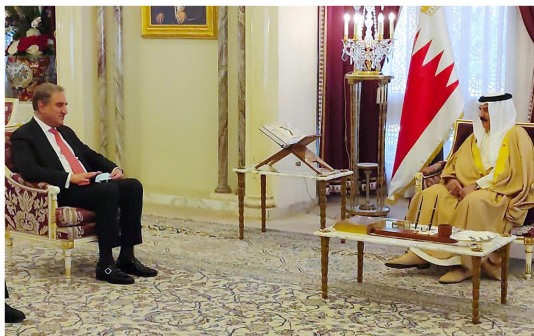
MANAMA: Foreign Minister Shah Mahmood Qureshi called on King Hamad Bin Isa Al Khalifa of Bahrain and conveyed to him best wishes from the President of Pakistan Arif Alvi. - DNA

MANAMA: Foreign Minister Shah Mahmood Qureshi called on His Majesty King Hamad Bin Isa Al Khalifa, the King of the Kingdom of Bahrain, in Manama on Thursday. The Foreign Minister conveyed the warm regards of the President and the Prime Minister to His Majesty, as well as best wishes for the continued progress and prosperity of the brotherly people of Bahrain. His Majesty reciprocated the sentiments. Foreign Minister Qureshi said that Pakistan attached importance to its close relations with the Kingdom of Bahrain and remained committed to expand this relationship in all spheres of bilateral cooperation. The Foreign Minister expressed deep gratitude to the Kingdom of Bahrain for hosting a large number of Pakistani citizens. The Foreign Minister expressed gratitude for inviting Prime Minister Imran Khan as Guest of Honour at the National Day of Bahrain in December 2019 and