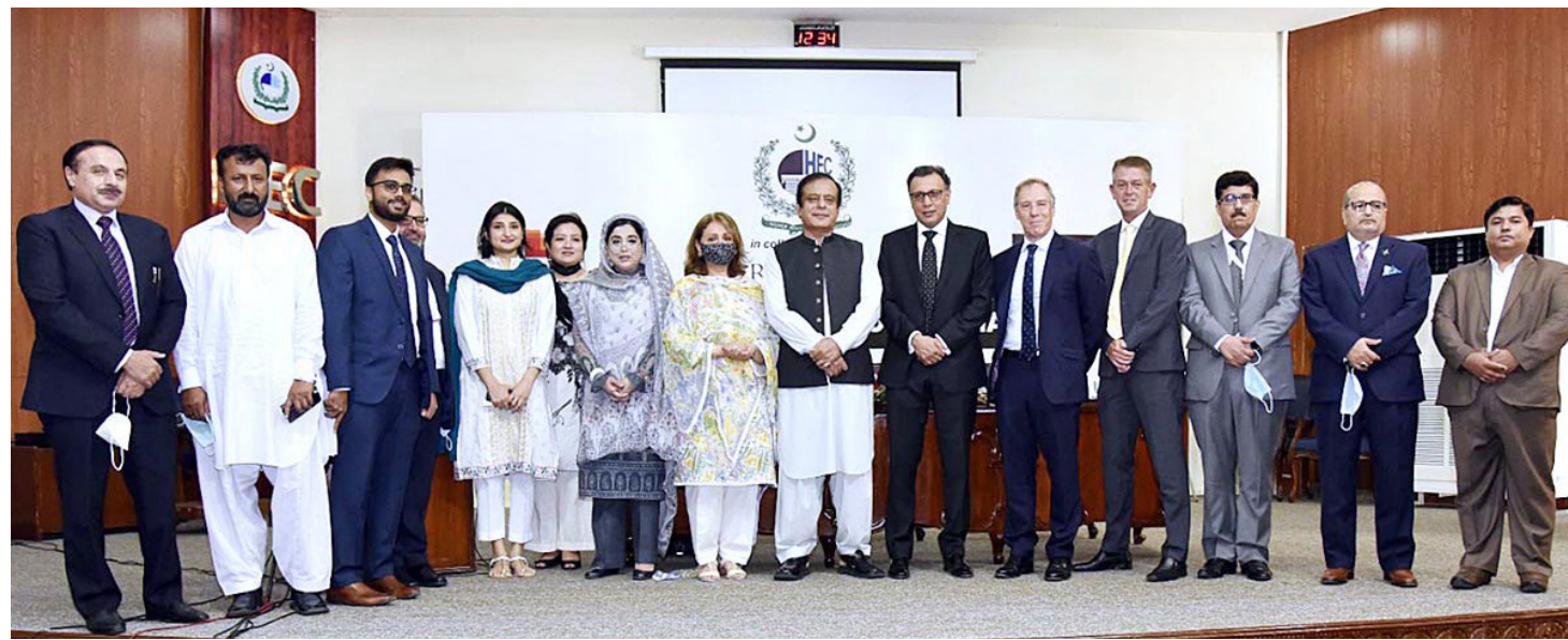
ISLAMABAD: Federal Minister for Science and Technology, Shibli Faraz in a group photo during the inaugural ceremony of Capacity Building Program for senior HEC employees.