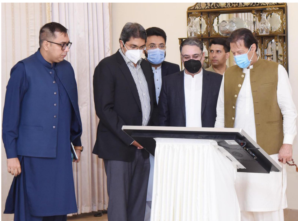
ISLAMABAD: Prime Minister Imran Khan reviewing LDA apartments at balloting ceremony.

LAHORE: Pakistan Muslim League-Nawaz (PML-N) vice president Maryam Nawaz on Thursday termed PP-38 Sialkot by-election as 'selection'. In a post on social-networking website Twitter, the PML-N leader said that the reality will be exposed in next General Elections. The government which is getting bad wishes from the people will never receive support from them, she added. Maryam Nawaz further said PML-N has high hopes and that vote will get its respect.