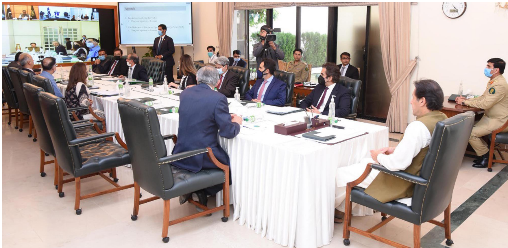
ISLAMABAD: Prime Minister Imran Khan chairs a meeting on small and medium enterprises.

He said the process of corona vaccination was in full swing and people should support the vaccination process. He said the staff of the health department should fulfill their responsibilities with utmost honesty so that people could be protected from this pandemic. The Deputy Commissioner directed the DHO to start corona vaccination in the district as like polio campaign so that women could also be vaccinated. The corona vaccination should be completed effectively in rural areas for which Assistant Commissioners, Tehsildars and other staff would ensure all possible cooperation with them and also monitor the vaccination process. — APP