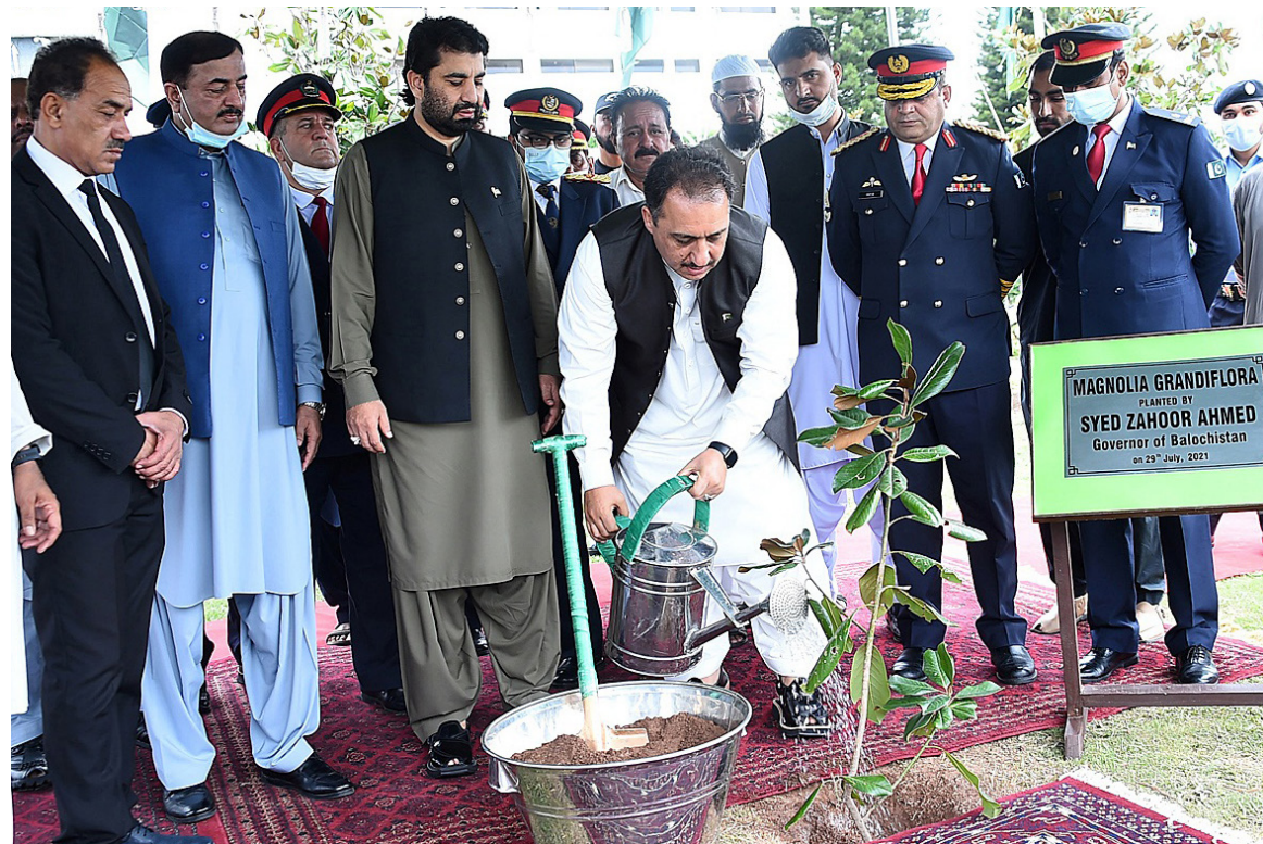
ISLAMABAD: Governor Balochistan Syed Zahoor Ahmed Agha along with Acting Speaker National Assembly Qasim Khan Suri planting a saplings of Mangolia Grandiflora at Parliament lawn.

It updated that patients reported during the last 24 hours included thirty-eight belonged to Rawal Town, thirty-nine from Potohar town, sixty-four from Rawalpindi Cantt, five from Gujjar Khan, sixteen from Taxila, seven from AJK, two from KPK, two from Islamabad, and one each from Jehlum, Chakwal, Murree, Kahutta and Kotli Sattian. "Presently 139 confirmed patients were admitted to various facilities of the city including 33 in Holy Family Hospital, 22 in Benazir Bhutto Hospital, 44 in Institute of Urology, 34 in Fauji Foundation Hospital and 2 each in Bilal hospital and Hearts International hospital" he added.