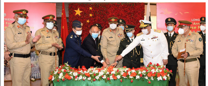
RAWALPINDI: Pakistani military top brass along with Chinese officials cutting cake to celebrate the event.

A ceremony was held at GHQ in connection with the 94th founding day of the Chinese PLA