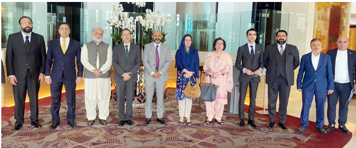
BAKU: Pakistan embassy Baku arranged meeting of Pakistani parliamentarians with members of Pakistan Azerbaijan Business Chamber. Founding members of the Chamber briefed the delegation on prospects of enhancing economic engagement between the two countries.