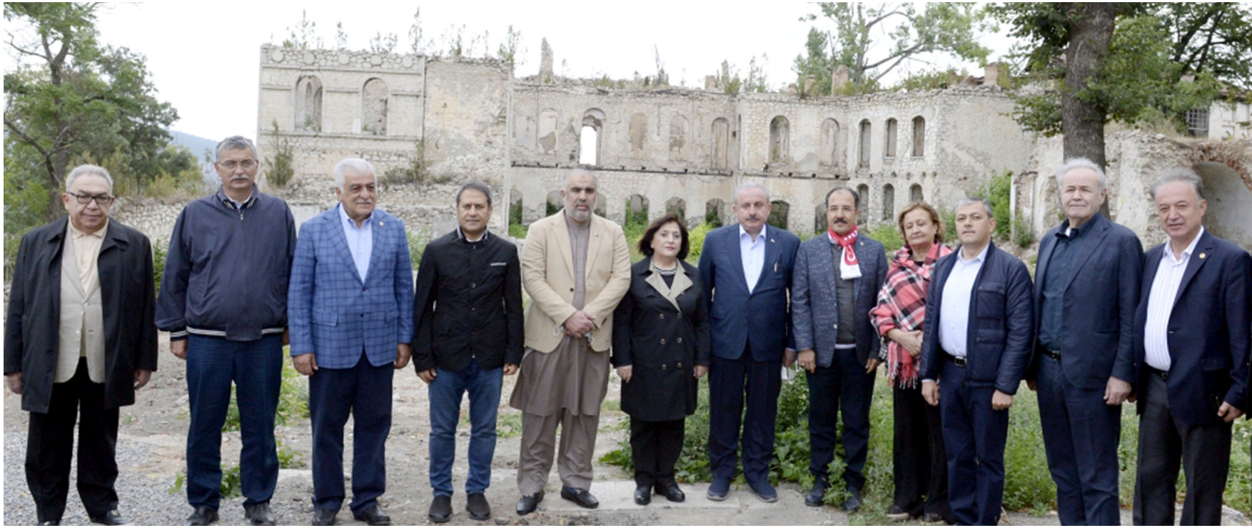
SHUSHA: Speakers of the Milli Majlis of the Republic of Azerbaijan, Turkish Grand National Assembly, and the Pakistani National Assembly Sahiba Gafarova, Mustafa Sentop, and Asad Qaiser during their visit to Shusha, the newly liberated area of Azerbaijan.