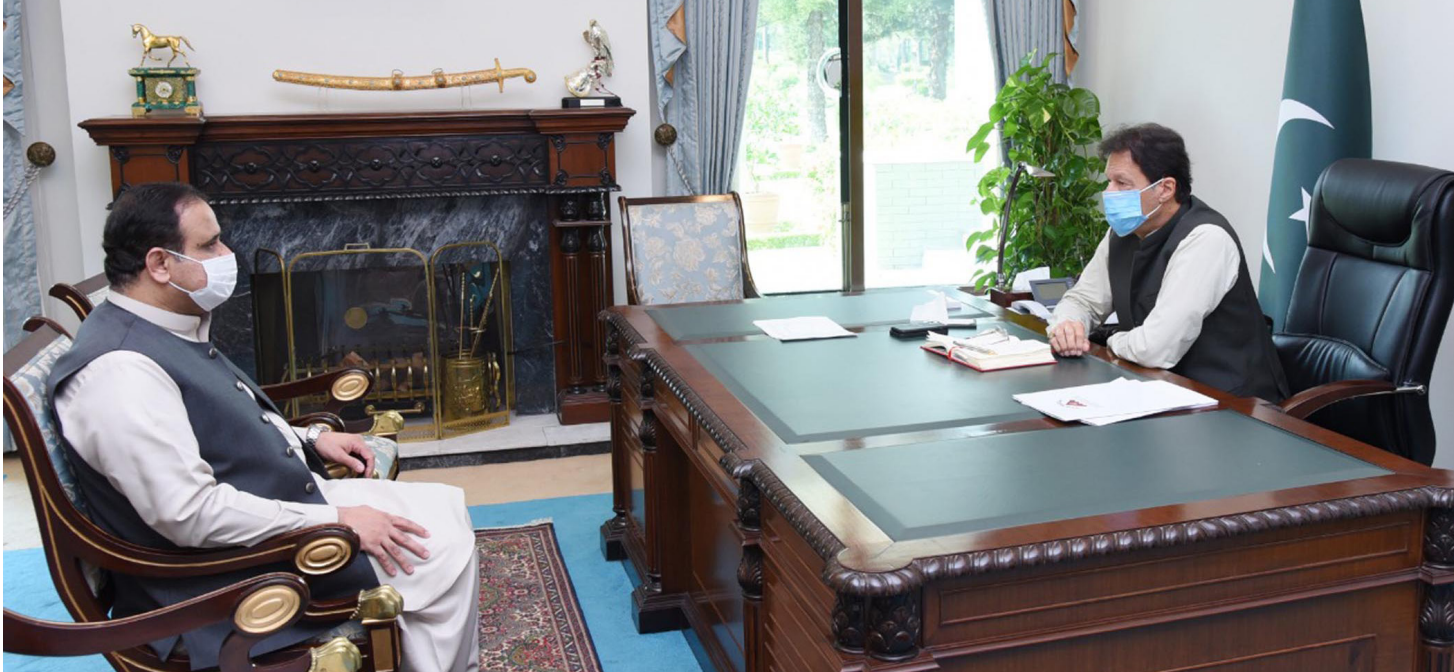
ISLAMABAD: Chief Minister Usman Buzdar calls on Prime Minister Imran Khan. (News on Front Page). – DNA

ISLAMABAD: In order to make the Federal Capital more green, beautiful and attractive the campaign is in full swing, the CDA environment department on the directions of the CDA management plants, trees in the monsoon throughout Islamabad. In this regard, the Department of Environment of has decorated the Argentine Park in Islamabad with beautiful and attractive colorful seasonal flowers which have become the center of attention of the citizens and every visitor. They are refreshing the eyes by showing a charming and charming scene and at the same time these colorful flowers are inviting every special and ordinary person. In addition, under the special direction of CDA management, the Department of Environment is busy decorating other parks, roads, intersections, green belts, slopes along drains of Islamabad with beautiful colorful seasonal flowers. Duties have also been distributed among the concerned staff with proper planning. In this regard, orders have been issued by the CDA administration to the Department of Environment to further expedite the work.