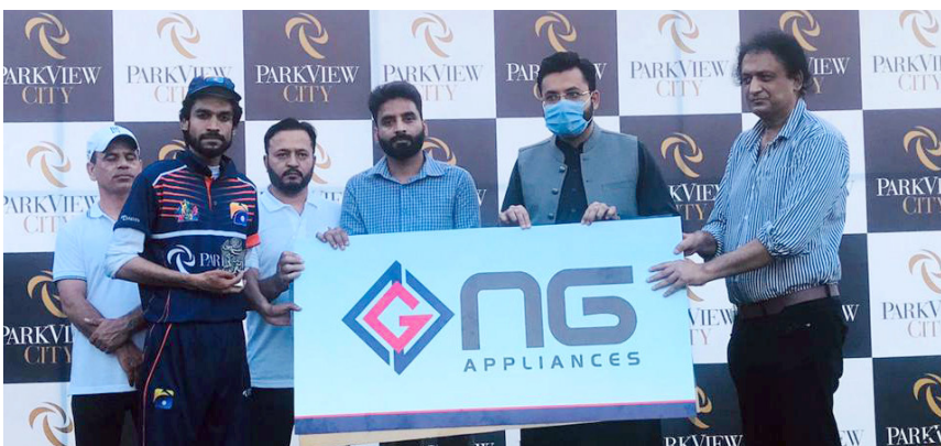
ISLAMABAD: State Minister for Information and Broadcasting Farrukh Habib presenting man of the man to player during on going RISJA Inter-Media Independence Cricket Cup at National Cricket Ground Islamabad. - DNA

ISLAMABAD: State Minister for Information and Broadcasting Farrukh Habib said that India is afraid of the Kashmir Premier League (KPL) and Modi wants to dominate cricket with coercive thinking but KPL will expose him. He was speaking as chief guest during the prize distribution ceremony of first RISJA Inter-Media Independence Cricket Cup at National cricket ground organized by Rawalpindi-Islamabad Sports Journalists Association (RISJA) with the collaboration of Park View and NasGas. Farrukh Habib said that the government wants to promote sports in the country and it is a priority to bring out the national