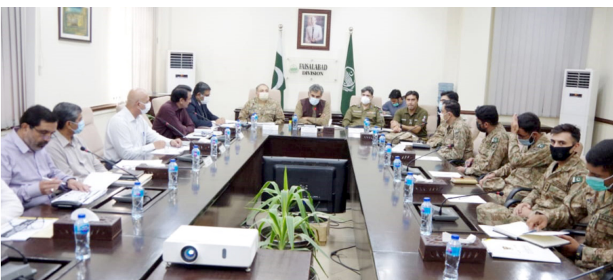
FAISALABAD: Divisional Commissioner Saqib Manan chairs a meeting of Coordination Committee regarding anti-corona.