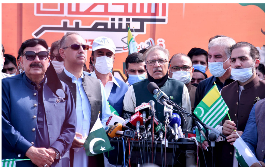
ISLAMABAD: President Dr Arif Alvi addressing the Youm-e-Istehsal rally, at Islamabad, on 05-08-2021.