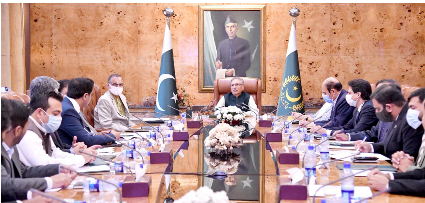
ISLAMABAD: President Dr. Arif Alvi chairing a meeting of the Sub-Committee on emerging technologies in I-Voting, at Aiwan-e-Sadr.

The water level in the Jhelum River at Mangla Dam was 1196.05 feet, which was 146.00 feet higher than its dead level of 1050 feet whereas the inflow and outflow of water was recorded as 44787 and 10,000 cusecs respectively. The release of water at Kalabagh, Taunsa and Sukkur was recorded as 225764, 319954 and 202170 cusecs respectively. Similarly, from the Kabul River a total of 52700 cusecs of water was released at Nowshera and 80500 cusecs released from the Chenab River at Marala. — APP