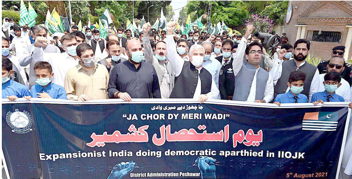
PESHAWAR: Chief Minister KP Mehmoood Khan, Provincial cabinet members and others participating in a rally to mark Youm-e-Istehsal (Kashmir Siege Day) on military siege in Indian Occupied Kashmir. — DNA

PESHAWAR: Khyber Pakhtunkhwa Chief Minister, Mahmood Khan here on Thursday led a big protest rally in connection with Kashmir Exploitation Day to strongly condemn an illegal annexation of Indian Illegally Occupied Jammu and Kashmir (IIOJK) and expressed solidarity with the oppressed Kashmiris of the held valley. Provincial Ministers, Advisors, Special Assistants to the Chief Minister, Civil Servants, Government officials, human rights activists, members from civil society, elites of the City besides students and people in large number attended the Kashmir Exploitation Day's rally. Prominent among those, who attended the Kashmir Black Day rally include Provincial Minister Taimur Salim Jhagra, Special Assistant