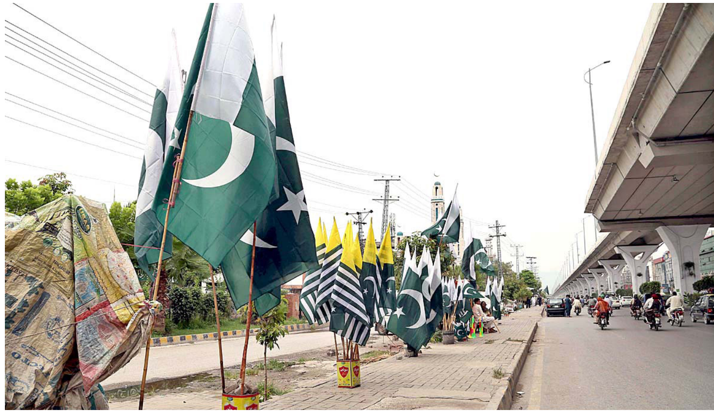
RAWALPINDI: A vendor displaying national flags to attract the customers at his roadside setup as the nation starts preparation to celebrate Independence Day in befitting manners.

RAWALPINDI: On the special directives of Advisor to Chief Minister Punjab, Asif Mehmood, Parks and Horticulture Authority (PHA) Rawalpindi has planted thousands of saplings on various highways and greenbelts of Rawalpindi city under monsoon tree plantation campaign. According to a PHA spokesman, thousands of saplings were planted under monsoon tree plantation campaign and the citizens and students of schools and colleges were also motivated and involved in the ongoing plantation campaign. She informed that PHA was taking all possible steps to make the monsoon plantation campaign a success. Advisor also participated in the campaign by planting saplings at various highways and greenbelts of Rawalpindi, she added. Director General (DG) PHA Rawalpindi Zabeer Ahmed Jappa said that PHA Rawalpindi, as per the vision of the Prime Minister, Imran Khan and Chief Minister Punjab, Sardar Usman Buzdar was taking all possible steps to provide a pollution free and healthy environment to the citizens.