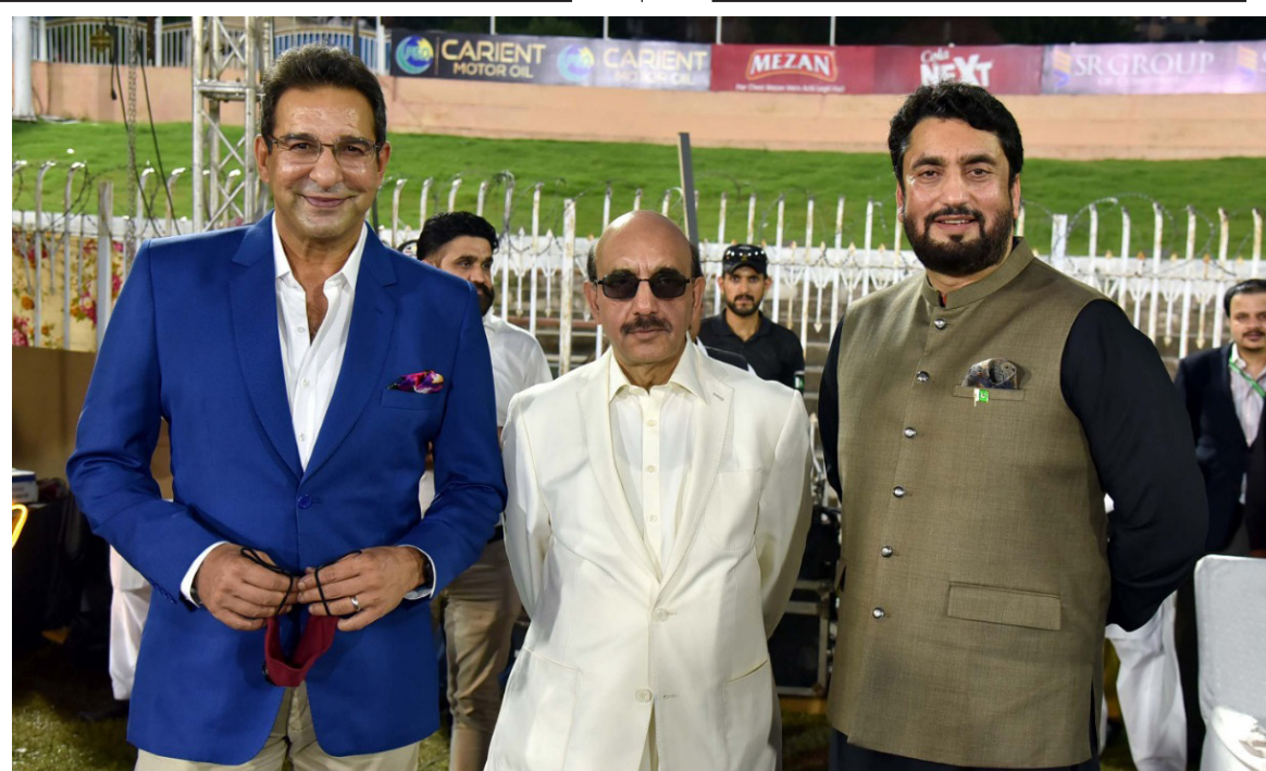
MUZAFFARABAD: A group photo of President Azad Jammu and Kashmir Masood Khan with Shehryar Khan Afridi, Chairman Parliamentary Committee on Kashmir and Wasim Akram, Vice President Kashmir Premier League (KPL) at Muzaffarabad Cricket Stadium.