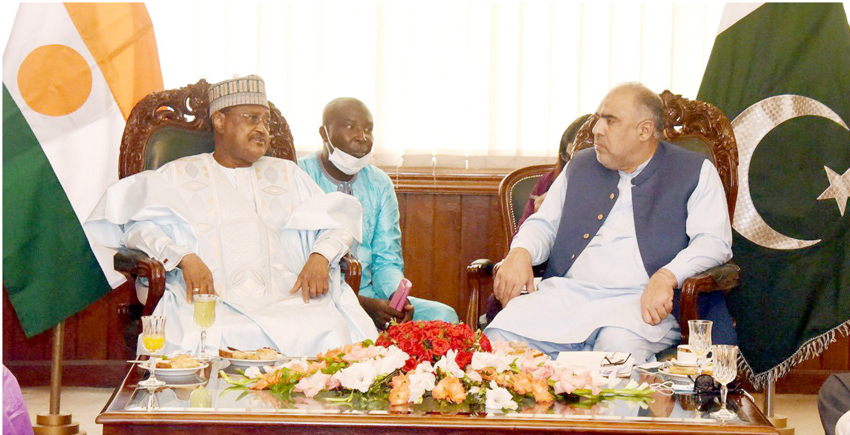
ISLAMABAD: Speaker National Assembly Asad Qaiser in a meeting with President of Niger's National Assembly Seyni Oumarou. Both sides discussed ways to promote trade & business opportunities and parliamentary exchanges. Speaker appreciates Niger's support on IIOJK stance.