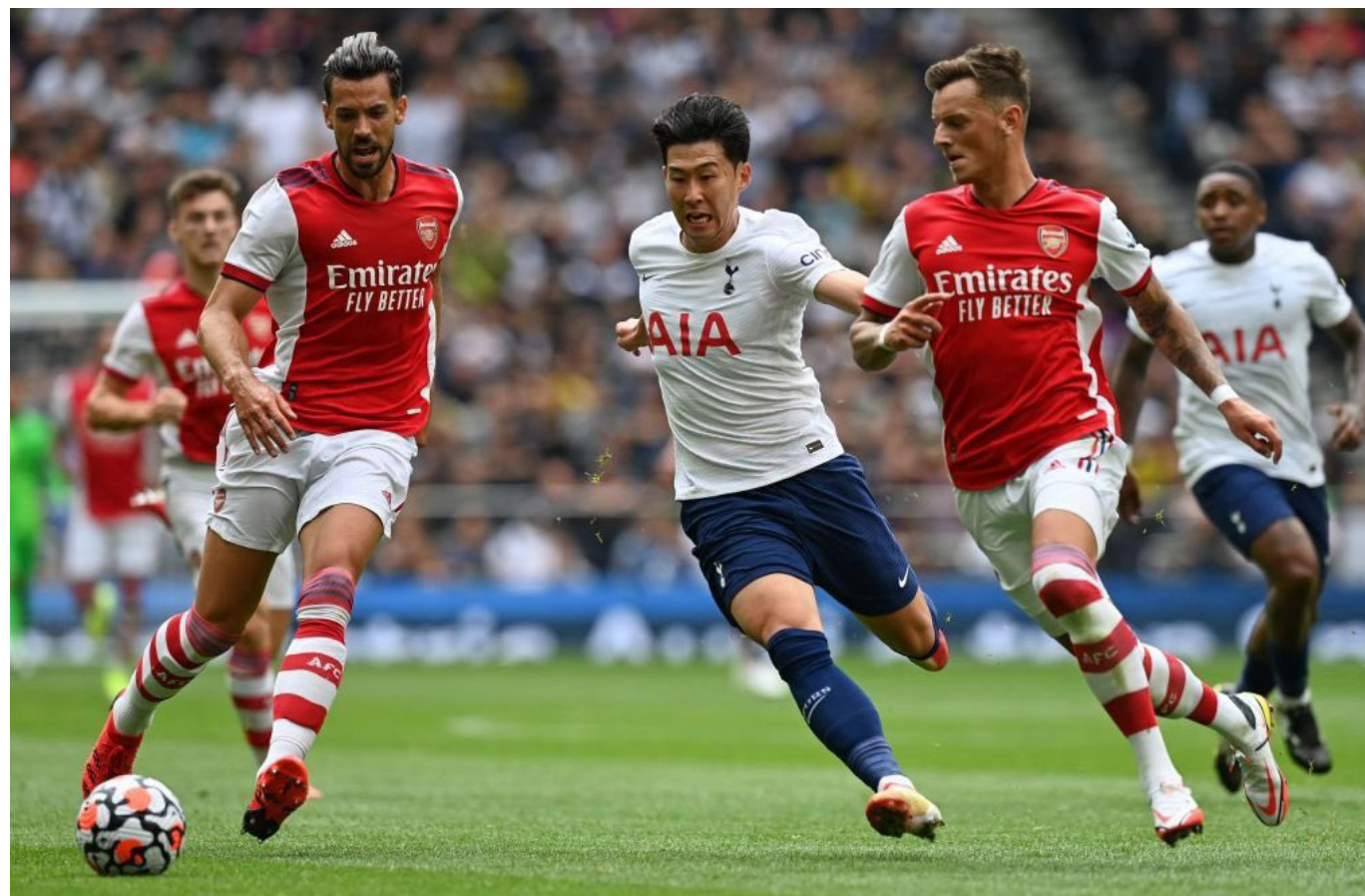
LONDON: Arsenal and Tottenham Hotspur players in action during a friendly game at Tottenham Hotspur stadium.

FROM PAGE 01 "The Indian Illegally Occupied Jammu and Kashmir (IIOJK) is one of the most militarised zones in the world with over 900,000 Indian security personnel. India has erected a multi-tiered fence, installed electronic surveillance equipment, and set up multiple layers of security, making it impossible for anything to cross the LoC to enter IIOJK. Therefore, such allegations recycled from time to time have no basis to stand on." On its part, India has been involved in state-terrorism in IIOJK and against Pakistan. From the Samjhota Express killings of February 2007 to the terrorist blast in Lahore in June 2021, terror incidents targeting Pakistanis have had an Indian hand. Earlier in 2020, Pakistan had provided irrefutable evidence to the world community of India's aiding, abetting and financing of state-sponsored terrorism against Pakistan through a detailed dossier.