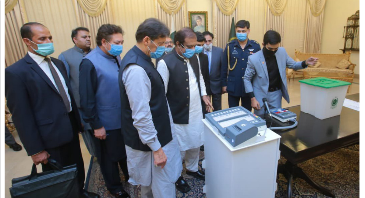
ISLAMABAD: Prime Minister Imran Khan is inspecting Pakistan's first Electronic Voting Machine. Federal Minister for Information and Broadcasting Fawad Chaudhry and Minister for Science and Technology Shibli Faraz are also present. - DNA

ISLAMABAD: A delegation from Afghanistan visited Islamabad in connection with the reported complaint of daughter of the Ambassador of Afghanistan to Pakistan of 16 July 2021. During the visit, the delegation met with the officials of law-enforcement agencies and the Ministry of Foreign Affairs. According to a MOFA statement, the delegation was given a comprehensive briefing on all aspects of investigation conducted by the relevant Pakistani authorities in the reported incident. They were also taken to the Safe City Office, Islamabad, where they were shown several video footages from various locations of different timings in which the complainant was clearly identifiable moving around the places independently. An on-site visit of all the locations visited by the complainant was arranged for the delegation, followed by presentation of technical data (findings of mobile forensic/geo fencing) as well. - Saifullah