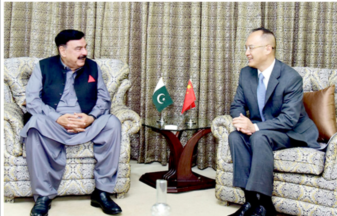
ISLAMABAD: Chinese Ambassador to Pakistan Nong Rong calls on Minister for Interior Sheikh Rashid Ahmad.

power can create hurdles in the way of Pakistan-China friendship." The Chinese ambassador said a number of companies have been working on different projects in Pakistan. "We thank the Pakistani government for the facilities it provided to the Chinese workers," he said.