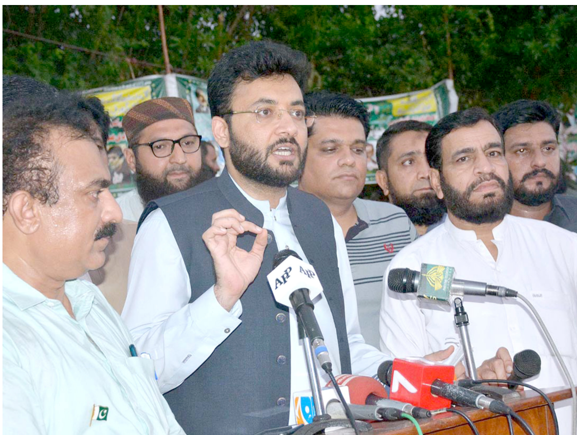
FAISALABAD: State Minister for Information & Broadcasting Farrukh Habib is talking to media persons during tree plantation ceremony in Nazimabad City. — DNA

FAISALABAD: As many as 1,289,596 people have so far been vaccinated against COVID-19 in the district. District Health Officer (DHO) Dr Ataul Mun'im said on Sunday that 1,026,824 citizens were injected first dose while 216,032 were administered second dose of vaccine. He further said that 28,286 health workers were also given first dose while 18,454 received the second dose of vaccine. He said that sufficient stock of coronavirus vaccine was available in the district, adding 51,125 first doses and 34,084 second doses were available in stock. He said that 37 vaccination centres and 20 mobile vaccination camps were operational in district, where registered people also getting coronavirus vaccine doses. People can get vaccinated themselves from vaccination centres set up in Allied Hospital, District Headquarters Hospital, Government General Hospital G.M Abad, Faisalabad Institute of Cardiology, Government General Hospital Samanabad, Children Hospital, Sports Complex Samanabad, Tehsil Headquarters Hospital Jaranwala, Samundri, Tandlianwala, Chak Jhumra, Sports Complex Chak Jhumra, Sports Complex Jaranwala, Government General Hospital Chak 224-RB and New Building RHC Khurrianwala.