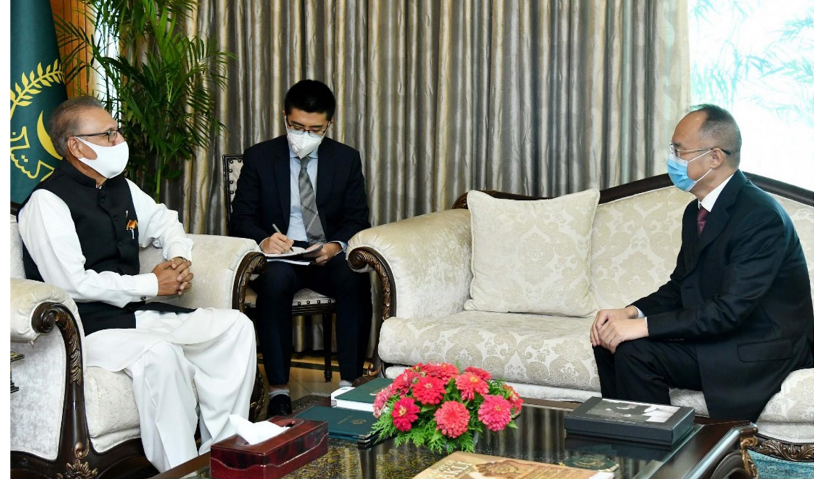
ISLAMABAD: The Ambassador of China to Pakistan, Nong Rong called on President Dr. Arif Alvi at Aiwan-e-Sadr.