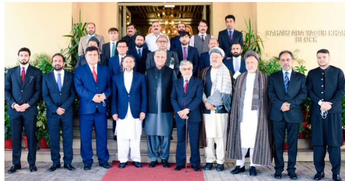
ISLAMABAD: Foreign Minister, Makhdoom Shah Mahmood Qureshi in a group photo with the political leaders from Afghanistan.