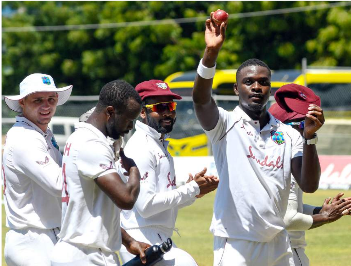
JAMAICA: Players of WI cricket team celebrating after defeating Pakistan in first Test match.

In addition, Armenia is closely following the active participation of India in the project of the North-South international transport corridor and its plans for the development of the Chabahar port. Grigoryan noted that there is a lot in common between the two peoples - first of all, human potential - hard work, dedication, talent for creative innovation, as well as commitment to preserving a rich history, cultural heritage and value system. Official Yerevan is determined to bring bilateral cooperation to a qualitatively new level for the benefit of both countries and peoples.