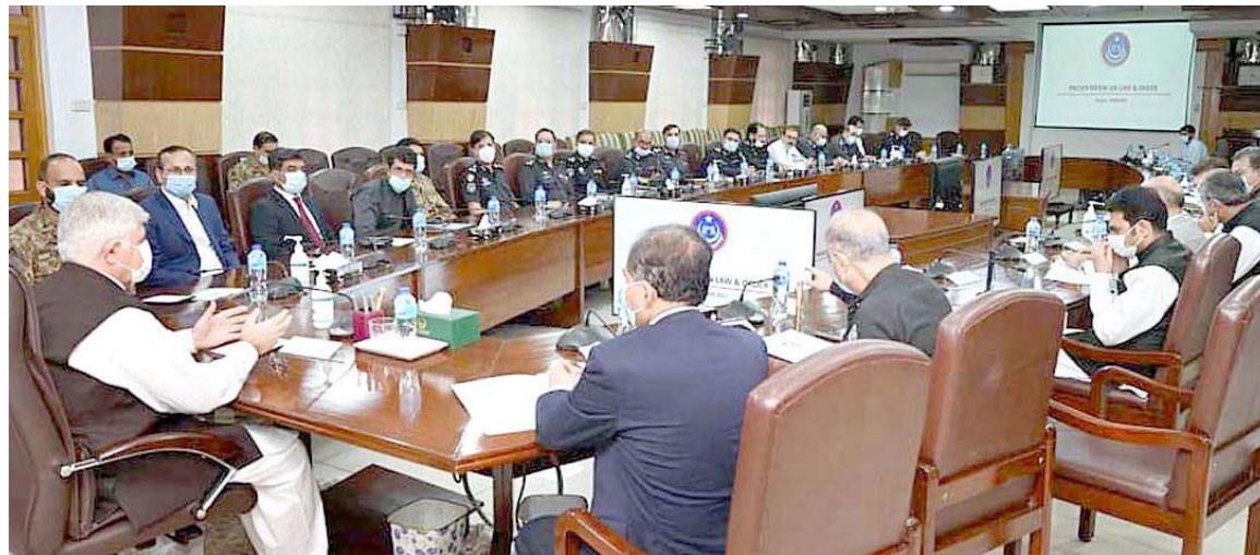
PESHAWAR: Chief Minister Khyber Pakhtunkhwa Mahmood Khan chairing a meeting to review law & order situation in the province.

FESCO had been paid the funds of Rs 760.00 million in this connection. He informed the work of boundary wall is under way which is being constructed at a cost of Rs 10.00 million. The DG concluded that the door of his office is open for every citizen and complaints are being entertained properly.