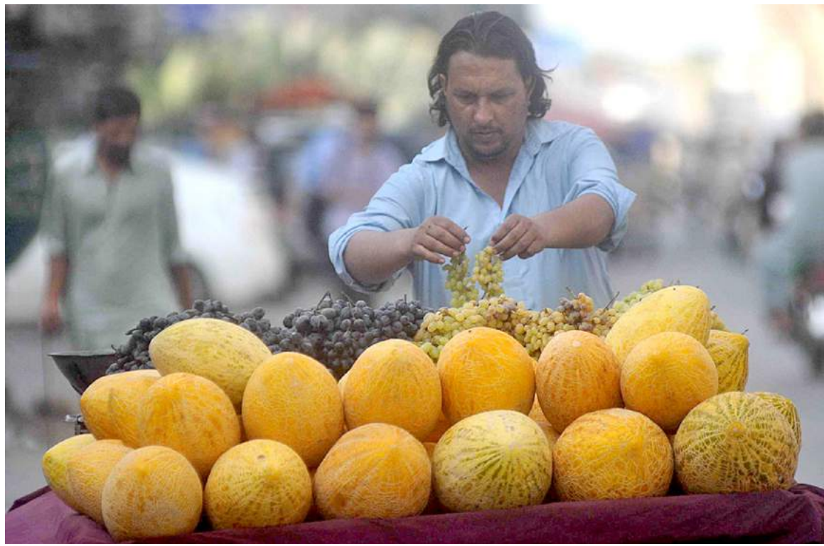
RAWALPINDI: A street vendor displaying and arranging different kind of seasonal fruits to attract the customers.

PTCL Groups MTO program is one of the most sought-after management trainee programs in the country, as it provides real-time learning to young graduates, besides familiarizing them with the ins and outs of Pakistan's tech industry and life skills that can propel them far ahead in their professional careers.