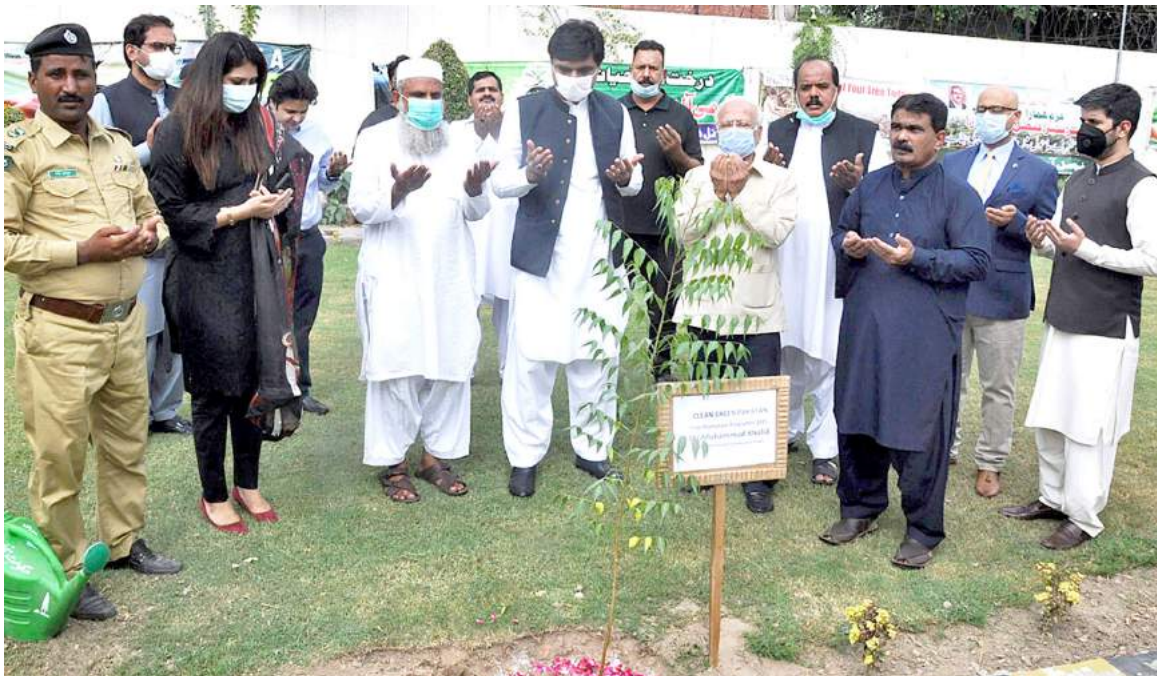
FAISALABAD: Advisor to Prime Minister on Institutional Reforms & Austerity Dr Ishrat Hussain offering dua after planting a sapling at DC Complex under Plant for Pakistan Programme.