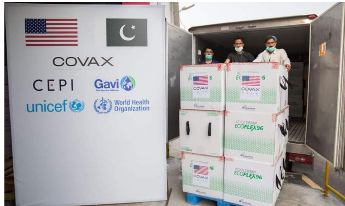
KARACHI: A shipment of anti-Covid vaccines through the COVAX initiative being unloaded.

road near a fishermen's colony, the statement had added. Noting the quick response of Pakistani authorities, the Chinese mission said that after the incident, the Pakistani side sent the wounded to the hospital in Gwadar for treatment immediately. "The Chinese Embassy in Pakistan strongly condemns this act of terrorism, extends its sincere sympathies to the injured of both countries, and expresses its deep condolences to the innocent victims in Pakistan," it said. Following the attack on the convoy, the embassy said, it launched an emergency plan immediately. The embassy demanded Pakistan to properly treat the wounded, conduct a thorough investigation and severely punish the perpetrators. The incident comes less than two weeks after a motorcycle bomb blast took place at Quetta's Hali Road roundabout, near Balochistan Assembly and the High Court, leaving two policemen martyred and 21 others, including 12 policemen, injured. China is heavily involved in the development of the Gwadar port on the Arabian Sea as part of the $60 billion CPEC, which is itself part of China's BRI project.