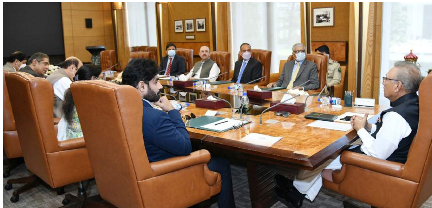
ISLAMABAD: President Dr. Arif Alvi chairing a meeting of Managing Body of Pakistan Red Crescent Society, at Aiwan-e-Sadr.

ISLAMABAD: A total of 210,396 women of low income group have so far completed their vocational training from 160 Women Empowerment Centres (WECs) being run by Pakistan Bait-ul-Mal while 13,231 trainees were currently getting training from these centres. According to official document, WECs were providing free training to widows, orphans, poor girls in different skill including drafting, cutting, sewing, knitting, hand & machine embroidery, interior decoration, beautician, cooking, tie & dye, glass painting, computers, photocopyers, printers, and use of office equipment according to the requirement. Training emphasized on income generating activities. Low-income group of women/girls were being trained in two shifts. PBM has planned to have at least one Vocational Dastkari School in each district. - APP