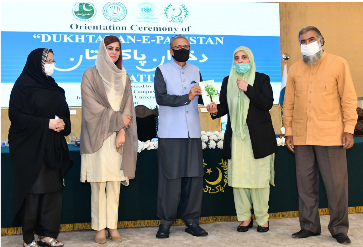
ISLAMABAD: President Dr. Arif Alvi being presented with the book Dukhtran-e-Pakistan, "Daughters of Pakistan, The Envoys of Peace", at Aiwan-e-Sadr.

Bill, 2021 were considered. The Secretary, Maritime Affairs Committee informed the Committee that only 21 sections of the Port Qasim Authority ACT, 1973 are being amended. Similarly, only 13 sections of Pakistan National Shipping Corporation Ordinance 1979 are being amended and that only 25 sections of Gwadar Port Authority Ordinance, 2002 were being amended. A detailed discussion between the members of the committee and the Ministry officials took place on whether or not such amendments can take place by law.