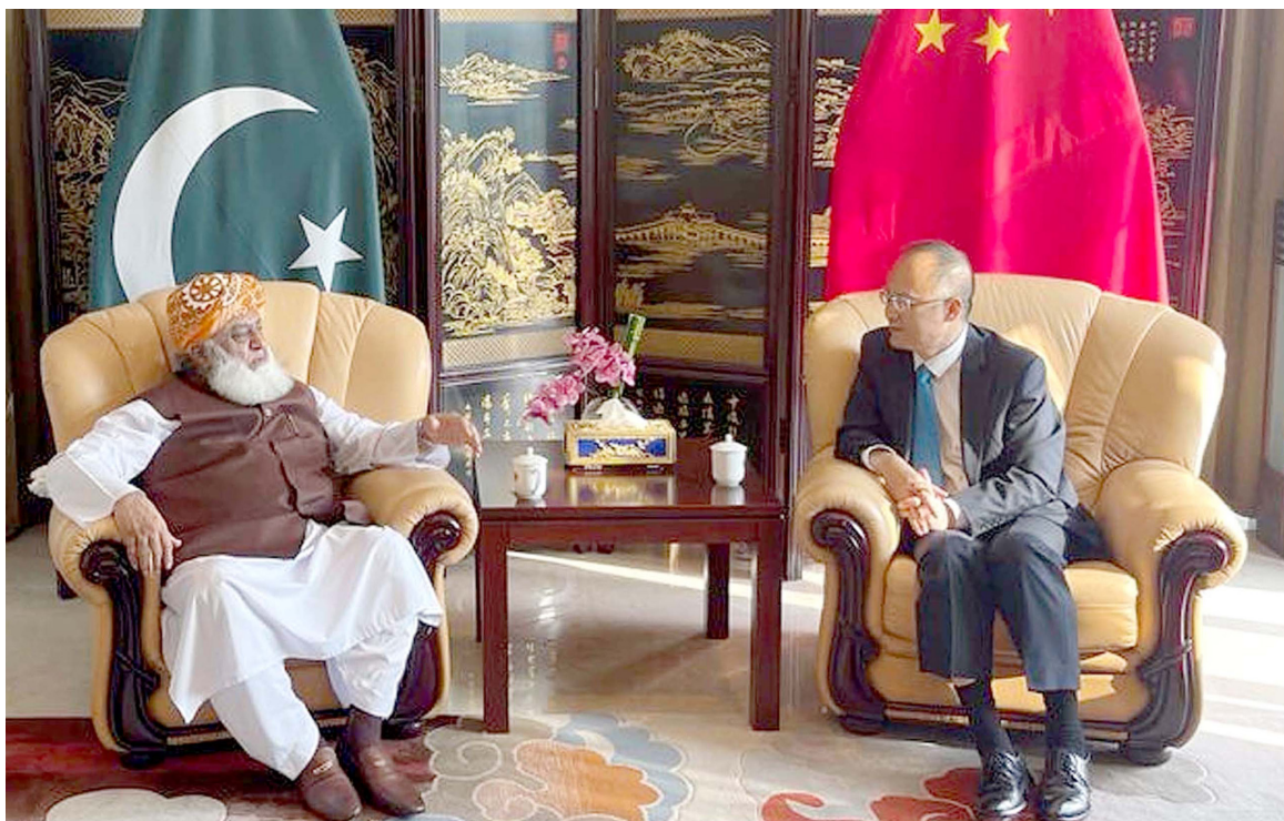
ISLAMABAD: Chinese ambassador Nong Rong in a meeting with JUI-F chief Molana Fazl ur Rehman.

(Pemra) was a rich organisation, “but unfortunately it didn't spend a penny on journalists' training, research and digital media since its formation.” He said there were currently seven laws regulating media in Pakistan. “Social media is dealt by the PTA, press is managed by the Press Council, the electronic media is dealt by Pemra, labour regulations are looked after by Implementation Tribunal for Newspapers Employees (ITNE), while the Audit Bureau of Circulation (ABC) deals with newspaper registrations.” He reiterated that all the laws were being abolished to replace them with the one authority – the PMDA.