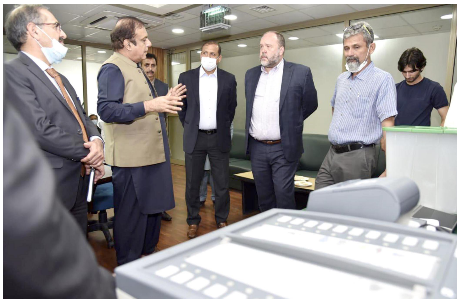
ISLAMABAD: Federal Minister for Science and Technology Senator Shibli Faraz while briefing members of FAFEN and UNDP on Electronic Voting Machine.