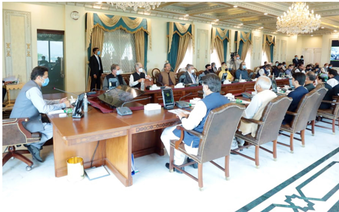
ISLAMABAD: Prime Minister Imran Khan chairs a meeting of federal cabinet.

It was also declared that full vaccination by September 30 would be compulsory for