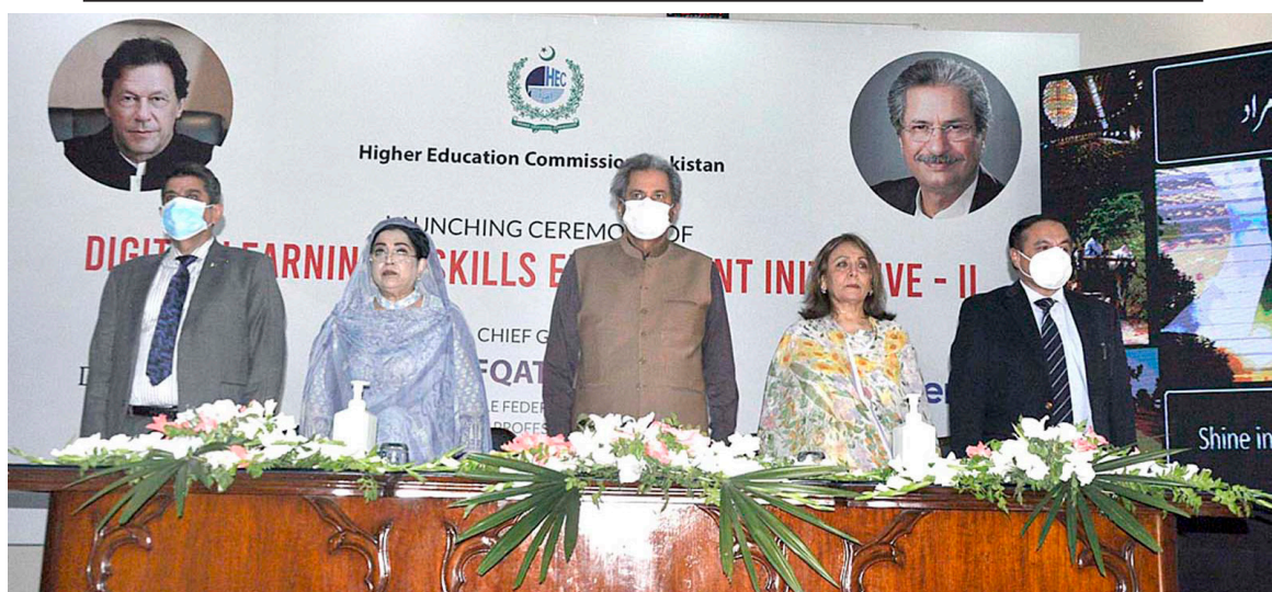
ISLAMABAD: Federal Minister for Federal Education and Professional Training, Shafqat Mahmood standing in respect of national anthem at launching ceremony of Digital Learning & Skills Enrichment Initiative-II at HEC.

interact with public and resolve their complaints on priority basis. He asked them to specify an hour on daily basis for listening to public complaints. Islamabad police chief also interacted with visitors and inquired from the staff at Front Desk about process to lodge complaints. He expressed his annoyance over not shifting the impounded bikes and vehicles at proper place and directed to hand over the identified vehicles to their actual owners. — DNA