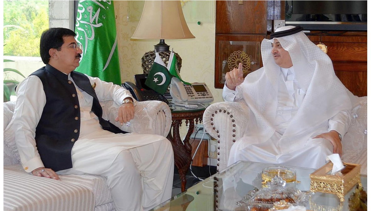
ISLAMABAD: Chairman Senate Sadiq Sanjrani in a meeting with Ambassador of Saudi Arabia Nawaf Bin Saeed Al Maliki at embassy of Saudi Arabia.

LAHORE: Pakistan Muslim League-Nawaz (PML-N) Sindh General Secretary Miftah Ismael has resigned from his party post arguing that politics became difficult in the presence of 'badmash tola' (mafia) in Karachi. The sources further claimed that Miftah Ismael had tendered his resignation to the top leadership of the party. The sources said while giving reasons for his resignation Miftah Ismael said politics has become very difficult in Karachi and Sindh in the presence of "a gang of goons". It is pertinent to note that PPP candidate Qadir Khan Mandokhail had emerged victorious in NA-249 by-poll recount defeating Miftah Ismael of PML-N by 909 votes.