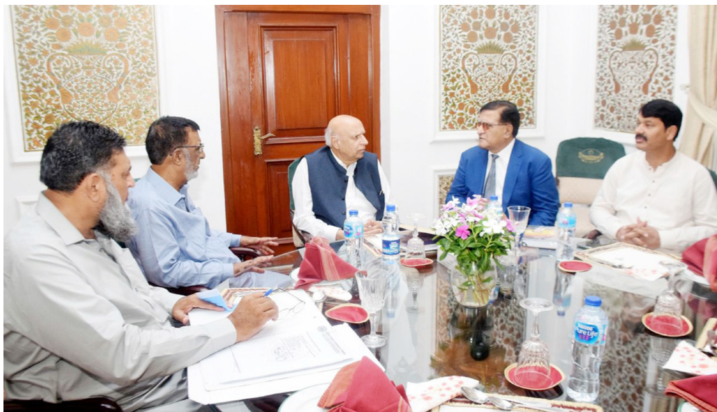
Chaudhry Muhammad Sarwar about the problems of Chakwal.