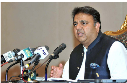
ISLAMABAD: Federal Minister for Information and Broadcasting Chaudhry Fawad Hussain addressing a press conference.

Fawad Ch says Pakistan carrying out serious efforts for the evacuation of foreign nationals from Kabul