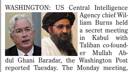
WASHINGTON: US Central Intelligence Agency chief William Burns held a secret meeting in Kabul with Taliban co-founder Mullah Abdul Ghani Baradar, the Washington Post reported Tuesday. The Monday meeting,