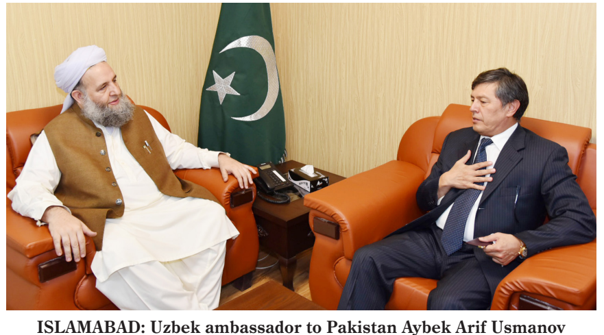
in a meeting with Minister for Religious Affairs and Interfaith Harmony Noor-ul-Haq Qadri. - DNA

Both the dignitaries also agreed to maintain close liaison in order to effectively deal with the menaces of terrorism and extremism. The Uzbek ambassador in vited the minister to visit