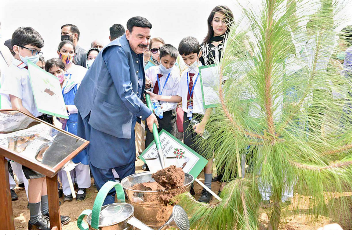
ISLAMABAD: Interior Minister Sheikh Rashid Ahmad launching Tree Plantation Drive at Mal Pur in collaboration with "Save the Children".

try of Foreign Affairs' Science Diplomacy Initiative, one key objective of which is to provide local S&T stakeholders a platform to showcase their innovations for pursuing international partnerships.