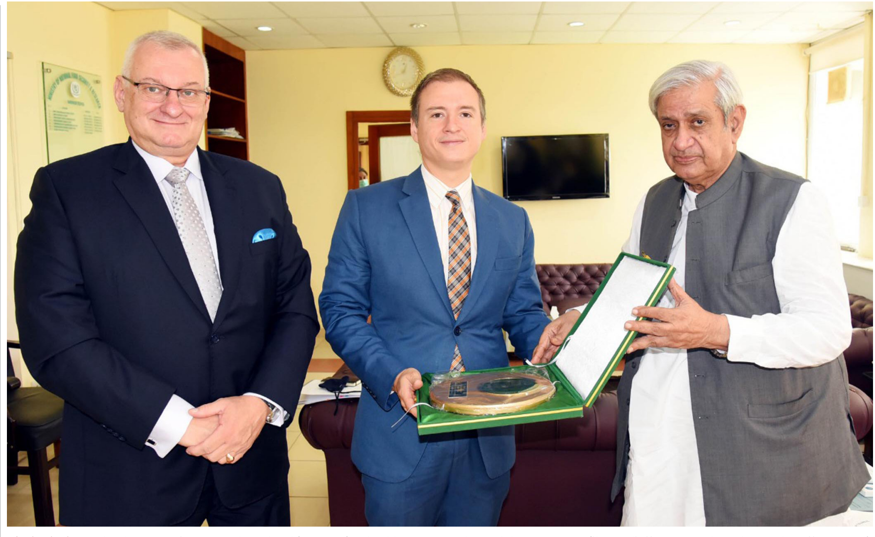
ISLAMABAD: Federal Minister for National Food and Security Syed Fakhar Imam welcomed the Hungarian Charge d'affaires, Tivadar Takacs at his office. – DNA

Welcoming the Foreign Minister, the Uzbek Foreign Minister, the Uzbek Foreign Minister highlighted upward trajectory in the bilateral relations. Foreign Minister Kamilov termed Foreign Minister Qureshi's visit important and timely in terms of close coordinated approach on Afghanistan. The two FM agreed to continue consultations to advance shared objectives of a peaceful, prosperous and connected region.