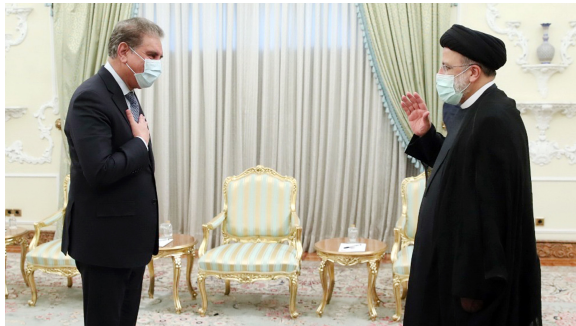
TEHRAN: Iran President Ebrahim Raisi receives Foreign Minister Shah Mehmood Qureshi.