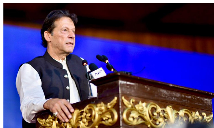
ISLAMABAD: Prime Minister Imran Khan addressing an event to commemorate three years of PTI govt.

ISLAMABAD: Prime Minister Imran Khan has emphatically stated that Pakistan will not become part of any foreign conflict and vowed to economically uplift the country. He was addressing a ceremony in connection with three-year performance of Pakistan Tehreek-e-Insaf government in Islamabad on Thursday. The prime minister further said that Taliban should be given a chance to deliver. He said people have started criticizing Taliban even before their government is formed. He said Taliban have assured the world community that their soil should not be used against anybody therefore they should be given proper time. If they fail to keep up their promises then the world has every right to criticize them.