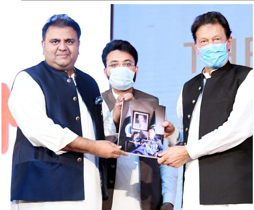
ISLAMABAD: Federal Information Minister Fawad Ch and State Minister Farrukh Habib present three year performance report to Prime Minister Imran Khan.