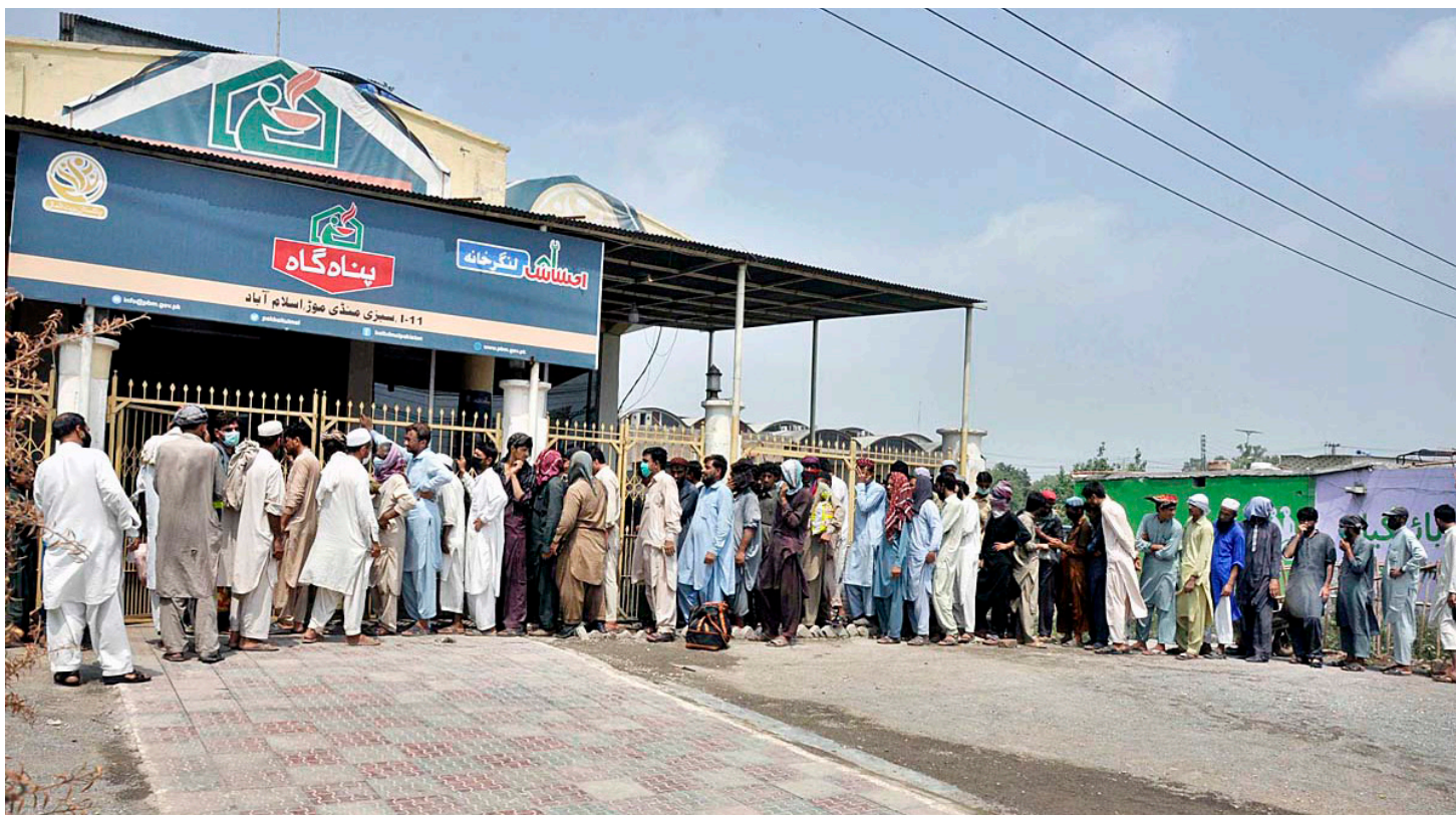
ISLAMABAD: A large number of people standing in queue for getting free food distributed at Panagah in I-11 Sector under Ehsaas Program. - APP

ISLAMABAD: The Cabinet Committee on Energy (CCOE) Thursday approved the Indicative Generation Capacity Expansion Plan - known as IGCEP 2021-30, an indicative annual plan prepared by the National Transmission and Dispatch Company (NTDC) as per National Electricity Policy (NEP) approved by the Council of Common Interest (CCI). The meeting presided over by Minister for Planning, Development, and Special Initiatives Asad Umar here approved the Plan presented by the Power Division after detailed consultations with all the provincial governments.