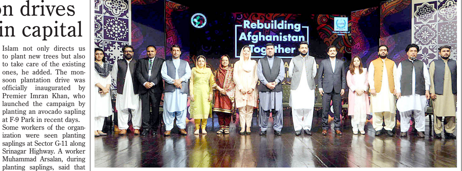
ISLAMABAD: A group photo of Minister of State for Information and Broadcasting Mr Farrukh Habib with the team analysts after the session "Rebuilding Afghanistan Together and Life Beyond War" program at PNCA in the Federal.

Pakistan has made progress, but still fell shorty of fully complying with the FATF's action plan. It needs to exit the grey list because a potential downgrade to the blacklist has serious implications for the country. Being on the blacklist means the country's banking system will be regarded as one with poor controls over AML and CFT.