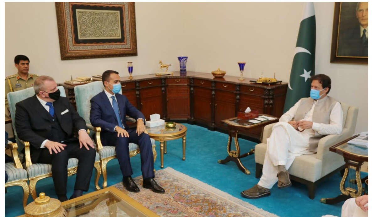
ISLAMABAD: Prime Minister Imran Khan exchanging views with Italy's Foreign Minister Luigi Di Maio. Italian ambassador is also present on the occasion. – DNA