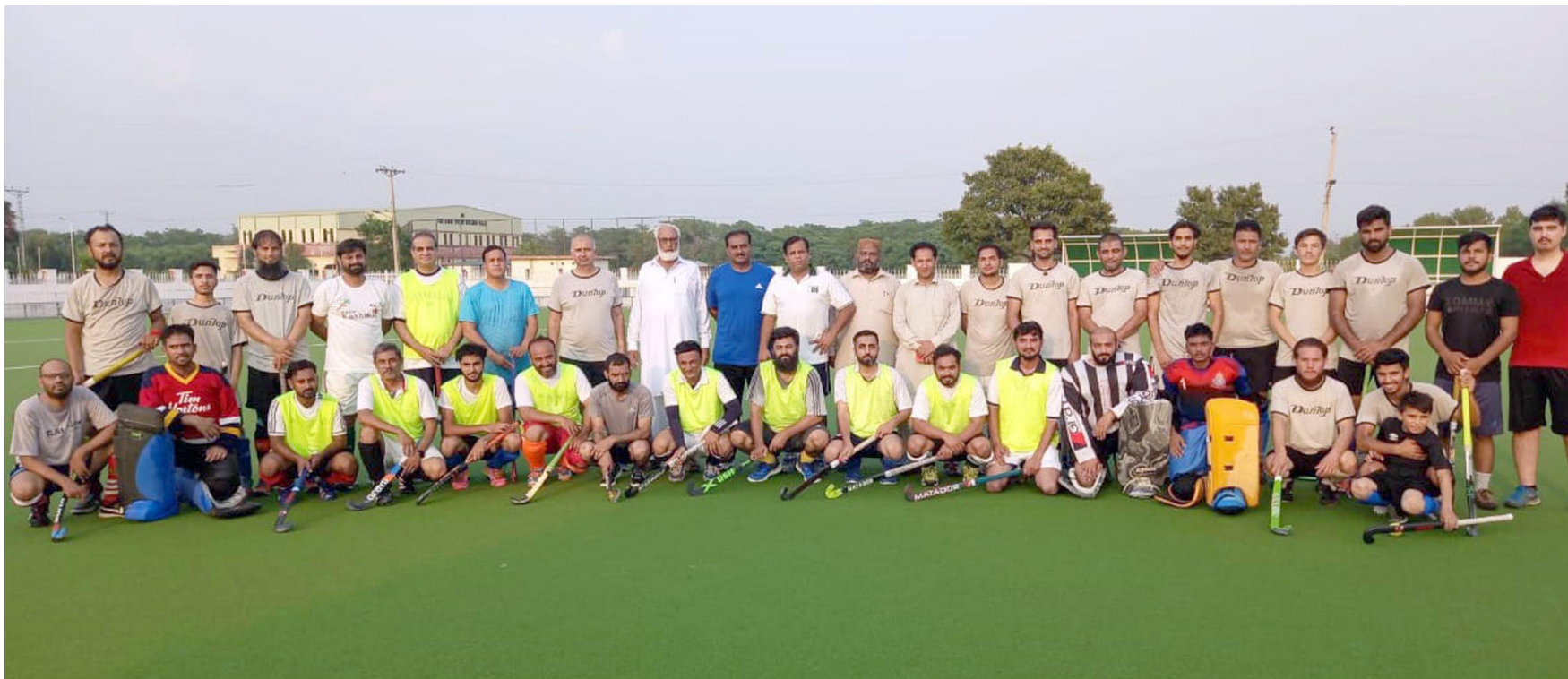
ISLAMABAD: Players of Nishtar Hockey Club and Faisal Hockey Club posing for a group picture on the occasion of an exhibition match played in connection with the September 6, the Defence Day of Pakistan.

FROM PAGE 01 He said India's mistreatment of Syed Ali Shah Geelani's family was part of its agenda to force Kashmiris to prevent them from demanding the exercise of their inalienable right to self-determination. However, it will never succeed, as the resolve of the Kashmiri people is getting strengthened with the passing of every day, he added. The spokesperson urged the international community to take serious note of this unprecedented repression, and the persisting systematic human rights violations in the Indian Illegally Occupied Jammu and Kashmir (IOJK). He also called for holding India to account for its inhuman, unjust and illegal actions.