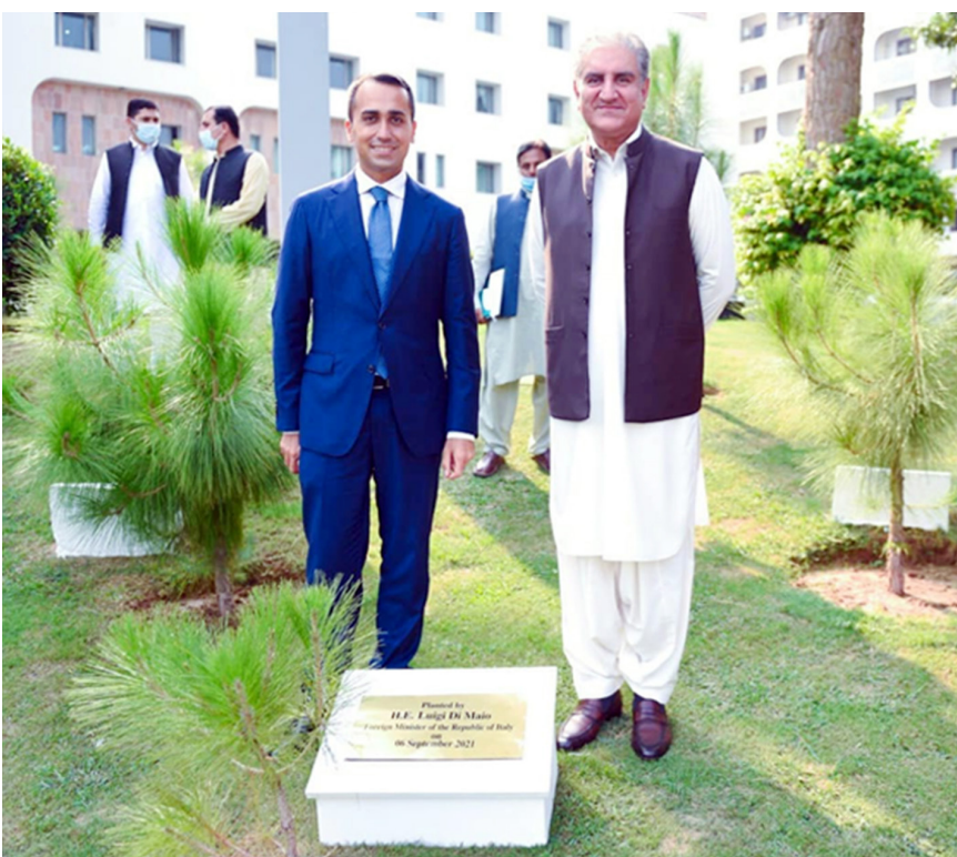
ISLAMABAD: Italian Minister of Foreign Affairs, Luigi Di Maio, Planted a pine tree in the lawn of Foreign Office along with Shah Mehmood Qureshi.

"Wild allegations and statements which may harm national solidarity or may create law and order shall be strictly avoided." The print and electronic media shall not use language in reporting events which may incite violence on any grounds, including race, sex, language and religion" reads the code of conduct. Meanwhile, Pemra has been asked to monitor the coverage given to parties through public and private radio and TV channels. The regulatory authority will now be required as per the code to obtain transmission certificates, details of payments made by the candidates or parties for campaign. Pemra will forward these details to ECP and ensure the compliance of code of conduct by all media organisations. — APP