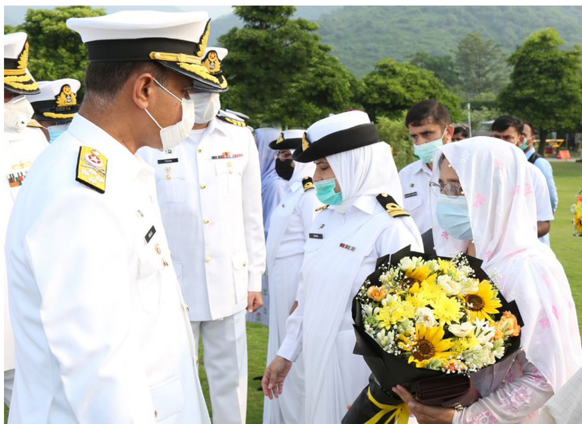
ISLAMABAD: Chief of the Naval Staff, Admiral Muhammad Amjad Khan Niazi interacting with Shuhada families on the occasion of Defence & Martyrs day of Pakistan at Naval HQs. – DNA

The next expo of the series is scheduled to be held in Sialkot 8th September Hotel the Jeeven's, Islamabad 9th September at Marriott Hotel, Faisalabad 9th September at Hotel One, Multan 10th September Garrison Library Cantt, Karachi 11th September Beach Luxury Hotel, Abbottabad 11th September at Hotel One, and Peshawar 12th September at PC Hotel. Entry to the exhibition is FREE with a mask and Scholarships up to 75% are also available.