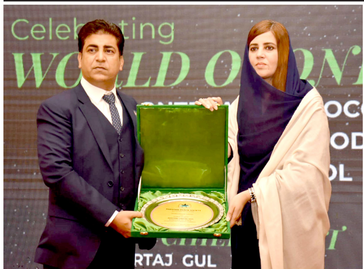
KARACHI: Minister of State for Climate Change Zartaj Gul is being presented memento during the ceremony of the World Ozone Day.