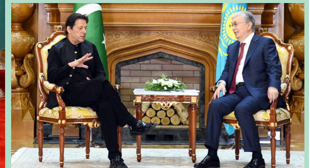
DUSHANBE: Prime Minister Imran exchanging views with President of Kazakhstan Kassym-Jomart Tokayev. - DNA

Zalmay blames Ghani's exit for Taliban takeover