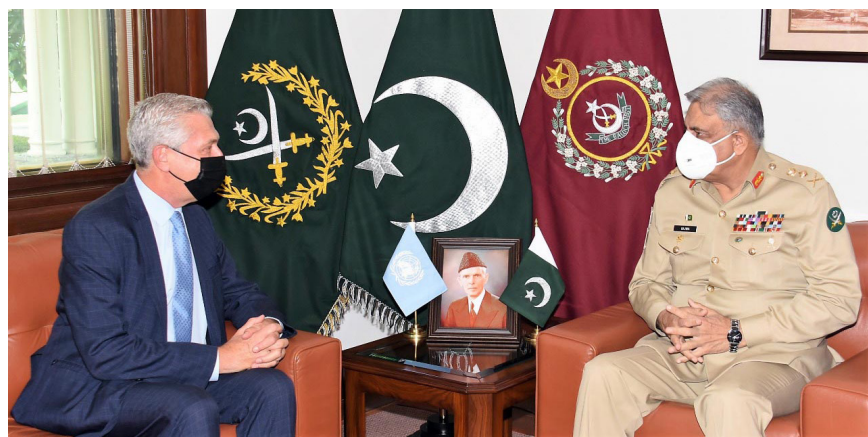
RAWALPINDI: Filippo Grandi, UN High Commissioner for Refugees called on General Qamar Bajwa, Chief of Army Staff.

This was stated in a meeting between Filippo Grandi, (UNHCR) and COAS General Qamar Bajwa