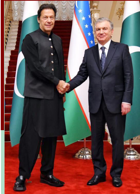
DUSHANBE: Prime Minister Imran Khan meets with President of Uzbekistan Shavkat Mirziyoyev.