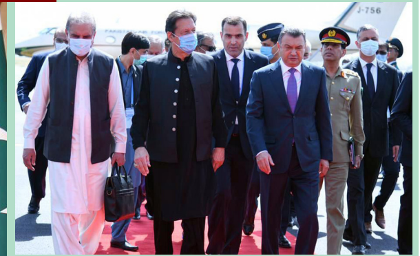
DUSHANBE: PM Imran in Dushanbe to attend SCO summit. - DNA