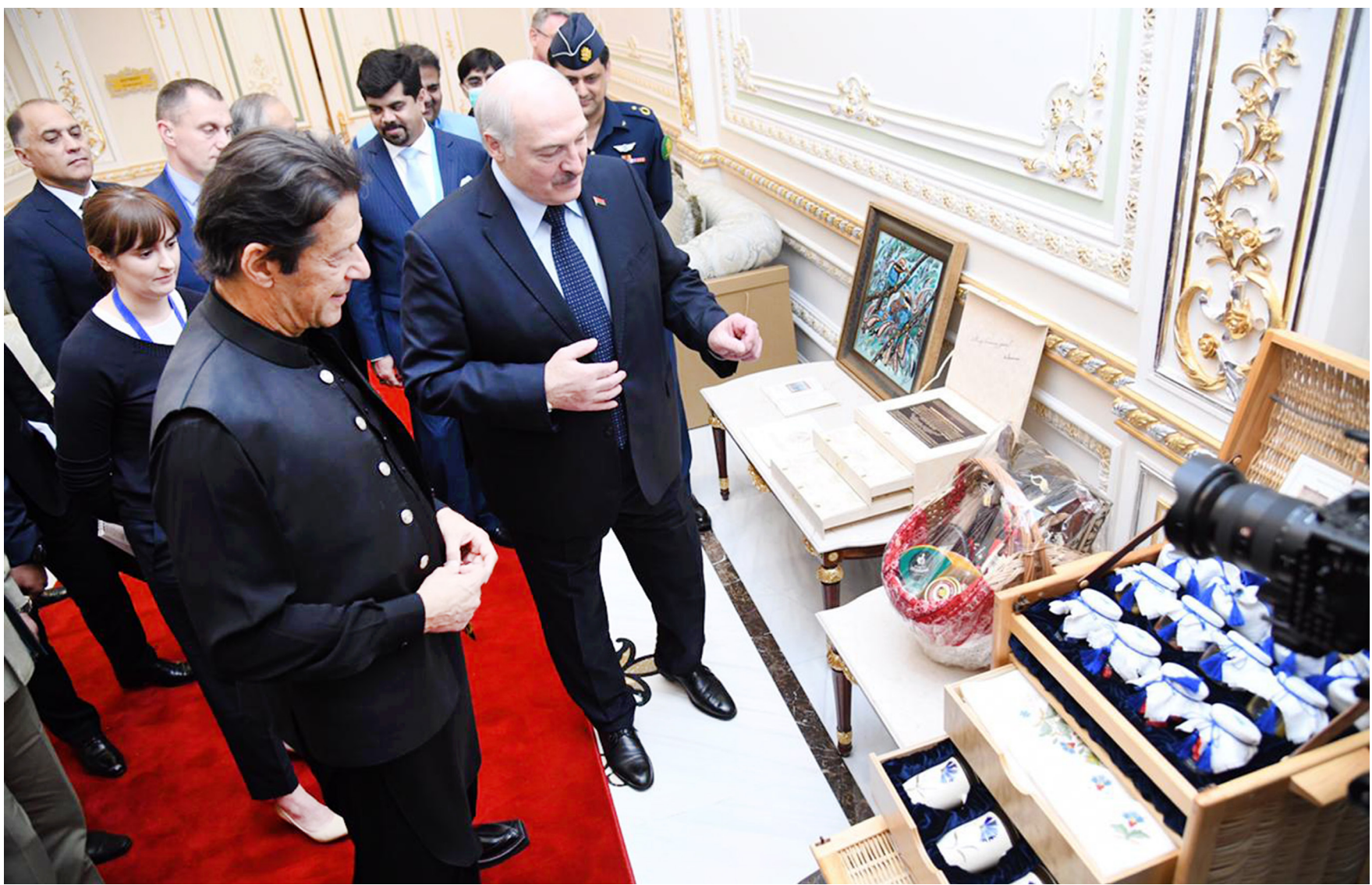
DUSHANBE: President of Belarus Alexander Lukashenko presented souvenirs to Prime Minister Imran Khan at Dushanbe.

DNA LAHORE: Pakistan International Airlines (PIA) on Thursday has decided to operate flights from Lahore to Peshawar. According to the PIA spokesperson, weekly two flights will be operated between Lahore to Peshawar from October 1. The first flight will take off for Peshawar from Lahore airport on October 1 at 11.40 am. The flights would be operated on Monday and Friday every week, the spokesperson said and added that ATR planes will be used for the flight operations. On Wednesday, the Economic Coordination Committee (ECC) of the cabinet had approved US$130 million cash support for Pakistan International Airlines (PIAC). A decision to this effect was taken at the ECC meeting, which was held in Islamabad with Finance Minister Shaukat Tarin in the chair. Earlier, the new Afghan government contacted the CAA Pakistan and sought permission for scheduled flights for Afghanistan Airlines Ariana and Kam Air.