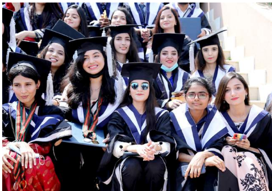
JAMSHORO: Graduating students of Mehran University of Engineering and Technology posing for a camera shot on the eve of 24th Convocation.

not be moved in the house as the issue was sub-judice. The minister said that he, along with Minister for Defence Pervaiz Khattak, had held two meetings with Prime Minister Imran Khan in this regard, adding, PM Khan directed them for seeking a review in this case. Opposition leader in the National Assembly Shahbaz Sharif said thousands of people were expelled from Pakistan International Assembly and Pakistan Steel Mill. He said load-shedding ended during the Pakistan Muslim League-Nawaz (PML-N) government and public transport and infrastructure was also developed in its tenure.