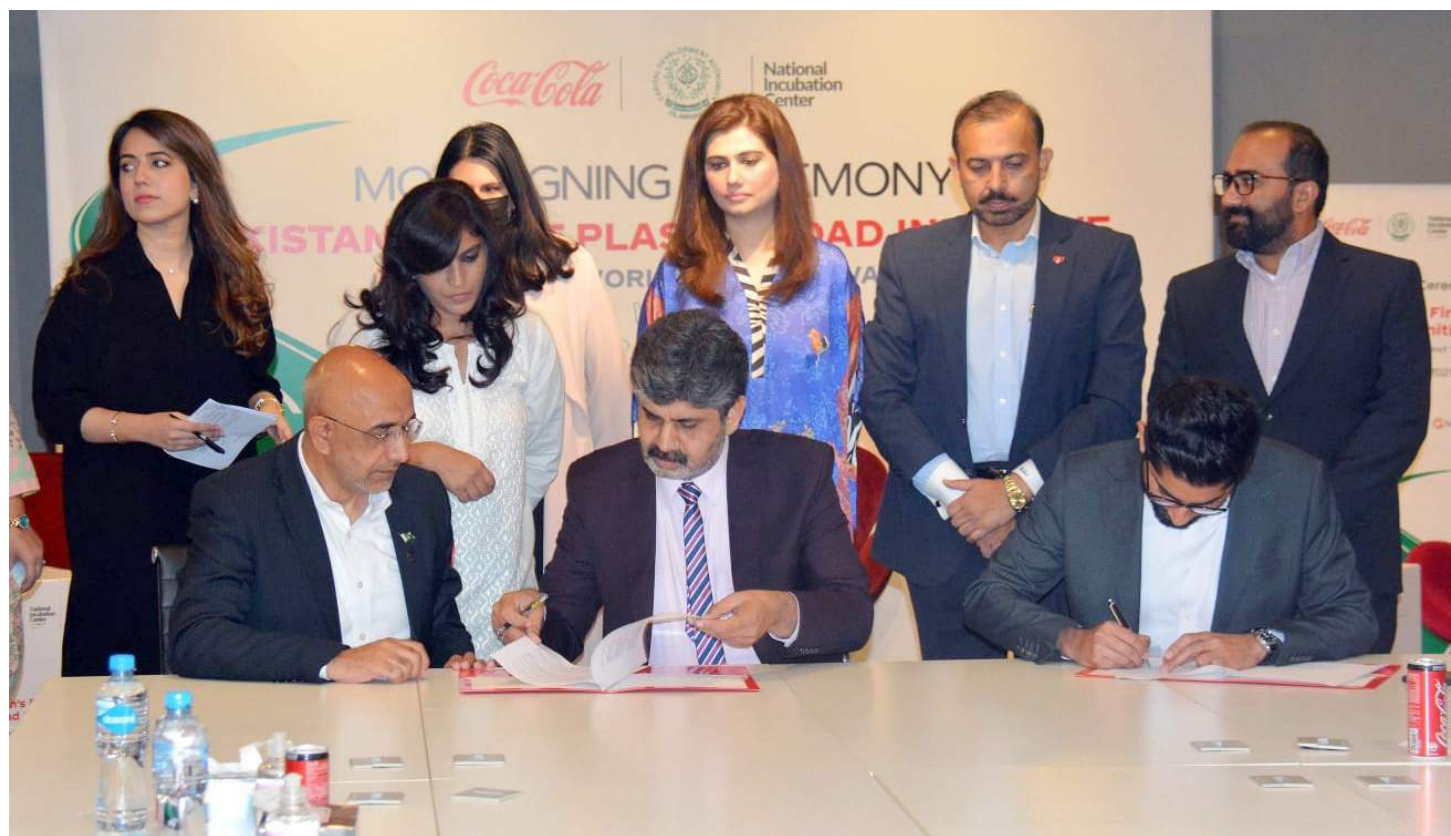
ISLAMABAD: Coca-Cola Pakistan and Afghanistan, Capital Development Authority, Team Up / National Incubation Center (NIC) sign MoU to introduce the concept of re-carpeting national roads with plastic waste.

that is all a policy adviser can do for a country. Policy making have to be indigenous, encompassing all stakeholders - policy makers, scientists, politicians, and private sector. She said, private sector is a major player in innovation sector. We all know that innovation works in a cohesive and coherent system, and all STI policies are intertwined. All the players in innovation system work like an orchestra. The innovation system only works when all elements work together. This two-day training delivered by national and international experts and more than 50 experts/policy makers from different institutions of OIC member states participated in this training course online.