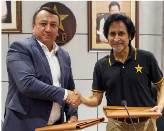
Additionally, the PCB will also explore the opportunity of inviting a team from Uzbekistan for participation in domestic tournaments in Pakistan. On the other hand TransGroup International has secured the rights for the domestic cricket season 2021-22 after signing-up with the Pakistan Cricket Board. Trans Group Inter-

ers at the National High Performance Centre, Lahore. These programmes will aim to improve the technical, tactical, mental and game abilities of the players in Uzbekistan. The PCB will also send its staff to deliver game development programmes in Uzbekistan which will include preliminary curator and grounds staff courses, PCB Level 1 Umpiring Course, Advanced Level 2 Coaching Course, training and analysts courses for various levels will also be conducted. The PCB will also help prepare Uzbekistan players on life skills and provide guidance on anti-doping, anti-corruption and code of conduct obligations.