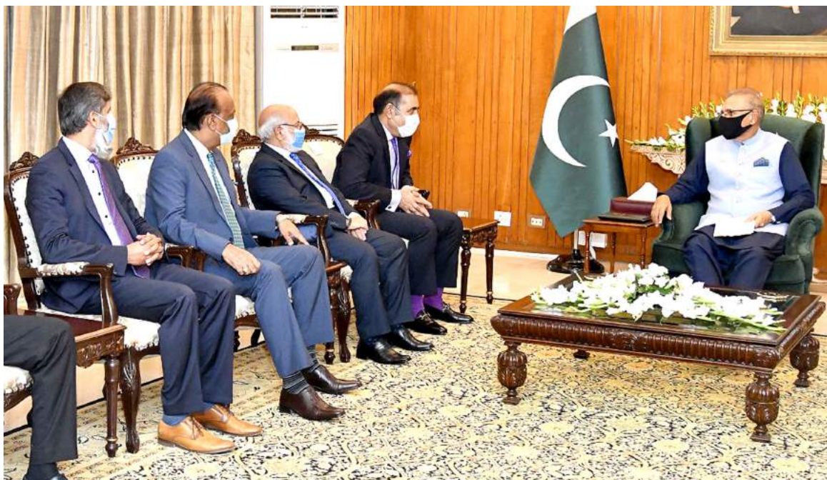
ISLAMABAD: A delegation of Rawalpindi Chamber of Commerce and Industry called on President Dr Arif Alvi, at Aiwan-e-Sadr.

biggest military powers - which aims to be a moderating influence at a time of US-Chinese tensions in the Indo-Pacific region - deserves more respect. US President Joe Biden attempted to smooth the waters by requesting a telephone call with his French counterpart. But Macron has appeared in no hurry to grant him an audience. On Tuesday, he held talks with Indian Prime Minister Narendra Modi, where the two vowed to work together to promote stability in the Indo-Pacific area in a way that precludes "any form of hegemony."