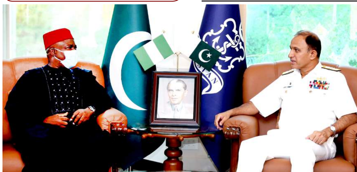
ISLAMABAD: Ambassador of Nigeria to Pakistan Mohammed Bello Abioye called on CNS Admiral Muhammad Amjad Khan Niazi and visited NHQ, Islamabad. Both dignitaries discussed matters of mutual interest, bilateral collaborations and maritime security in the region. — DNA

The judge summoned three more witnesses for testimony on next hearing and adjourned the case. It may be mentioned here that the reference had alleged the former minister for misusing his powers to allocate federation's funds for a provincial project. — APP