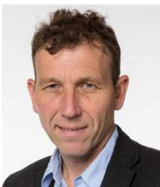
English cricket in a poor light. It has done significant damage to an already low reputation and ruined a relationship with a full-member

ultimate powerbroker, has been reduced to an events-organising company. It runs its properties well – World Cups, World Test Championships and the like – but has little standing where the game's moral issues are concerned and little influence over the game's direction." The ECB, in 'a poorly drafted press release' on Monday, announced it was withdrawing its sides from next month's tours of Pakistan due to 'mental and physical well-being of our players and support staff' and unideal "preparation for the ICC Men's T20 World Cup". "Its (ECB) performance shows