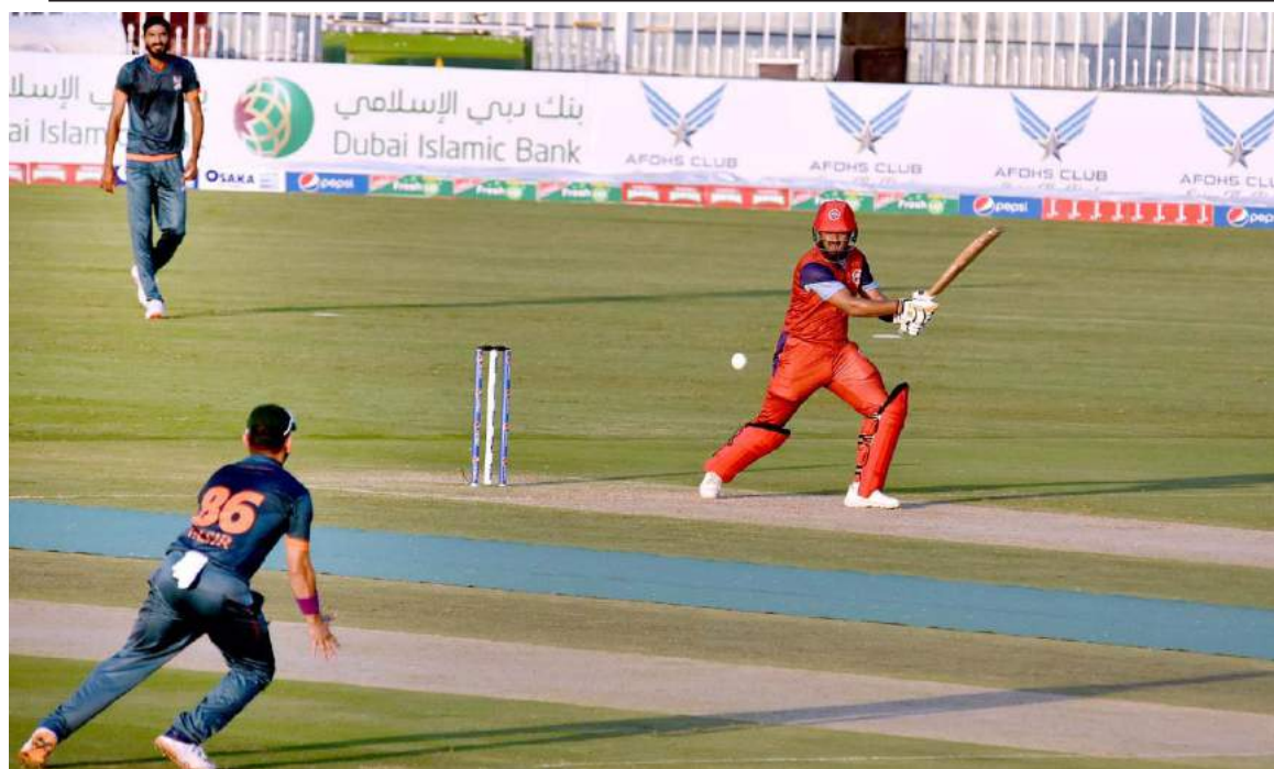
RAWALPINDI: A view of cricket match playing between Balochistan and Northern teams during National T-20 Cup 21-22 T20 cricket match at Rawalpindi Cricket Stadium.