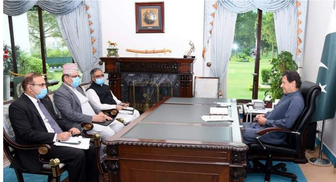
ISLAMABAD: Ambassador of Nepal to Pakistan Tapas Adhikari calls on Prime Minister of Pakistan Imran Khan.