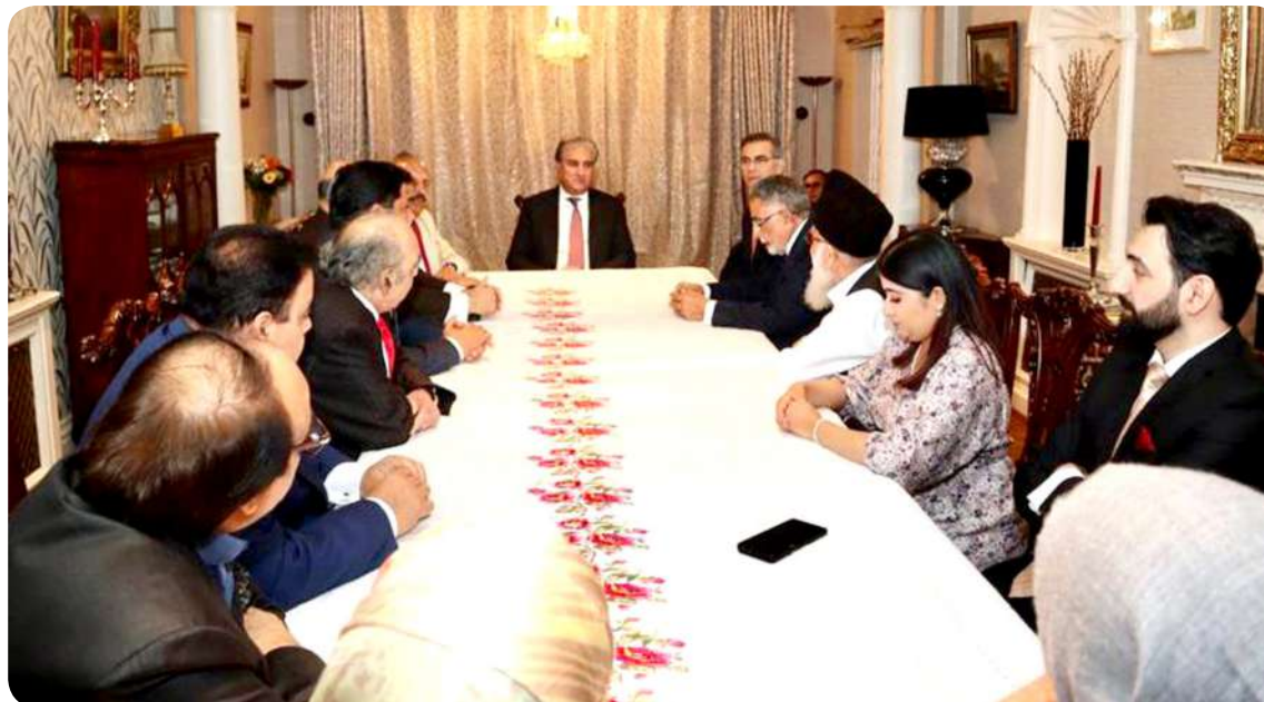
LONDON: Foreign Minister Shah Mahmood Qureshi meeting with UK based Kashmiri Leaders at Pakistan House London.