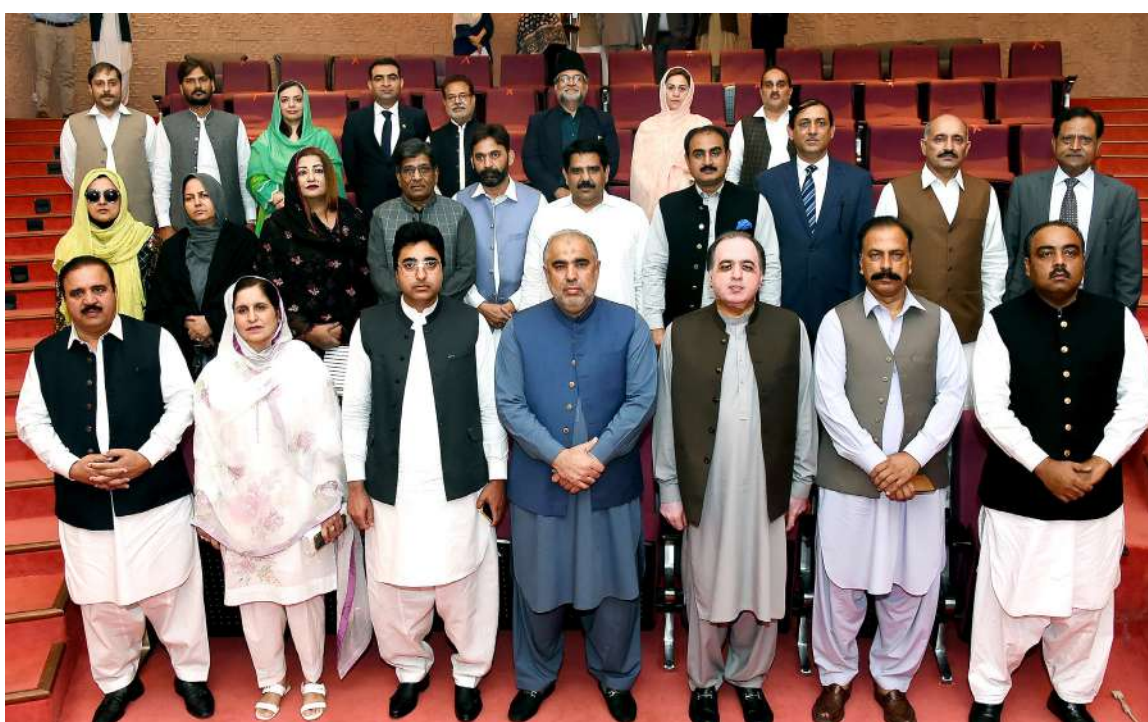
ISLAMABAD: Speaker National Assembly Asad Qaiser in a group photo with participants of inaugural session of the orientation programme for the MLAs of AJK Assembly at PIPS.

TARBELA: The water level of Tarbela Dam reservoir Monday has reduced to 1515.72 feet while power production also declined to 3283 megawatts. According to the Tarbela dam spokesperson, water inflow and power production once again started reducing and today it was 4020 megawatts where 16 power generations units out of 17 were working with full capacity and one power unit was shut down. The water inflow in the Tarbela Dam reservoir which remained 75000 cusec feet and outflow was 110000 cusecs. It was also disclosed that today no water was released for Pehur High-Level Canal (PHLC) to supply water for some areas of KPK for irrigation. - APP