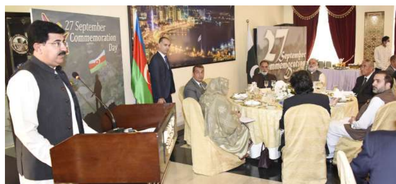
ISLAMABAD: Chairman Senate Sadiq Sanjrani addressing the event at Azerbaijan embassy.

ISLAMABAD: Chairman Senate Sadiq Sanjrani has said Pakistan and Azerbaijan enjoy excellent relations adding the victory in the Patriotic War against Armenia shows resilience and bravery of the Azerbaijani people. He said President of Azerbaijan Ilham Aliyev led the country from the front during the 44 days war. The Chairman Senate made these remarks on the occasion of Remembrance Day, organized by the Azerbaijan embassy, in which Federal Ministers, Senators and members of the civil as well diplomatic fraternity attended the event. Sadiq Sanjrani thanked the Azerbaijan ambassador for inviting him as chief guest. He extended warm felicitations on behalf of the Pakistan government and people on the historic victory. He said Pakistan was one of the first countries that recognized Azerbaijan. Pakistan is proud of its companionship with Azerbaijan adding bilateral relations would continue to grow with each passing day. Pakistan also condemns the Armenia terrorism committed against the innocent people of Azerbaijan. Pakistan sincerely recognizes the sacrifices rendered by the valiant Azerbaijani soldiers