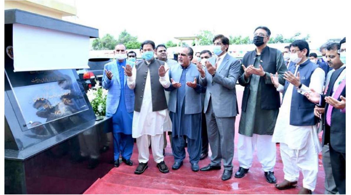
KARACHI: Prime Minister Imran Khan offers Dua after groundbreaking of KCR Infrastructure Project. - DNA

KARACHI: Prime Minister Imran Khan Monday while urging the Sindh government to reconsider Bundle Island project, called for renewed coordination between federal and provincial governments for successful accomplishment of mega projects. "Regarding problems of Karachi, both the federal and Sindh governments will have to move again together. All this is inter-connected. Some things federal government cannot do alone while others Sindh government cannot do solely without center's support," he said. Addressing the groundbreaking ceremony of Karachi Circular Railway project, the prime minister said the project would shift burden from Karachi's roads. Federal Ministers Asad Umar, Azam Swati, Chaudhry Fawad Hussain and Ali Haider Zaidi, Sindh Governor Imran Ismail and Chief Minister Syed Murad Ali Shah attended the ceremony besides senior officers.