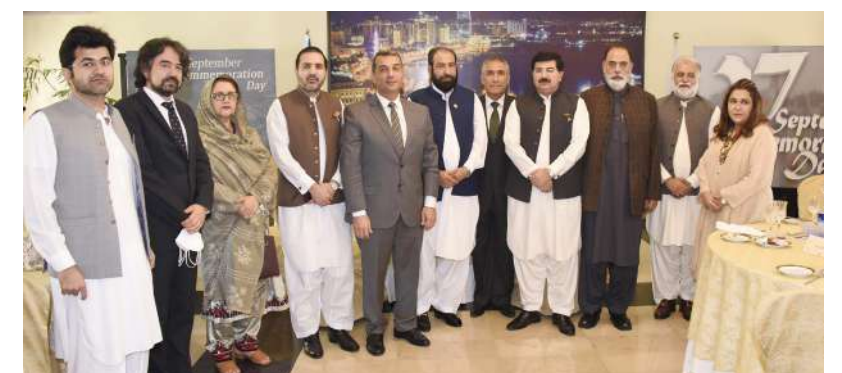
ISLAMABAD: Chairman Senate Sadiq Sanjrani, Ambassadors of Azerbaijan and Turkey in a group photo with other officials.

during the 44 day long war, he added. The Chairman Senate thanked Azerbaijan for its support on the issue of Indian occupied Kashmir. He also emphasized on further strengthening Pakistan-Azerbaijan parliamentary groups in order to further deepen the bilateral cooperation. Sadiq Sanjrani also congratulated President of Azerbaijan Ilham Aliyev over the great success in the Patriotic War. He said the exemplary cooperation between the two countries shows mutual trust. In every hour of need, the two countries have stood by each other. Paying tribute to the martyrs of Azerbaijan's war of independence, the Sen-