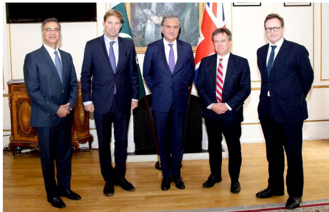
LONDON: Pakistan High Commissioner to the UK, Moazzam Ahmad Khan, Chair of House of Commons Select Committee for Defence Tobias Ellwood MP, Foreign Minister Makhdoom Shah Mahmood Qureshi, Henry Smith MP and Chair of House of Commons Select Committee for Foreign Affairs Tom Tugendhat MP at the Pakistan High Commission. —APP

istrations on the occasion of Chehram. Mobile service would be suspended on the recommendation of local administrations, he added. The minister said that the International Border Management System (IBMS) had been installed at Torkham and Chaman border to have data of incoming and outgoing people. He said that the NADRA had issued COVID-19 vaccine certificate to 7.5 million while the government had completed the vaccination of 76.1 million citizens across the country. The minister said that the ministry had decided to start work on e-passport to avoid all issues related to the passport.