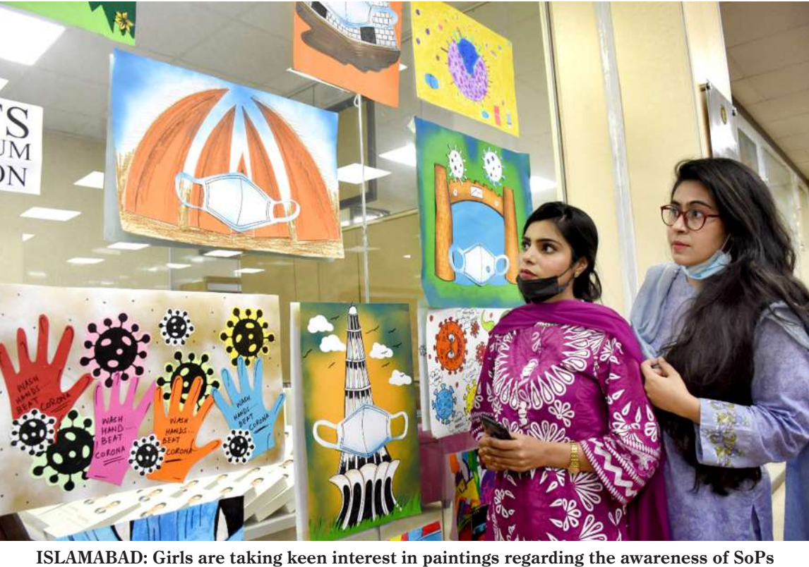
of Corona Virus at National Library. - DNA

tion centre in this city for the females. She said that a large number of young females are being passed out from the universities and of the society by launching their own businesses who will not only enhance the women role in overall develthe economic development of the country. She said that role of women in labour force is very negligible which should also need our focus and FWCCI is contemplating to start awareness sessions for the females in addition to making efforts to improve the working condition in overall industrial