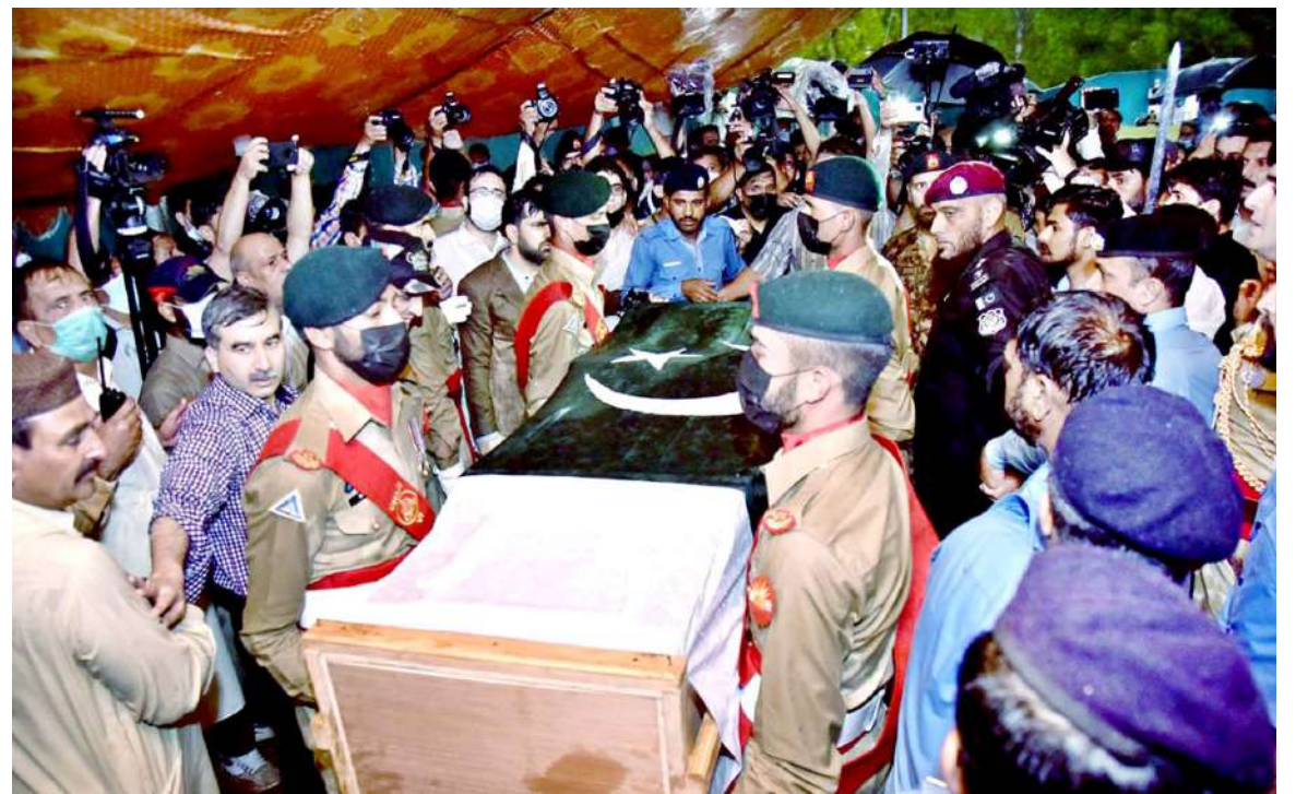
ISLAMABAD: Security personnel carrying the coffin of Dr. Abdul Qadeer Khan to offer the funeral prayer at the premises of Faisal Masjid.

ISLAMABAD: A crucial meeting of the Pakistan Democratic Movement (PDM) led by its chief Maulana Fazlur Rehman will be held in Islamabad today (Monday). The meeting will be participated by heads of all political parties of the alliance formed against the ruling Pakistan Tehreek-e-Insaf (PTI). According to reports in this regard, Fazl called prominent PDM leaders, wherein it was decided to offer the incumbent government a tough time from every front using the platform.