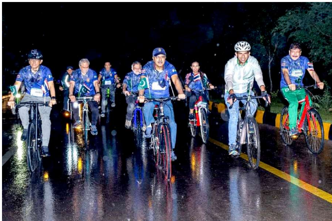
ISLAMABAD: To Celebrate the 70 years of the establishment of diplomatic relations between Pakistan and Thailand MOFA organized the bicycle friendship event.

The demonstrations are set to start at 1600 GMT. After the collapse of the Communist regime in 1989, Poland joined the EU in 2004 along with several countries in Central and Eastern Europe. EU membership remains very popular according to opinion polls but relations between Warsaw and Brussels have become strained since the populist Law and Justice (PiS) party came to power in 2015.