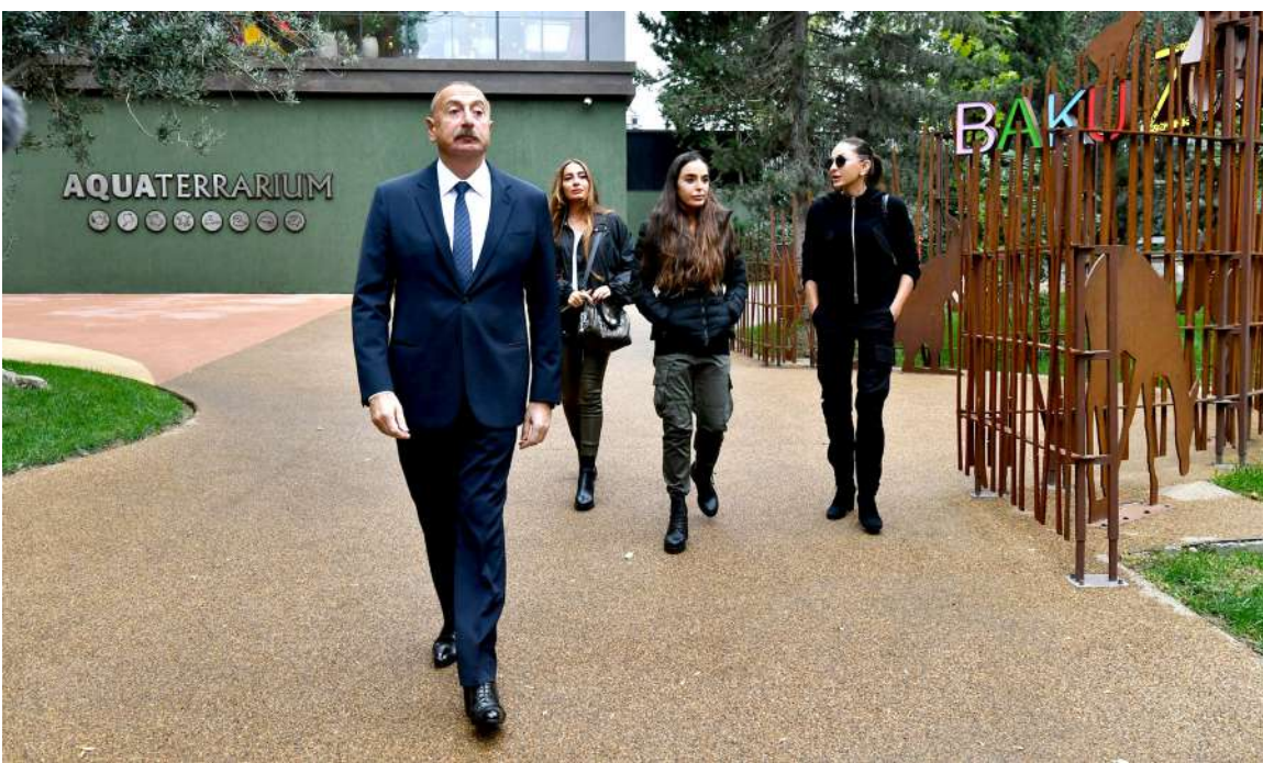
BAKU: Baku Zoo was opened after reconstruction. President Ilham Aliyev and First Lady Mehriban Aliyeva attended the opening.

"Reunification now is not appropriate. But we are in no position to declare independence because the international community will not recognise us. It's useless," he said.