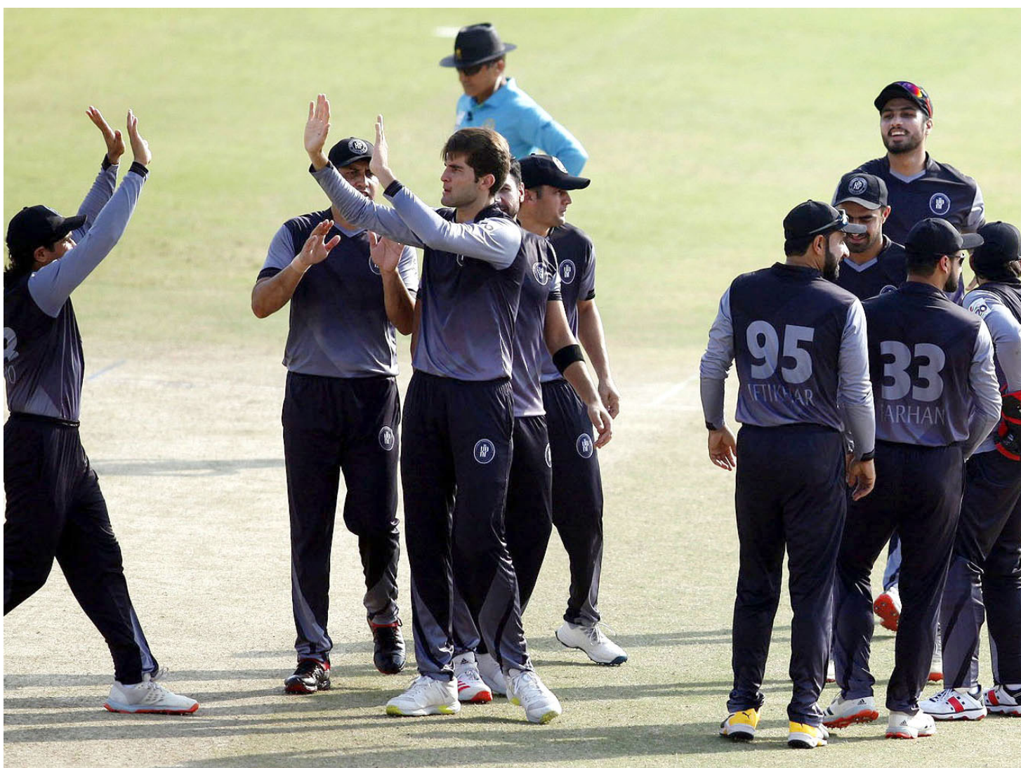
RAWALPINDI: Players of KPK Cricket team expressing jimjams during their match with Sui Gas team, at Rawalpindi Stadium, on Sunday.

I'm sure that relations between Korea and Pakistan will be even more strengthened in the years to come, he concluded.