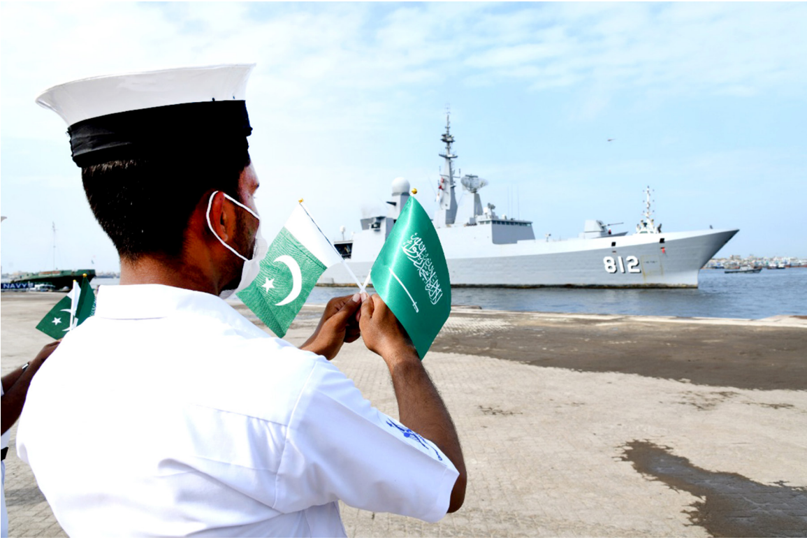
KARACHI: View of Royal Forces ship HMS Al Riyadh arriving at Karachi Harbour to participate in PN and RSNF bilateral exercise Naseem Al Bahr XIII.