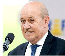
last month, after Australia canceled a previous $40 billion French-designed submarine deal, to build instead at least eight nucle-

PARIS: French Foreign Minister Jean-Yves Le Drian will hold talks with United States Secretary of State Antony Blinken on Oct 5, in which the two will aim to work on restoring confidence between the two countries, said a statement from Le Drian's office. Diplomatic relations between the United States and France hit a low point