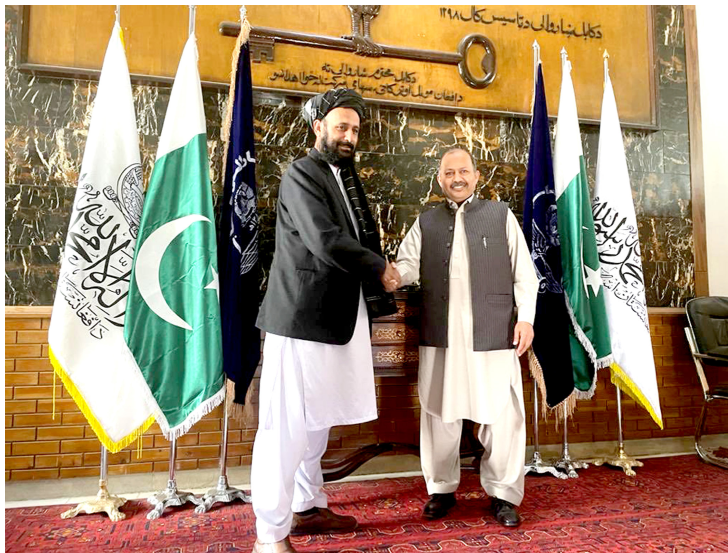
KABUL: Pakistan's ambassador to Afghanistan, Mansoor Ahmad Khan calls on Mayor of Kabul Hamidullah Noman.

The country is emerging from almost two decades of conflict and insurgency since the 2003 US-led invasion toppled dictator Saddam Hussein, promising to bring freedom and democracy. Although security has improved in recent years, elections threaten new volatility in a nation still terrorised by militant attacks and where major political factions are heavily armed. It is feared turnout will again be low among the 25 million eligible voters, many of whom are deeply disillusioned and view the entire political class as inept and corrupt. — Web News