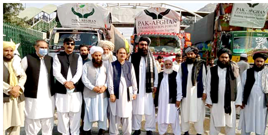
TORKHAM: Pakistani officials handing over aid to Afghan officials at Torkham border.

toll to 448,573. Majority of the new cases, 13,834 infections and 95 related deaths, were reported from the southern state of Kerala. According to the ministry, there are still 273,889 active COVID-19 cases in the country. So far 33,068,599 people have been successfully cured and discharged from hospitals, out of which 25,455 were discharged during the past 24 hours.