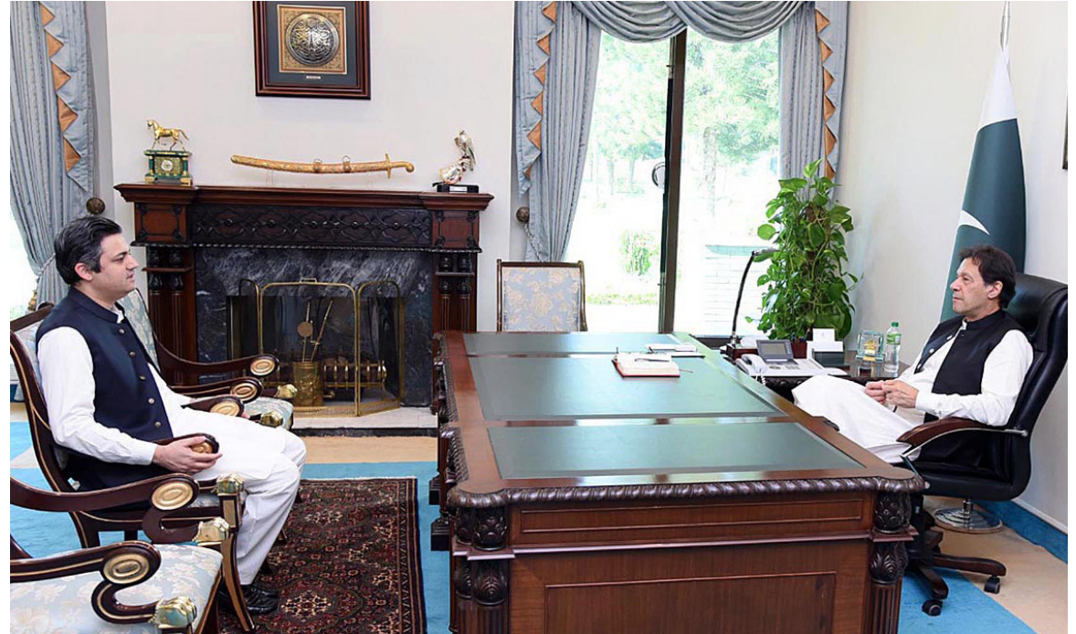
ISLAMABAD: Federal Minister for Energy Hammad Azhar calls on PM Imran Khan.