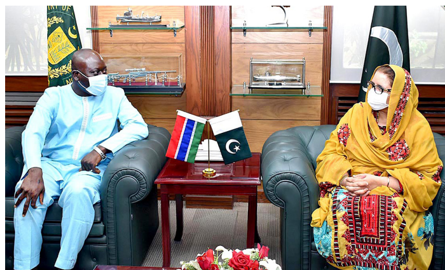
RAWALPINDI: Minister of Information and Communication Infrastructure, Ebrima Sillah, calls on Zobiaida Jalal, Federal Minister for Defence Production.