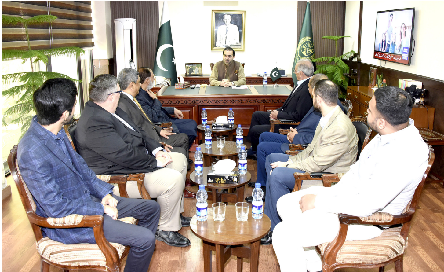
ISLAMABAD: Deputy Chairman Senate, Mirza Muhammad Afridi exchanging views with a delegation of businessmen from USA at Parliament House. — DNA

The participants termed CVE policy formulation a positive step in Pakistan's path towards peace and ensured complete cooperation in the formulation of a holistic policy. — APP