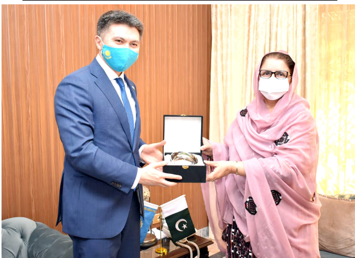
RAWALPINDI: Ms Zobiaida Jalal Federal Minister for Defense Production is presenting souvenir to HE Mr Yerzhan Kistafin Ambassador of Republic of Kazakhstan in Islamabad. —DNA

The awareness was created through an aggressive campaign of reaching out to Japanese companies and supply chains; an improved compliance of standard requirements on the supply side; and, an experience-based increasing interest, acceptance and confidence of Japanese buyers in Pakistani products, it added. — APP