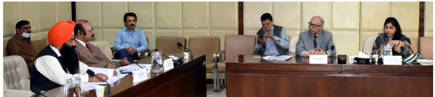
ISLAMABAD: Senator Irfan ul Haq Siddiqui, convener sub-committee of the senate standing committee on IPC presiding over a meeting of the committee at parliament house Islamabad.

Committee in this cause, terming this a great service to Pakistan, enhancing its soft image in the world, adding that he welcomed media suggestions regarding improvement of sports in Pakistan. The media recommended that the Pakistan Sports Board must be summoned to get a clear picture of the sports landscape in Pakistan. They added that Olympians and legendary sports persons must be invited to get a firsthand account of the challenges they face in the Country.