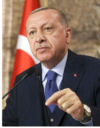
common ground with African countries against the threat of the Fetullah Terrorist Organization (FETO), the group behind the 2016 defeated coup in Turkey.

abuse Turkey's rights," he added. In 2017, when its protracted efforts to buy the Patriot air defense system from the US proved fruitless, Turkey signed a contract with Russia to acquire its S-400 defense system. Last year the US suspended Turkey from the F-35 jet program, claiming the S-400s would expose the F-35s to possible Russian subterfuge. Turkey, however, stressed that the S-400 would not be integrated into NATO systems and poses no threat to the alliance or its armament. It has repeatedly urged a working group to clear up the technical compatibility issues. On his visits this week to Angola, Togo, and Nigeria, Erdogan stressed Turkey's efforts to forge