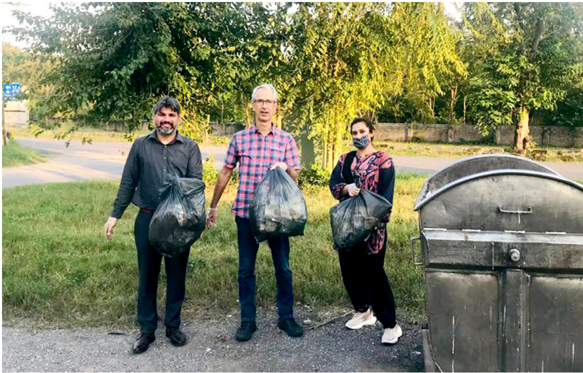
ISLAMABAD: Wouter Plomp, Netherlands ambassador to Pakistan, join 7daychallenge initiated by Swedish embassy and WWF Pakistan. Team Netherlands collected plastic waste to clean the streets.