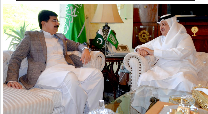
ISLAMABAD: Ambassador of Saudi Arabia Nawaf Saeed Al Maliki in a meeting with Chairman Senate Sadiq Sanjrani.

ISLAMABAD: Pakistan Peoples Party (PPP) leader Qamar Zaman Kaira said that Khurshid Shah has paid price of loyalty to his party and democracy. Supreme Court on Thursday approved bail plea of PPP leader Khurshid Shah in assets case after Sindh High Court rejected his bail petition. Qamar Zaman Kaira, while talking to media persons along with Nayyar Bukhari outside the apex court, said that case against the PPP leader was filed with malicious intent but arrests and jails are not a big deal for political workers. Kaira further said that PPP only takes directions from public and the party does not give importance to instructions from anywhere else. He further said that PPP was the first party to protest against rising inflation in the country.