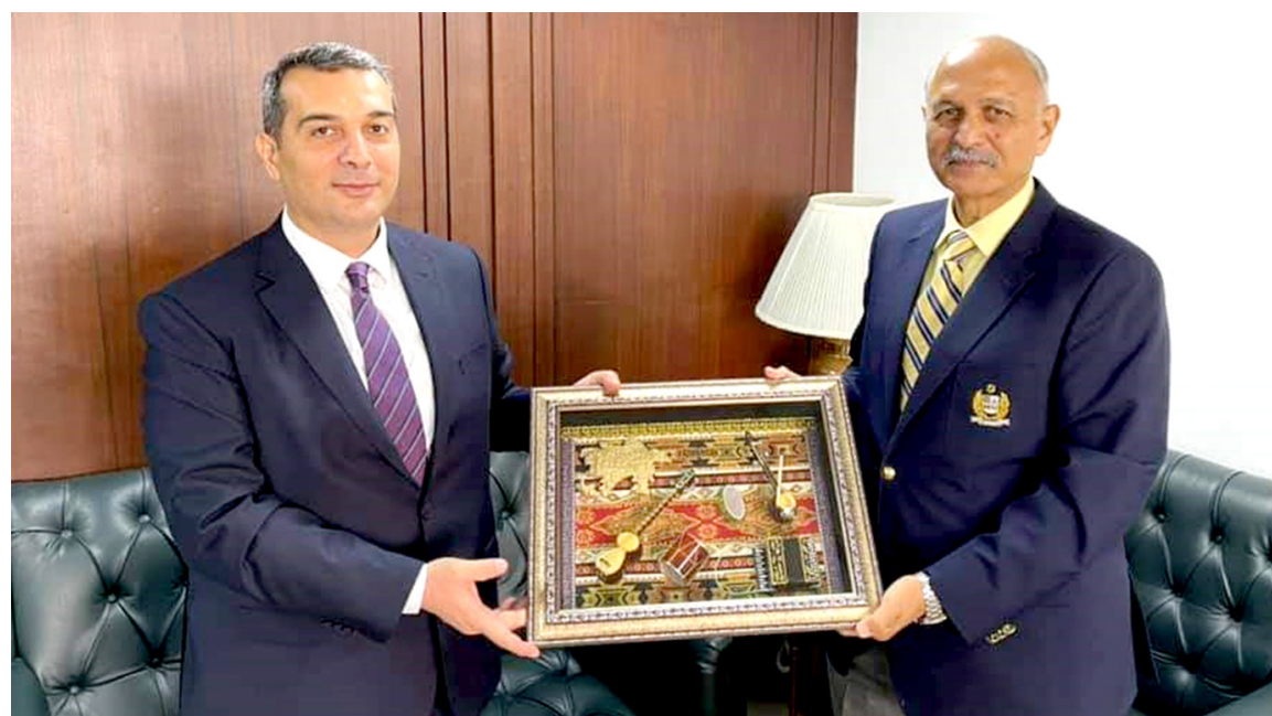
ISLAMABAD: Ambassador of Azerbaijan to Pakistan Khazar Farhadov met with Mushahid Hussain Syed, Chairman of Defence Committee of Senate of the Islamic Republic of Pakistan.

of Lahore police's operation wings, the members of the banned outfit also threw petrol bombs on police. According to the spokesperson, the protesters attacked the police when they tried to refrain them from destroying the public and government properties. The spokesperson added that the protesters attacked the police with sticks and also pelted stones on them. The spokesperson said the policemen are standing their ground in order to keep the writ of the state and showing restraint and tolerance in response to the violent protesters.