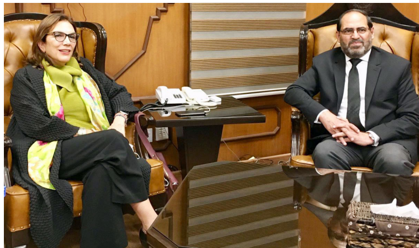
QUETTA: Ambassador of European Union Androullah Kaminara meeting with Chief Justice Balochistan High Court Hon. Justice Naeem Akhtar Afghan on justice sector development in Balochistan, in view of our Rule of Law program including capacity building aspects.