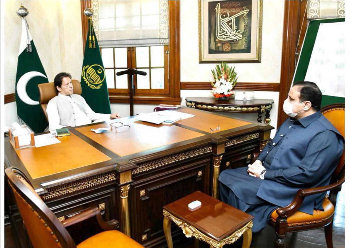
LAHORE: Chief Minister Punjab Sardar Usman Buzdar called on Prime Minister Imran Khan.