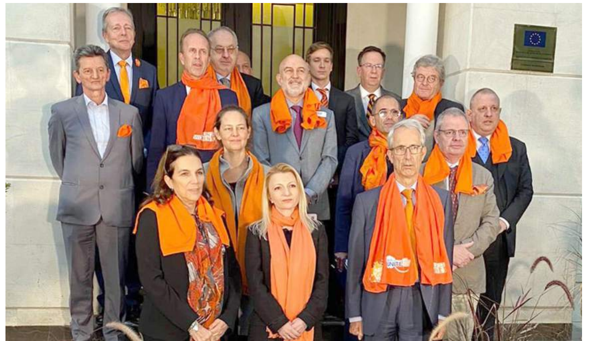
ISLAMABAD: Ambassadors of European Union photographed on the occasion of International Day of Combating Violence Against Women, at the EU residence.

developments in Afghanistan and with particular reference to enhanced military cooperation in the field of training and counter-terrorism domains were discussed during the meeting. COAS said that Pakistan values Italy's role in global and regional affairs and we look forward to enhancing our bilateral relationship. Chief of Army Staff also emphasized the urgency for swiftly devising an institutional mechanism for channelling humanitarian assistance to Afghanistan in order to avert a looming humanitarian catastrophe. He asserted that "Peace in Afghanistan means peace in Pakistan". The visiting dignitary acknowledged the professionalism of the Pakistan Armed Forces and vowed to enhance cooperation in various fields. He also appreciated Pakistan's role in the Afghan situation, special efforts for border management and role in regional stability.