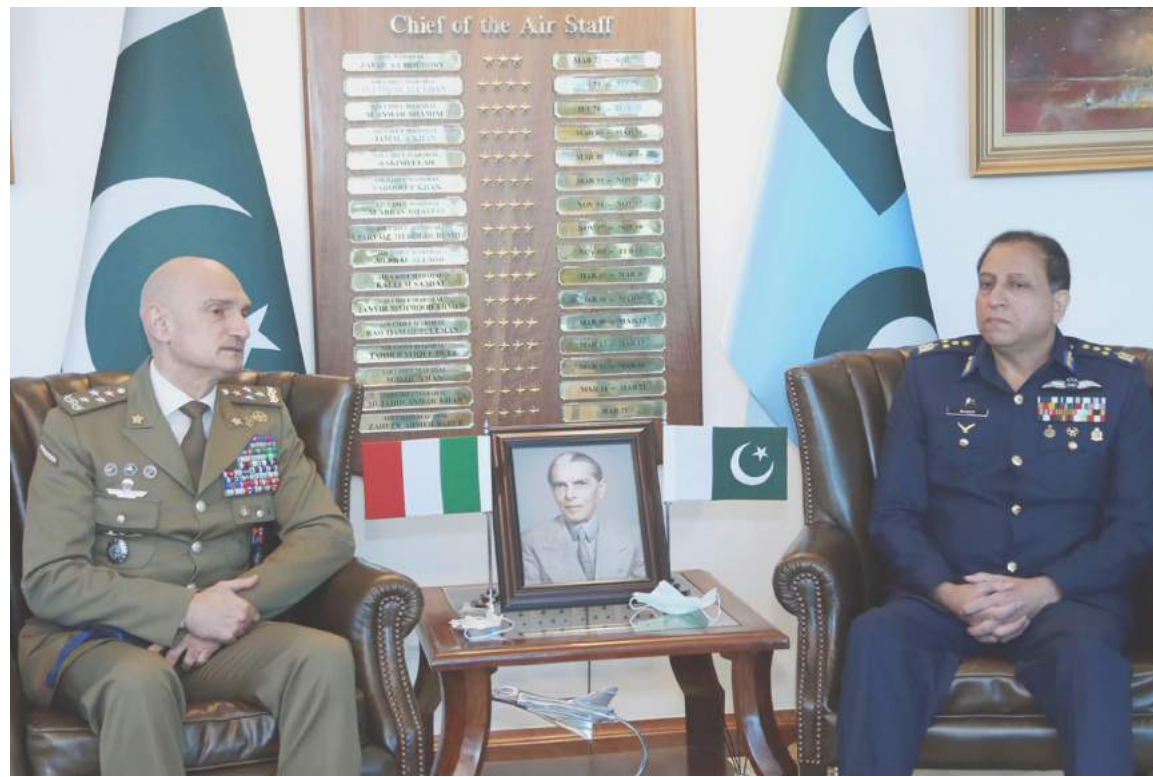
ISLAMABAD: Lieutenant General Luciano Portolano, Secretary General of Defence & National Armaments Director, Italy called on Air Chief Marshal Zaheer Ahmed Baber Sidhu, Chief of the Air Staff, Pakistan Air Force.