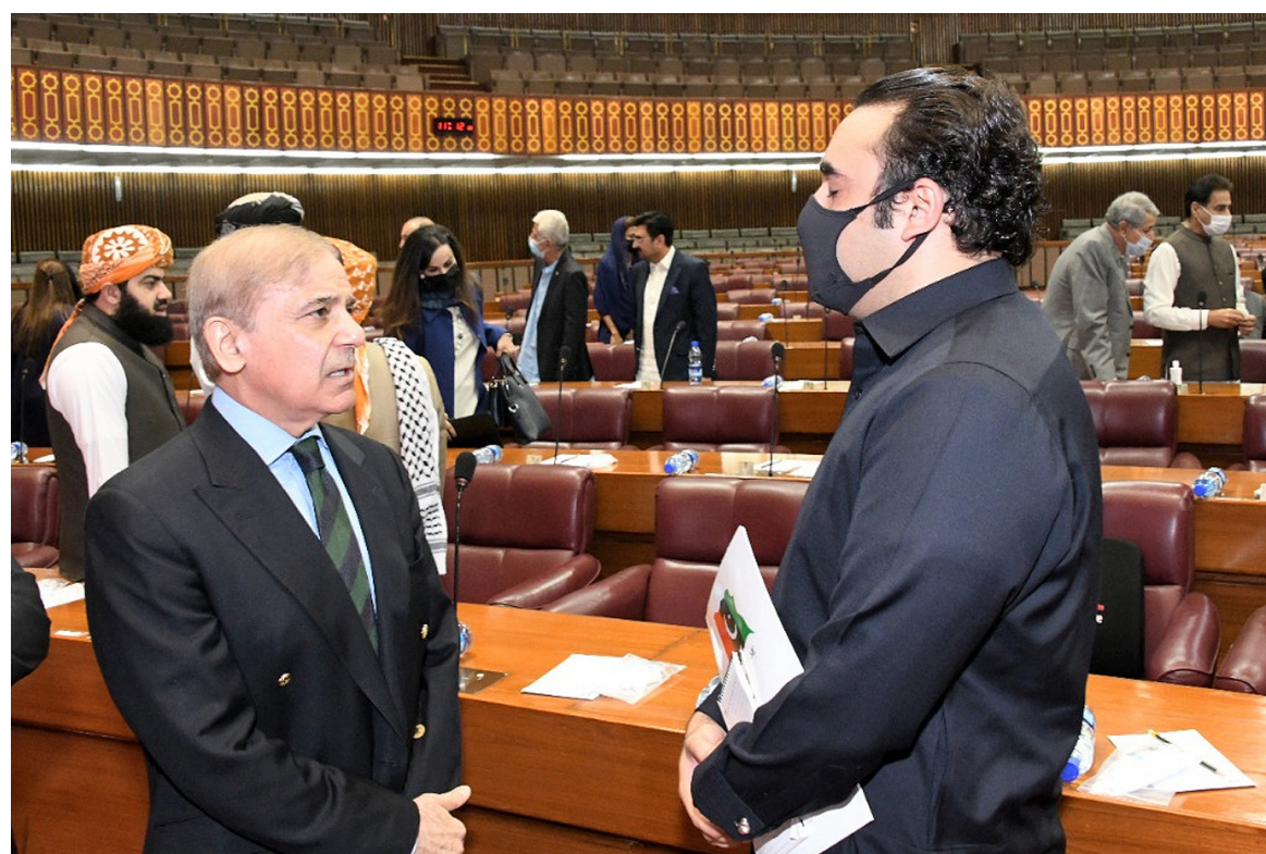
ISLAMABAD: Leader of the Opposition in National Assembly Shahbaz Sharif talking to PPP Chairman Bilawal Bhutto Zardari.

ban after the cabinet's approval on a circulation summary moved by the Interior Ministry at the request of the Punjab government. The interior ministry had banned the TLP under Rule 11-b of the Anti-Terrorism Act 1997. After lifting the ban, the TLP would now be able to do political activities while seized accounts of the party were also likely to be restored in a couple of days. It has been mentioned that TLP would respect the rule of the law in future and would not create any law and order situation. The government on Sunday released the leaders of the TLP central council including Allama Farooq ul Hasan Qadri, Allama Ghulam Ghous Baghdadi, Engineer Hafeez Ullah.