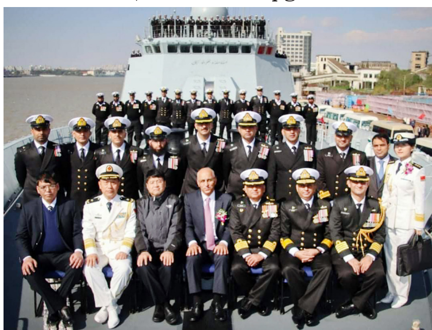
The Ship was a technologically advanced and highly capable Platform with enormous surface to surface, Surface to air and under water fire power besides extensive surveillance potentials. The Ship holds the capability to simulta-