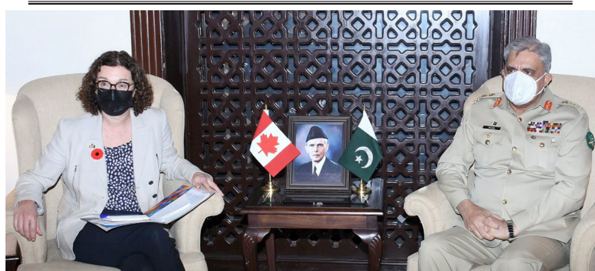
RAWALPINDI: Ms Marta Morgan, Deputy Foreign Minister of Canada called on General Qamar Javed Bajwa, Chief of Army Staff (COAS), on Monday.