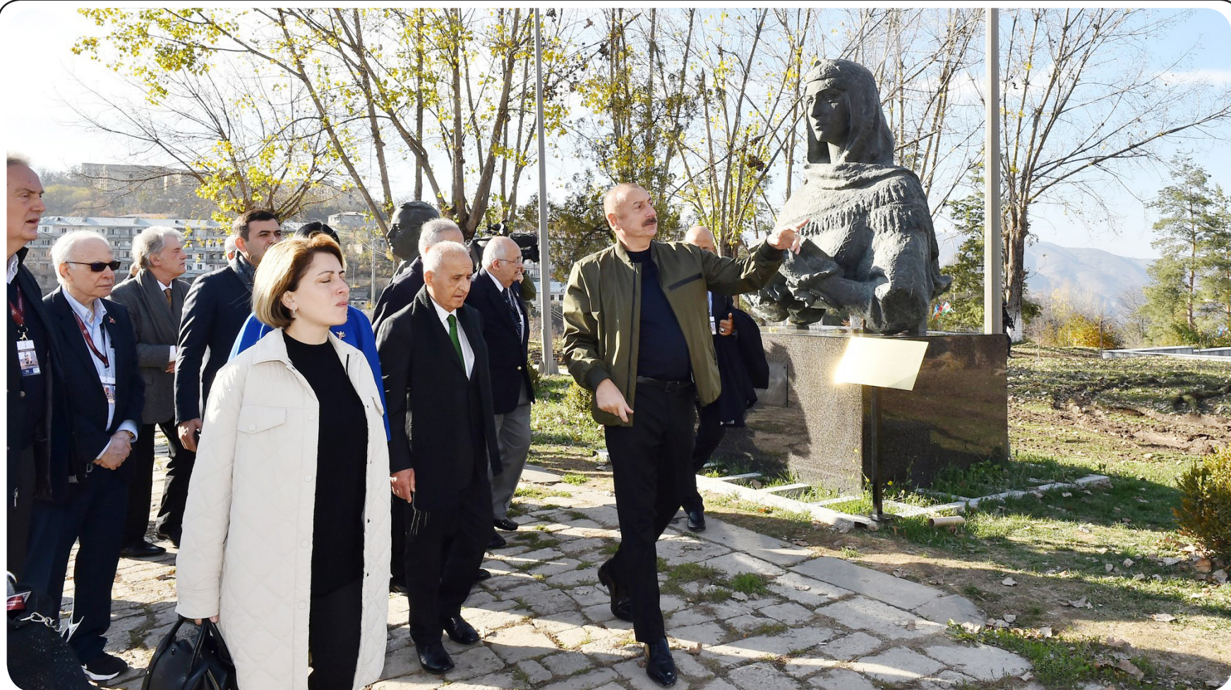
SHUSHA: President of Azerbaijan Ilham Aliyev visited Shusha on November 8, on the occasion of Victory Day celebrations, along with the delegates of Baku Forum. The President briefed them about the development and rehabilitation work going on in Baku.

Replying to a question, Shahbaz Sharif said that no matter what the issue was, the Prime Minister never came, his role was highly reprehensible. Bilawal Bhutto Zardari said that incompetent and incompetent government will be ousted together. Since the imposition of PTIF, inflation has increased and people are worried. This is the important point on which the entire opposition has gathered. For the sake of problems, whether it is inflation or the attempt to vote through EVMs or political revenge, we are united against it as far as Parliament is concerned. He said that together we will raise the issues of the people, expose the failed policies of the government.