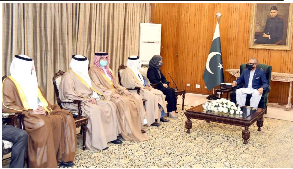
ISLAMABAD: President Dr Arif Alvi in a meeting with the visiting parliamentary delegation of Bahrain, led by the Speaker of the Council of Representatives of Bahrain, Mrs. Fawzia Bint Abdulla Zainal, at Aiwan-e-Sadr.

ISLAMABAD: The Cabinet Committee on Energy (CCOE) was informed on Thursday that the enhanced demand of domestic consumers would be met through savings from captive power generation. The meeting presided over by Federal Minister for Planning, Development, and Special Initiatives Asad Umar here was informed that the prudent pressure management plan would also be developed to ensure the stable supply of gas to the consumers. The Petroleum Division presented the projected natural gas supply and demand position in the country for the coming winter. During the meeting, Petroleum Division presented a detailed impact analysis of different policy options for the management of gas demand during winter 2021-22. Gas supply to CNG would be curtailed during the winters and industrial activity would also be a focus in the gas management plans, especially the export industry. The CCOE approved the demand side of the proposals submitted by the Petroleum Division. It was further directed that the CCoE would consider the supply side proposals in the next meeting. The CCoE also considered the summary presented by the Maritime Affairs Division on the construction of Oil Storage at Oil Installation Area Keamari, Karachi. The meeting was informed that insufficient storage infrastructure at the ports created a bottleneck in the supply chain and results in increased costs. - APP