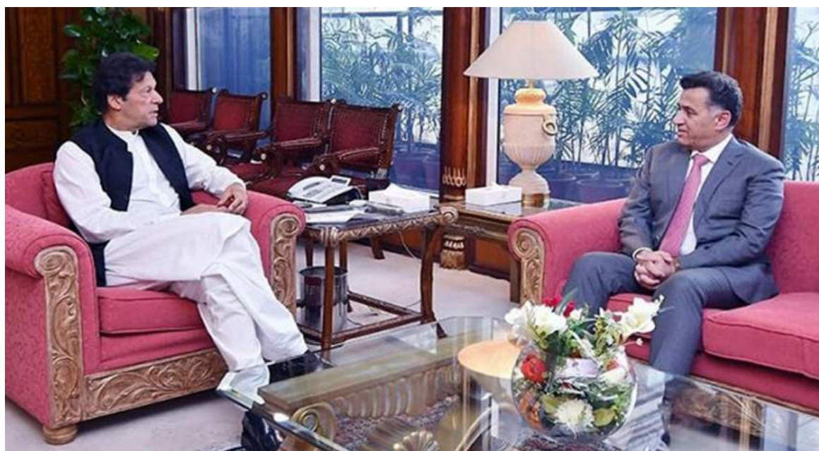
ISLAMABAD: Director-General of Inter-Services Intelligence (DG ISI) Lieutenant General Faiz Hameed pays a farewell call to Prime Minister Imran Khan.

our country as it has entered the new century and the new millennium as an independent state. You should be proud to be witnessing the glorious and dignified history of our victorious people," he said. Aliyev underlined that with the victory in the Patriotic War, the Azerbaijani army restored not only historical justice but also the rights and freedoms of more than a million refugees and IDPs, which had been violated for more than 30 years, "thus avenging our innocent children who fell victim to enemy provocations". He added that today Azerbaijan is on the path of rapid development. "The fact that our country is getting stronger and stronger every year is also a guarantee of your happy and prosperous future. The current generation will entrust mighty Azerbaijan to you. That is why you must always work hard and represent the Motherland with a deeper realization of your responsibilities. I believe that you, as a spiritually rich generation, will grow up in the spirit of Azerbaijanism and spare no effort for the future development and success of our Republic," he said. "Your [children] participation in this Forum, which brings together all Azerbaijani children, is a manifestation of the great confidence shown in you. I do hope that the discussions you will hold within the Forum will mark the beginning of a new stage in the implementation of our country's children policy," he added.