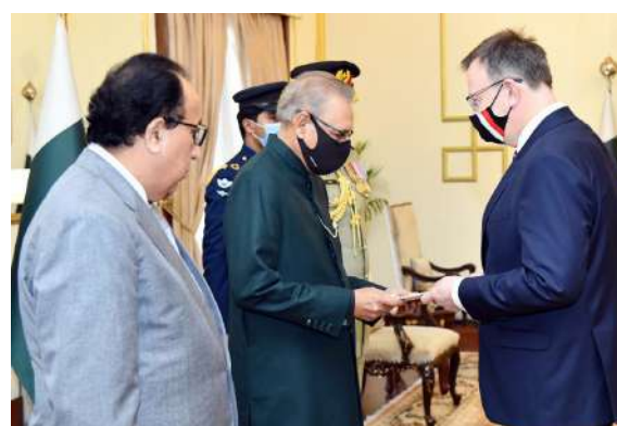
Ambassador of Poland

ISLAMABAD: President Dr Arif Alvi has said that Pakistan offers enormous investment opportunities and foreign businesses should take advantage of the business-friendly policies of the country, especially in agriculture, Information Technology, telecommunication, energy, and tourism sectors. The President expressed these views while talking to the Ambassador-designates of Japan, the Kingdom of Norway, the Republic of Poland, and the non-resident Ambassador-designate of the Kingdom of Cambodia who separately called on him, at Aiwan-e-Sadr. Earlier, the Ambassador-designate of Japan, Mr