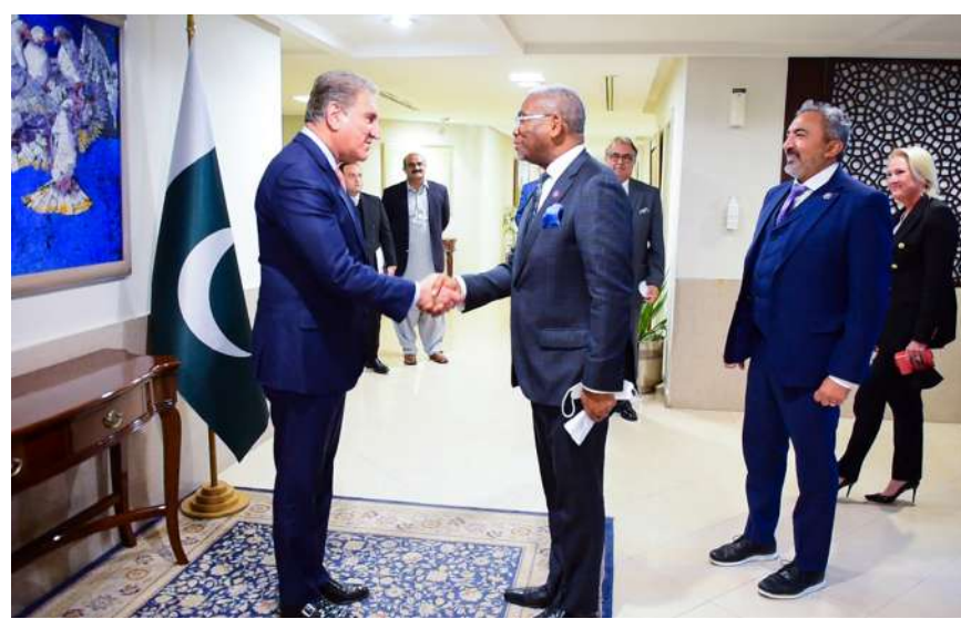
ISLAMABAD: Foreign minister Shah Mehmood Qureshi welcoming Gregory Meeks Chair House Foreign Affairs Committee.

security." The president also called for deepening cooperation in various areas such as defense, counter-terrorism, joint maritime search, countering transnational crime, rescue and exercise, and disaster management. "Joint efforts are needed to safeguard stability in the South China Sea and make it a sea of peace, friendship, and cooperation," he said. China will donate an additional 150 million doses of COVID-19 vaccines to ASEAN countries, Xi said, while Beijing will contribute an additional $5 million to the COVID-19 ASEAN Response Fund.