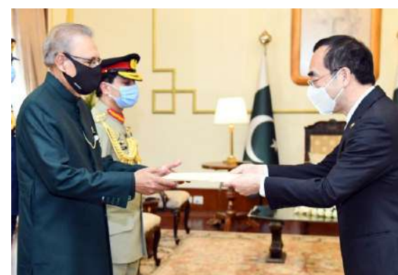
Ambassador of Japan