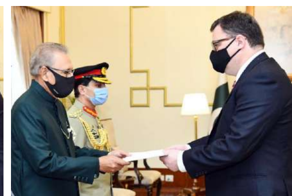
Ambassador of Norway

saying that the mutual trade needed to be taken to its fullest potential. He asked the ambassadors-designates to encourage the businesses of their respective countries to invest in Pakistan which is an attractive destination for investment. The Pres-