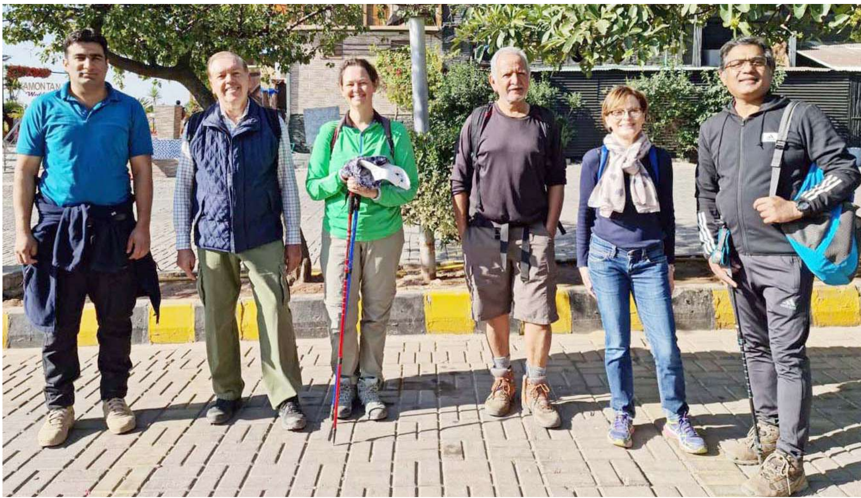
ISLAMABAD: Trekking friends enjoyed a gorgeous weather on the beautiful Trail 3 with a limited number of participants due to busy weekend schedules. – DNA