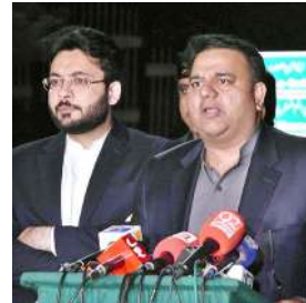
against judiciary and army and respect the Constitution which gives them full protection," he said while

ISLAMABAD: Minister for Information and Broadcasting Chaudhry Fawad Hussain on Monday advised the opposition to stop the campaign launched by them to malign the state institutions, duly protected by the Constitution. "I want to give advice to the opposition that it should stop running a campaign