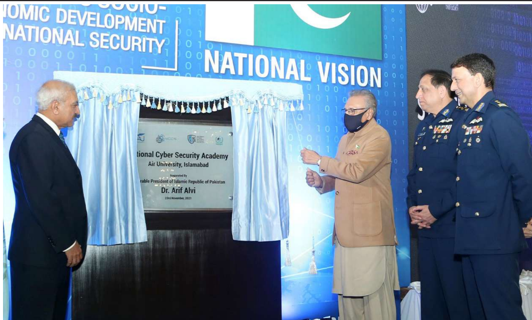
ISLAMABAD: President Dr. Arif Alvi inaugurated the country's first ever National Cyber Security Academy.