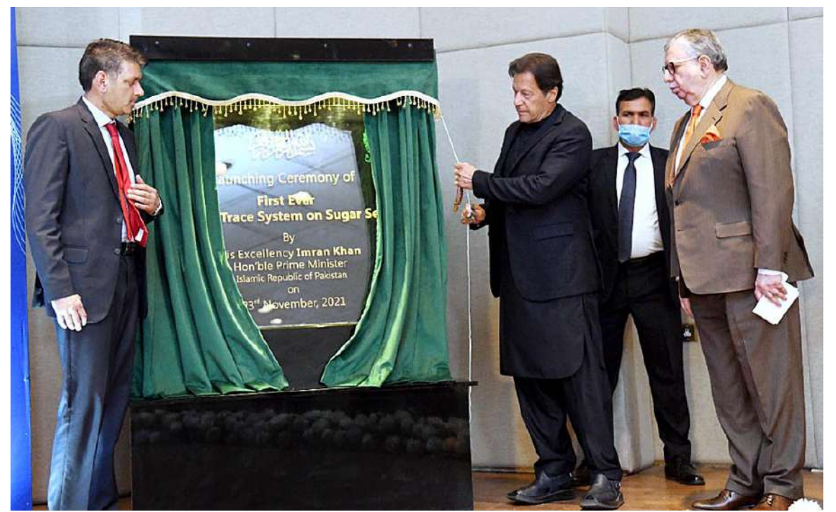
ISLAMABAD: Prime Minister Imran Khan launching Track and Trace System for Sugar Sector. - DNA