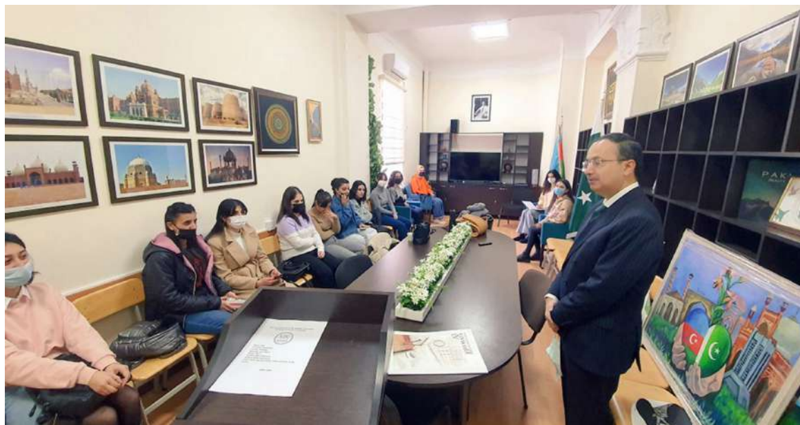
BAKU: Pakistan ambassador to Azerbaijan Bilal Hayee visit Pakistan Cultural Center Baku and got acquainted with the drawing competition to be held here. He met with students and answered questions about international journalism.

the forum will discuss the poet's influence on the formation of public attitudes and literature in different countries. Elnur Aliyev noted that the forum will gather prominent statesmen, scientists, representatives of the international organizations and the diplomatic corps. Among the guests are the Culture Minister of Turkey and Uzbekistan. The forum will feature panel discussions on the topics "The influence of Nizami's work on the political and social traditions of the medieval East", "Nizami Ganjavi: a view of the modern world" and others", etc.