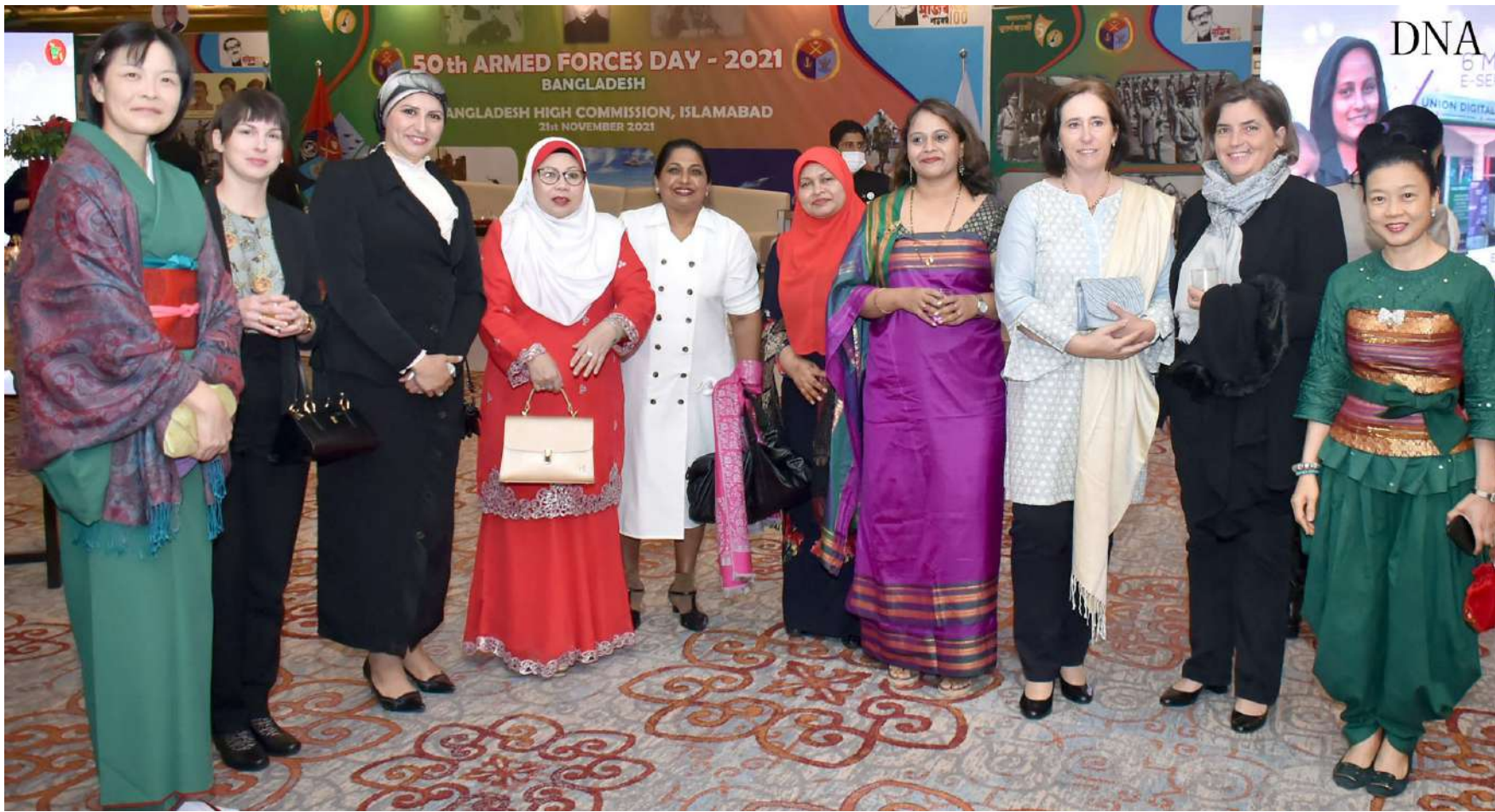
ISLAMABAD: Ladies posing for a group photo on the occasion of Armed Forces Day of Bangladesh.

He said that food policy would encourage involvement of community based workers for farmers awareness, creation of dedicated secretariat for Livestock sector and efficient use of allocated share of Irrigation water under Water Apportionment Accord 1991. — APP